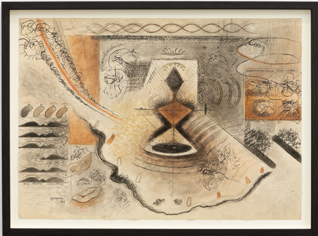
Alexandru Chira Untitled, 1983 ink and sanguine on paper 50 x 70 cm 19 3/4 x 27 1/2 in