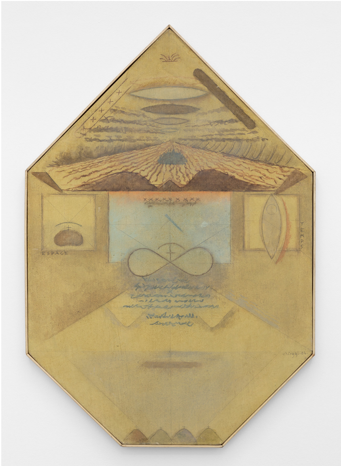
Alexandru Chira Study XIII, 1984 Oil, pencil and colored pencil on canvas 81 x 56 cm 31 7/8 x 22 in