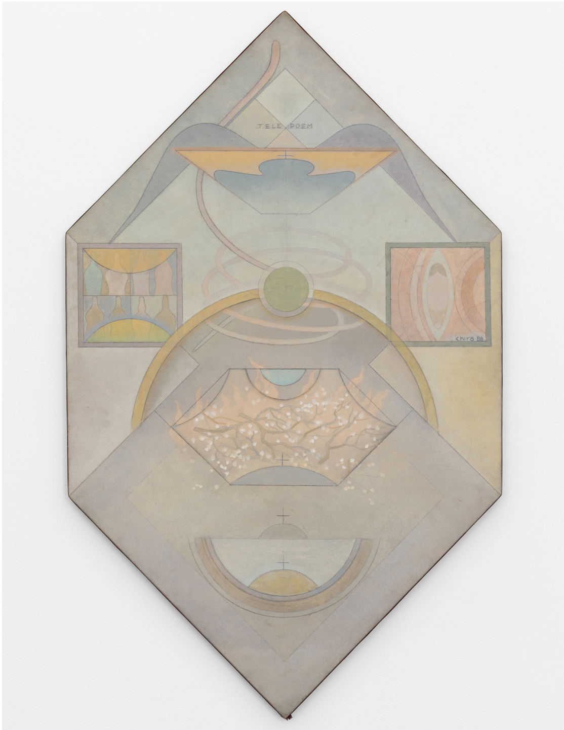
Alexandru Chira Tele-Poem (Study), 1988 Oil and pencil on canvas 109 x 67 cm 42 7/8 x 26 3/8 in