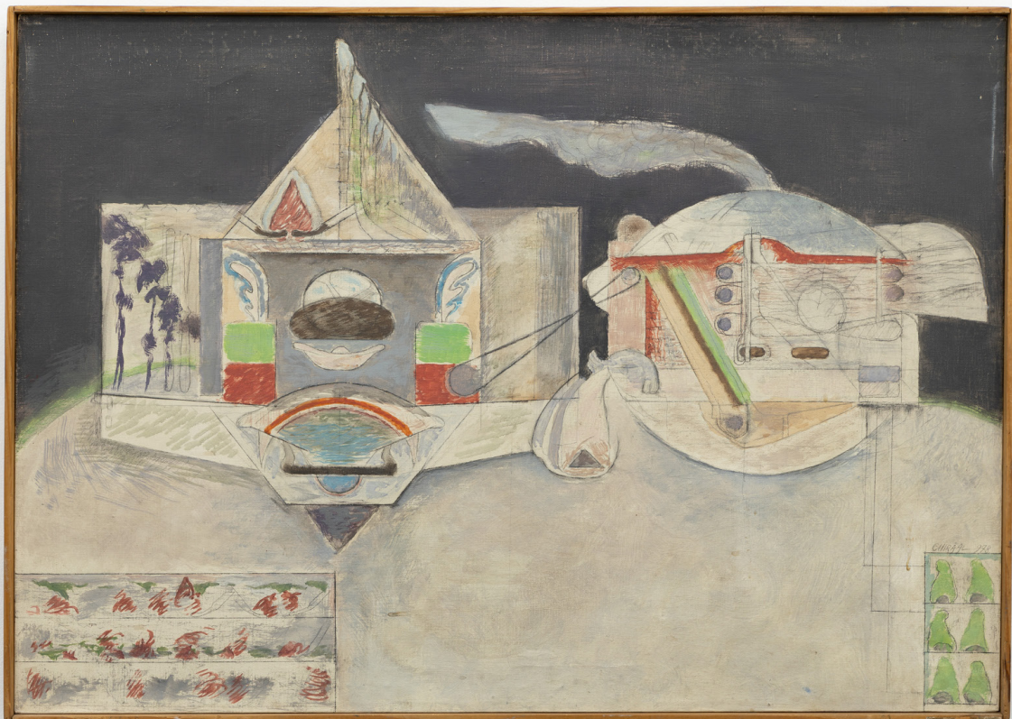
Alexandru Chira Stereopoem for Space and Time (Allegorical Chariot), 1978 Oil, pencil and colored pencil on canvas 65 x 92 cm 25 5/8 x 36 1/4 in