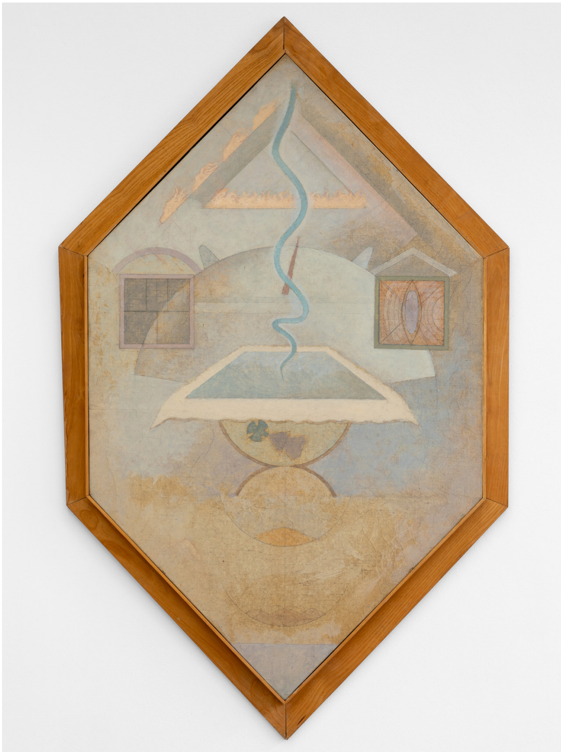
Alexandru Chira The Snake in the Geometer's House - Study for Tele-poem, c.1975 Oil, pencil and colored pencil on canvas 120 x 77 cm 47 1/4 x 30 1/4 in