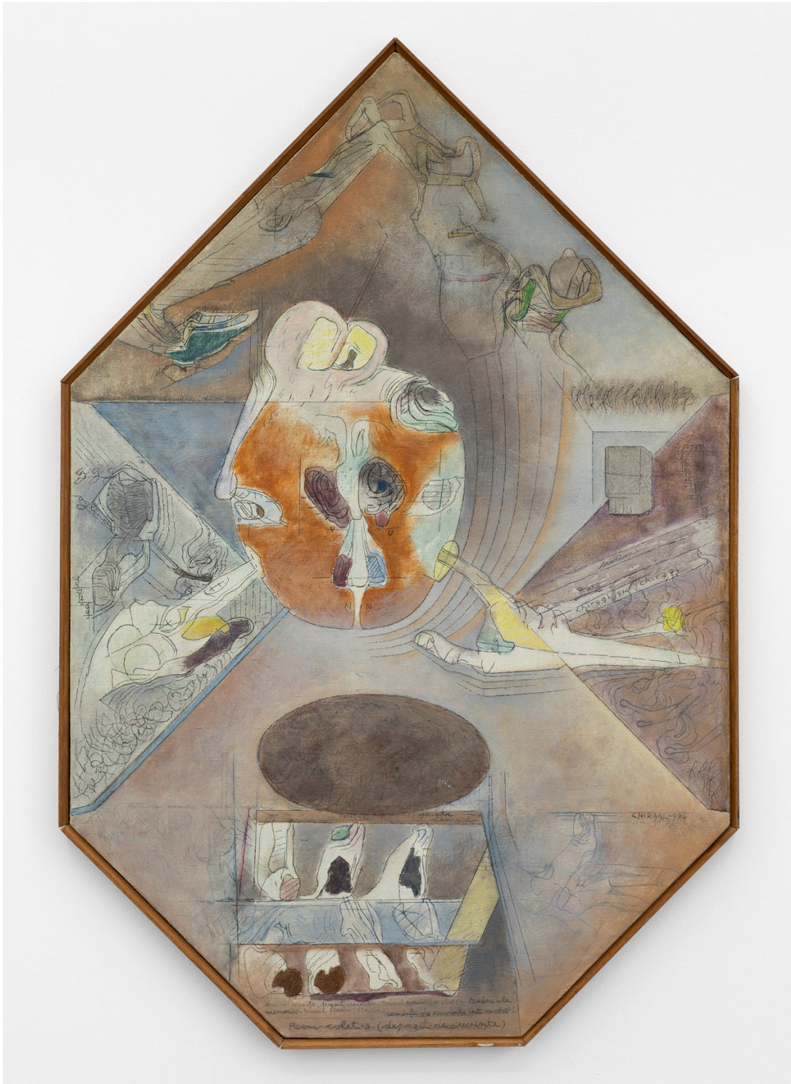
Alexandru Chira Package-Poem III - Stamps of Memory (Colorful Project), 1974 Oil, pencil and liner on canvas 114 x 77 cm 44 7/8 x 30 1/4 in