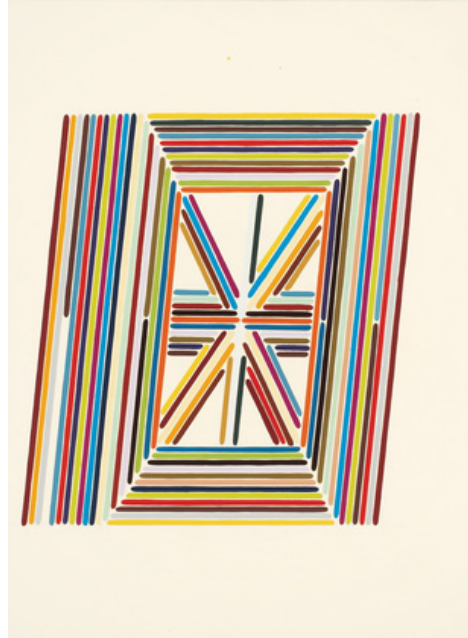
Tauba Auerbach. The Whole Alphabet, From the Center Out, Digital, V. 2006 . Gouache on paper on panel 30 x 22" (76.2 x 55.9 cm). Private Collection © 2011 Tauba Auerbach. Courtesy Paula Cooper Gallery, New York

Additional funding is provided by The Junior Associates of The Museum of Modern Art .