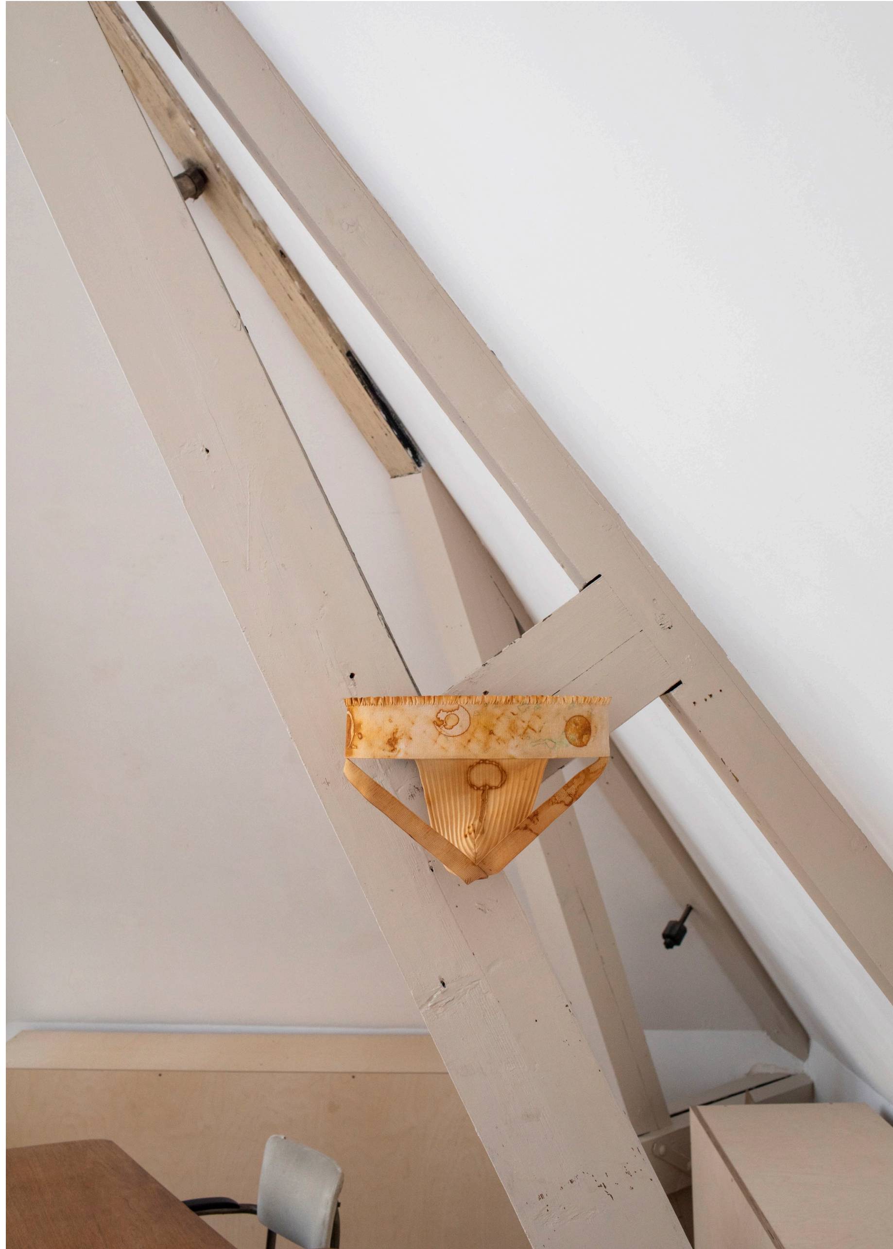
12. Dagmar Bosma, Tough and Tender , jockstrap made from rust- and copper dyed elastic textile, metal holder, 2024.