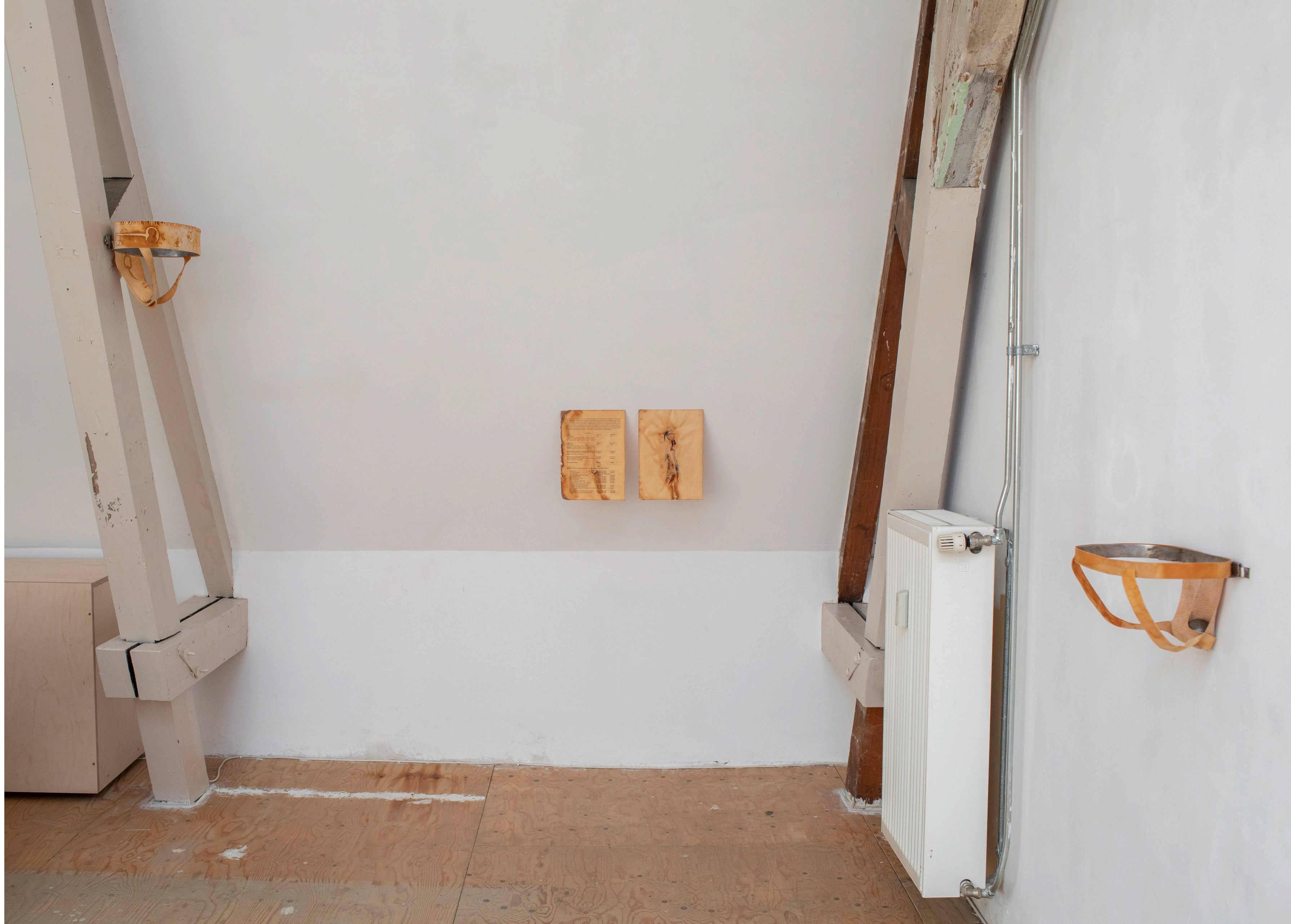
14. Dagmar Bosma, Tough and Tender , exhibition view, 2024.