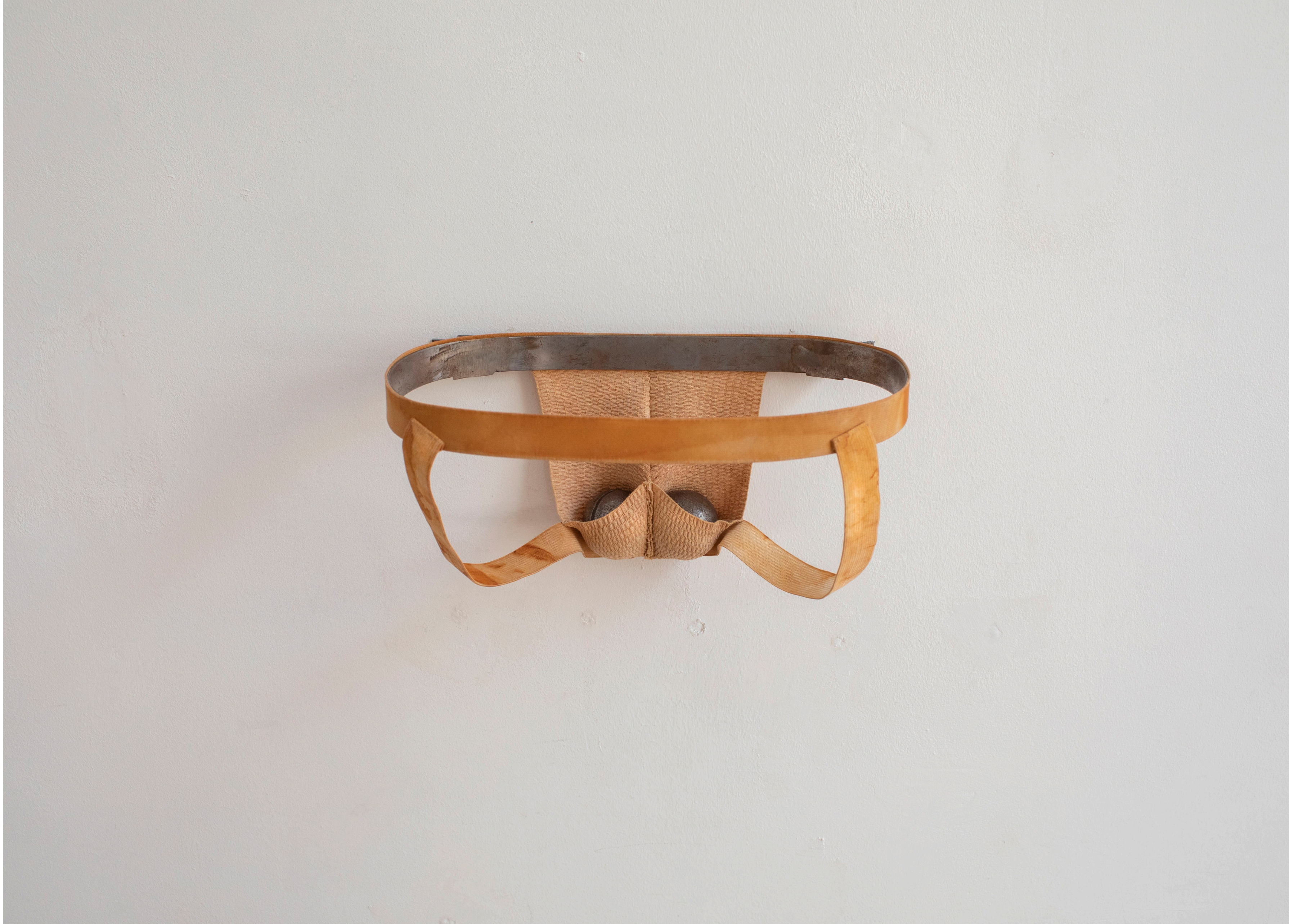
18. Dagmar Bosma, Tough and Tender , jockstrap made from rust-dyed elastic textile and bandage, baoding balls, metal holder, 2024.