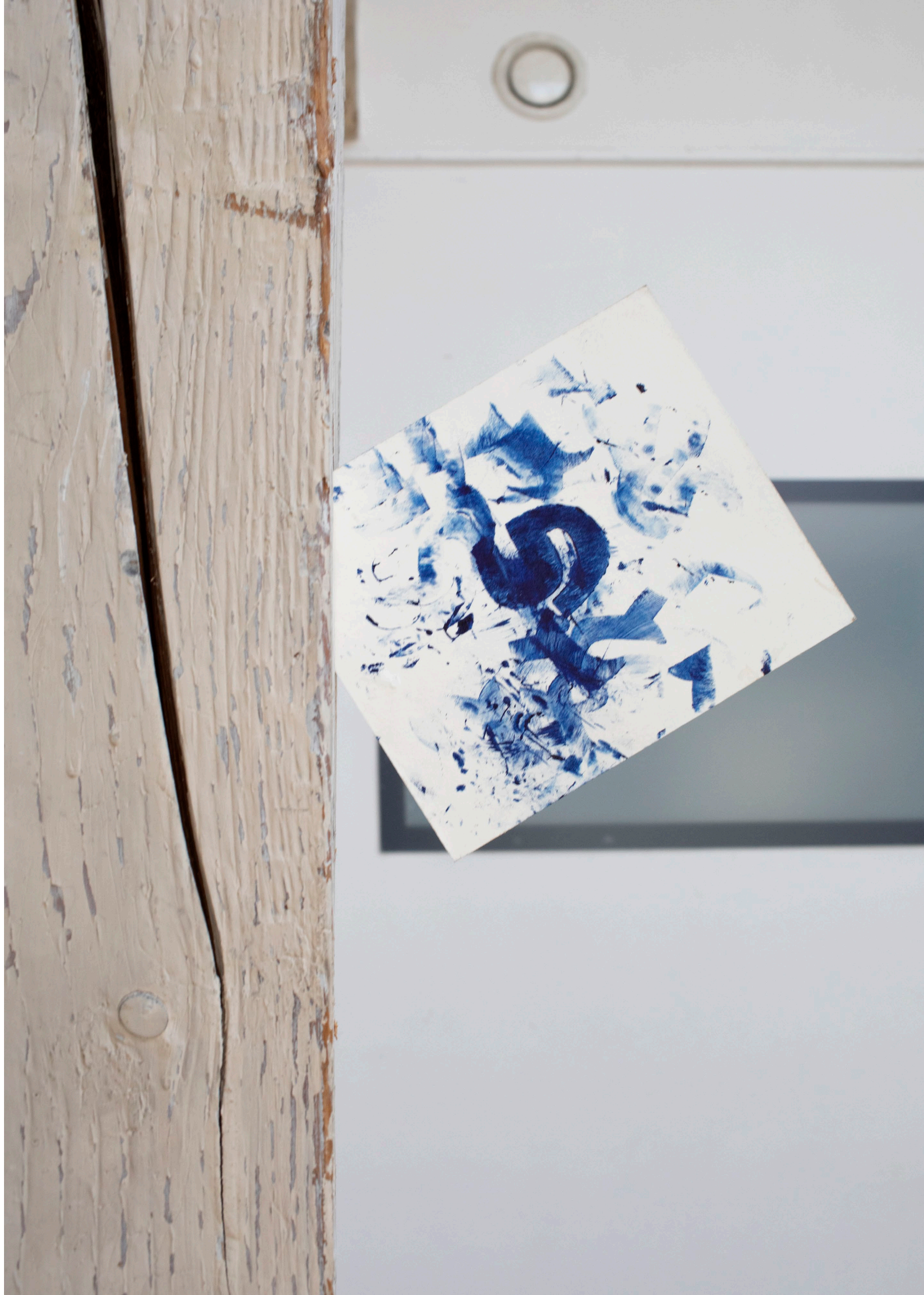
21. Natalia Papaeva, On the tip of my tongue , size variable, paper, paint, 2024.