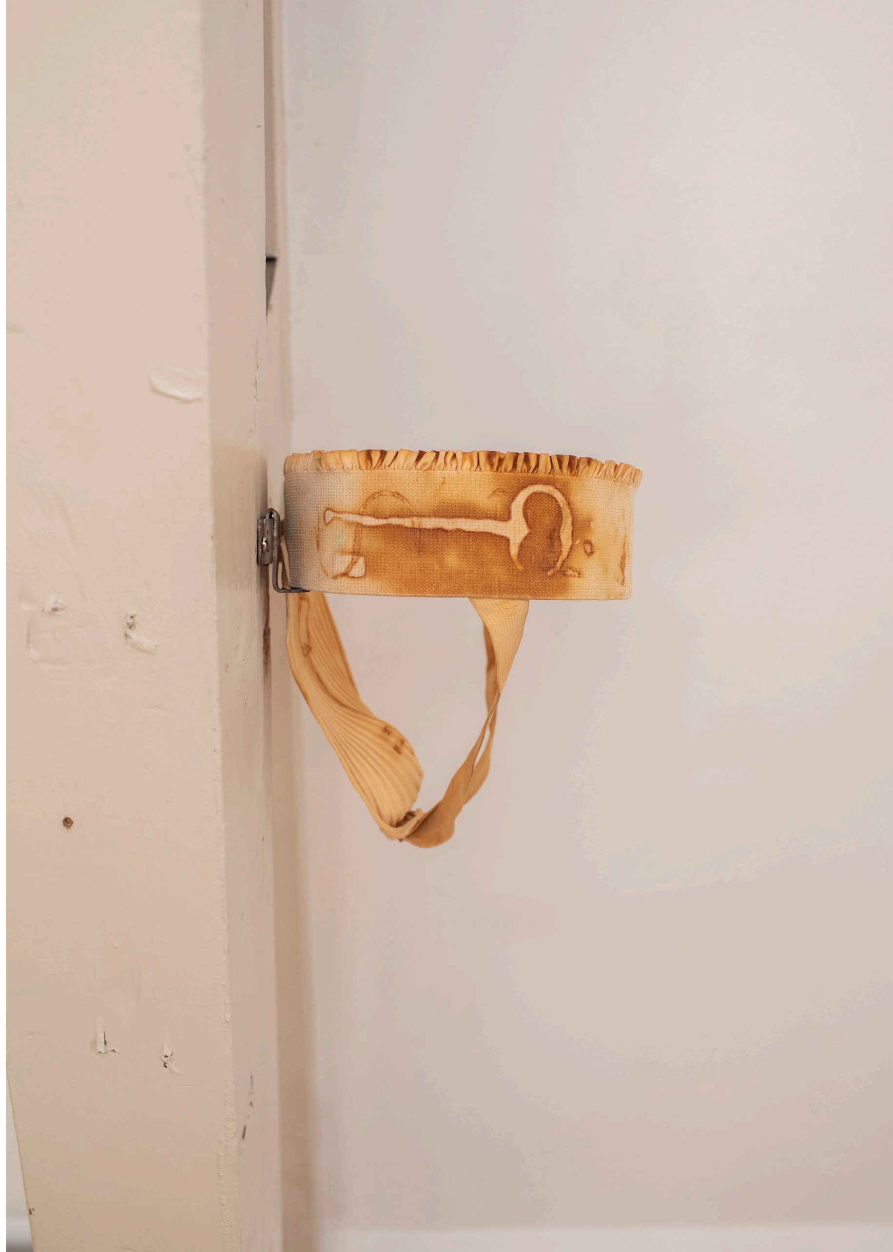
13. Dagmar Bosma, Tough and Tender , detail, jockstrap made from rust- and copper dyed elastic textile, metal holder, 2024.