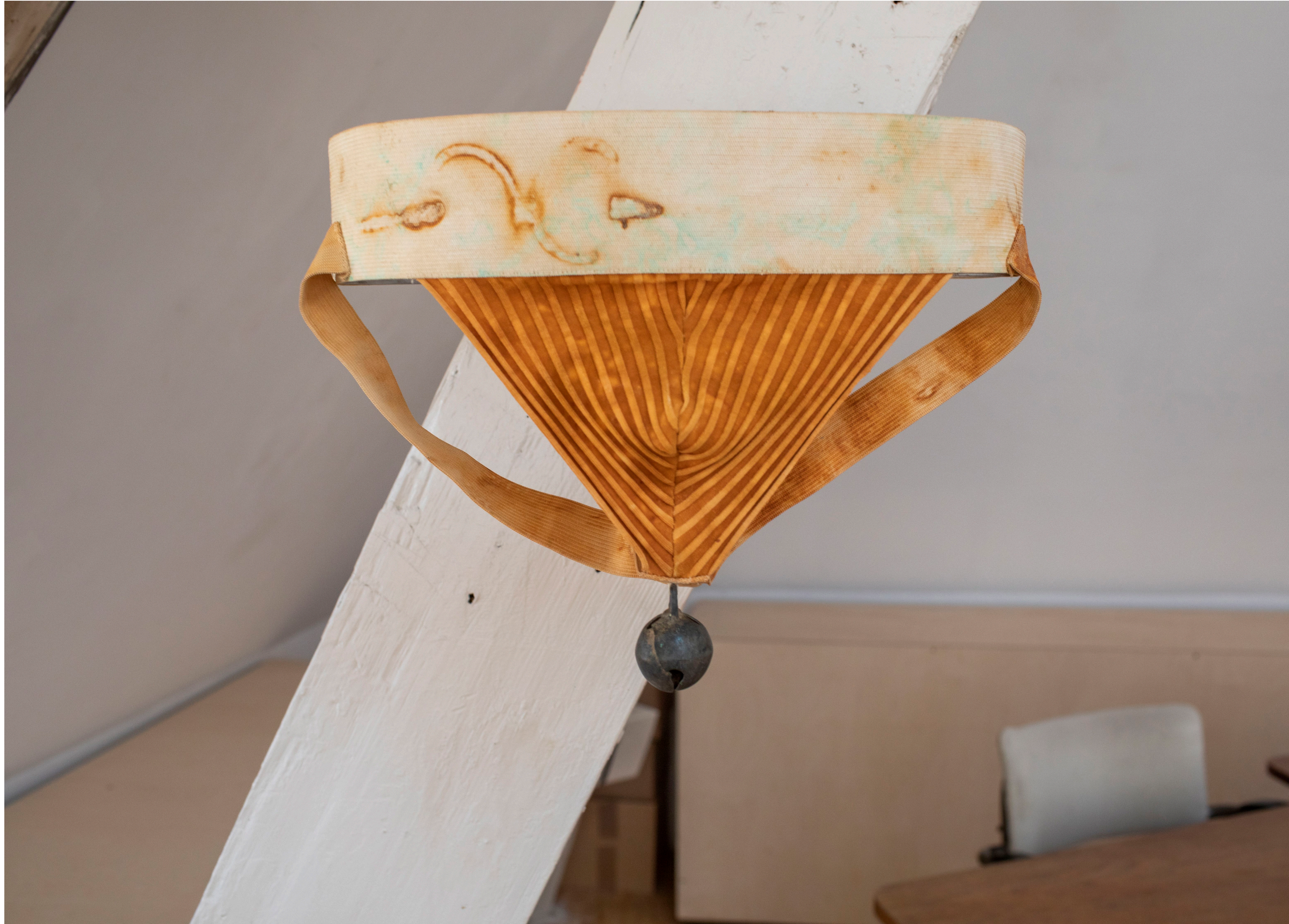
11. Dagmar Bosma, Tough and Tender , jockstrap made from rust- and copper dyed elastic textile, antique cow bell, metal holder, 2024.