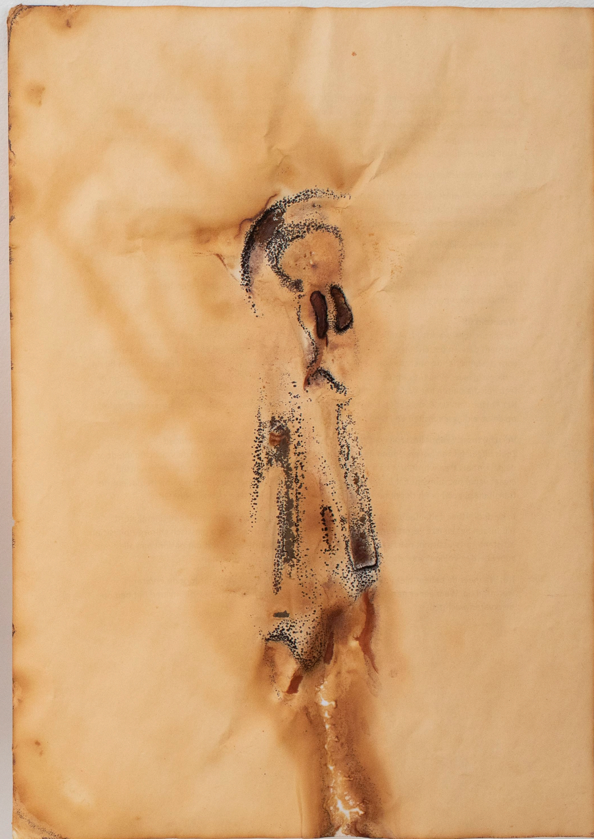
16. Dagmar Bosma, Tough and Tender , rust-dyed documents with indicated waiting times for the Amsterdam UMC gender clinic, kinesiotope used for chest binding, 2024.