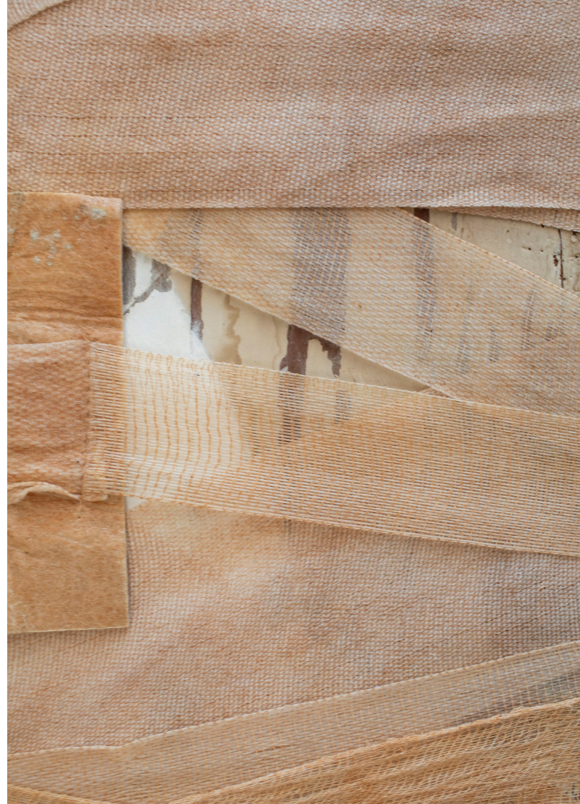
06. Dagmar Bosma, Bandaged Beam , detail, site-specific installation with rust-dyed bandages and gauze, 2024.