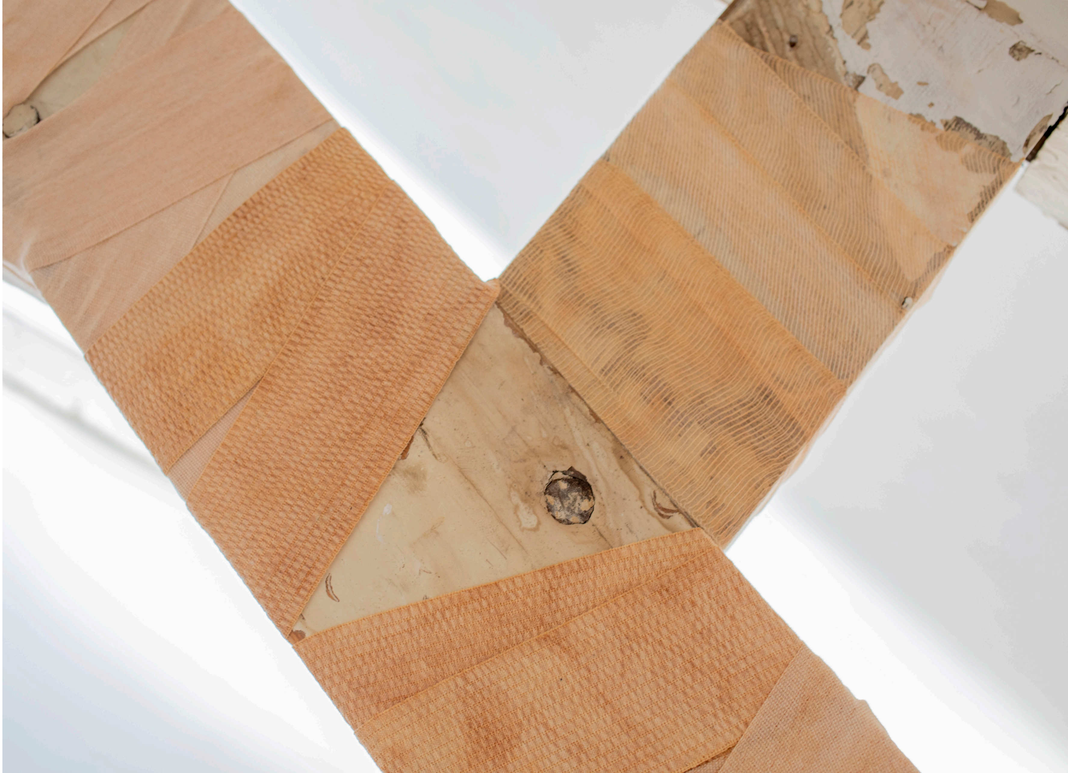
08. Dagmar Bosma, Bandaged Beam , detail, site-specific installation with rust-dyed bandages and gauze, 2024.