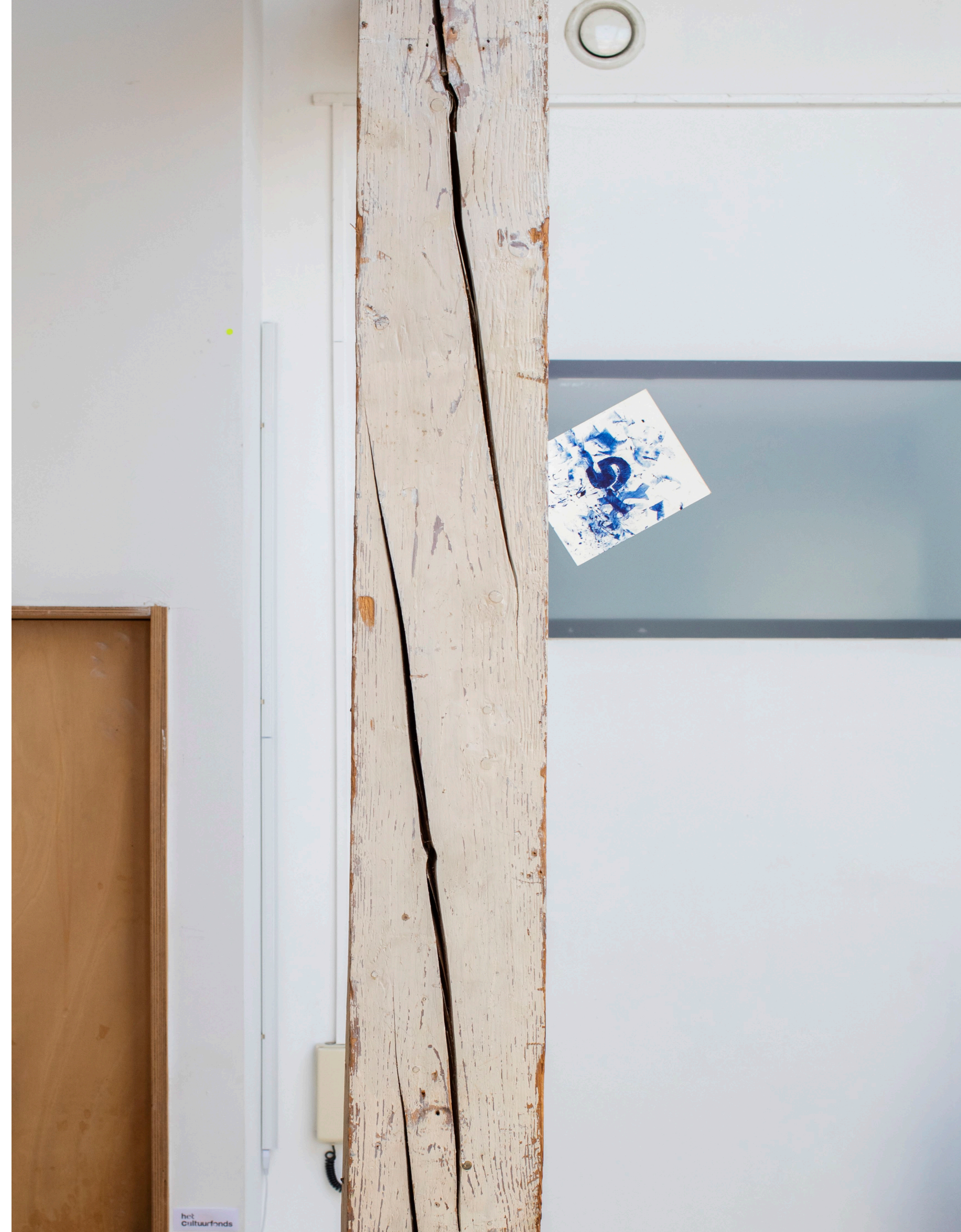
20. Natalia Papaeva, On the tip of my tongue , size variable, paper, paint, 2024.