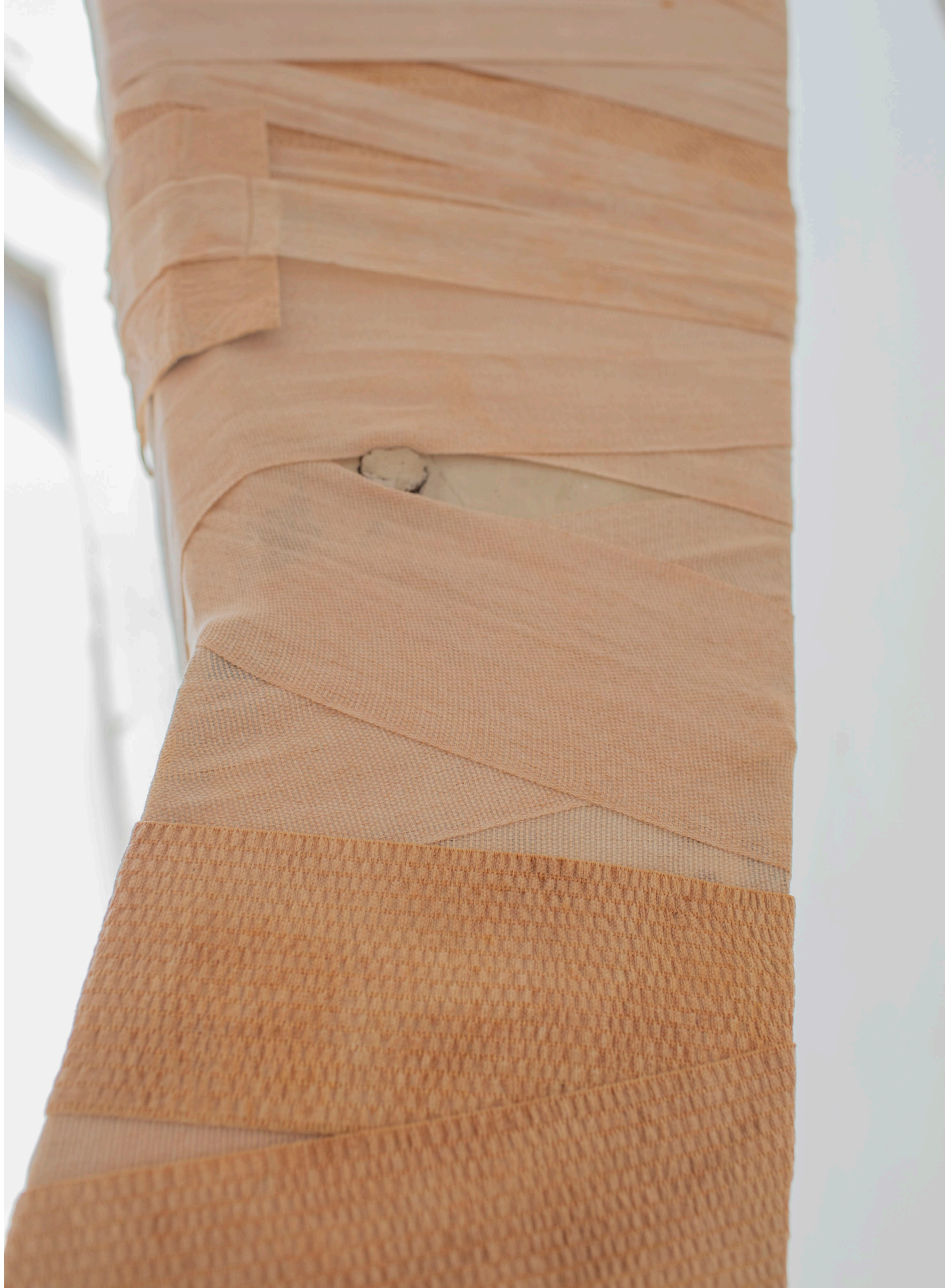
07. Dagmar Bosma, Bandaged Beam , detail, site-specific installation with rust-dyed bandages and gauze, 2024.