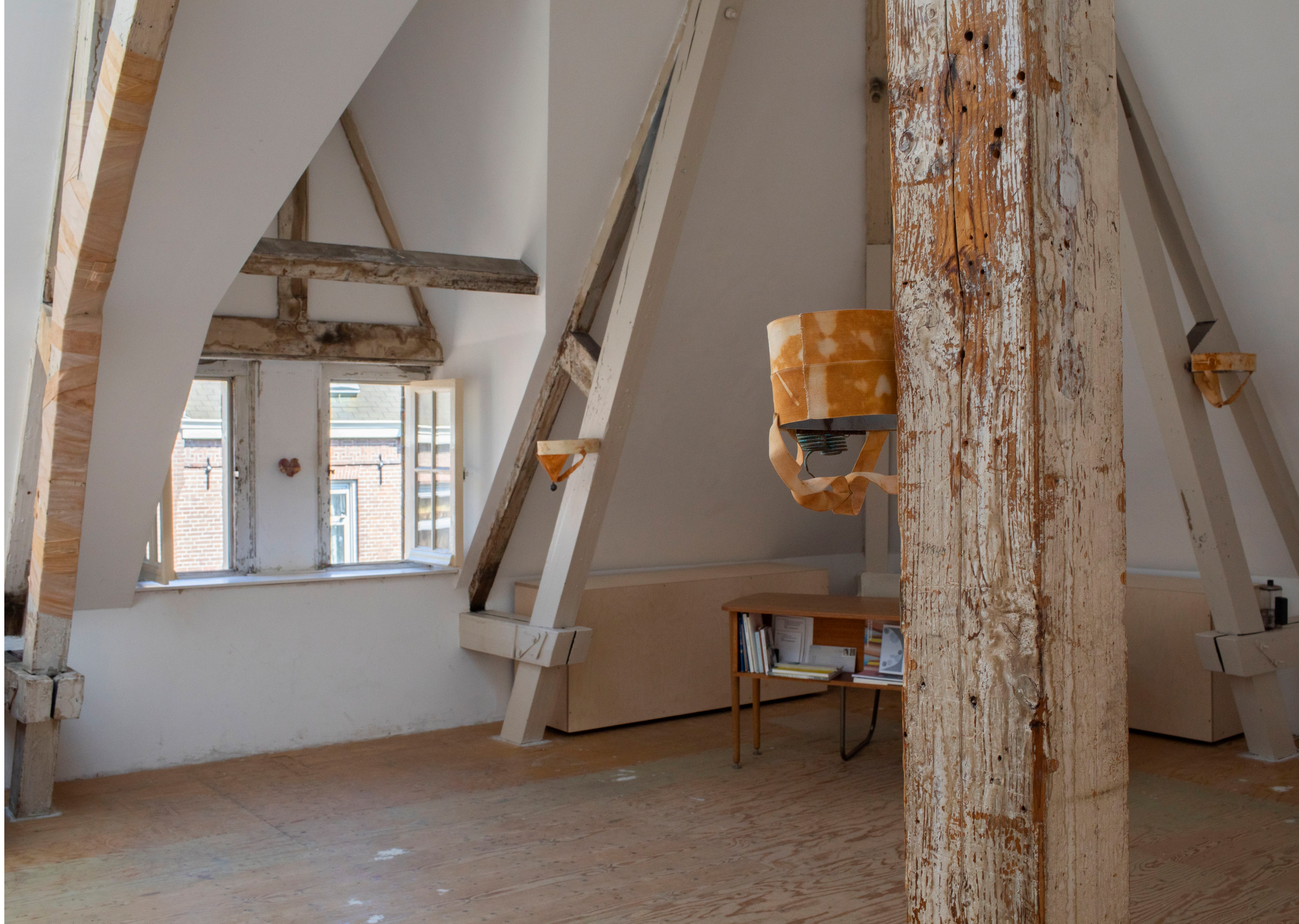
05. Dagmar Bosma, Tough and Tender , exhibition view, 2024.