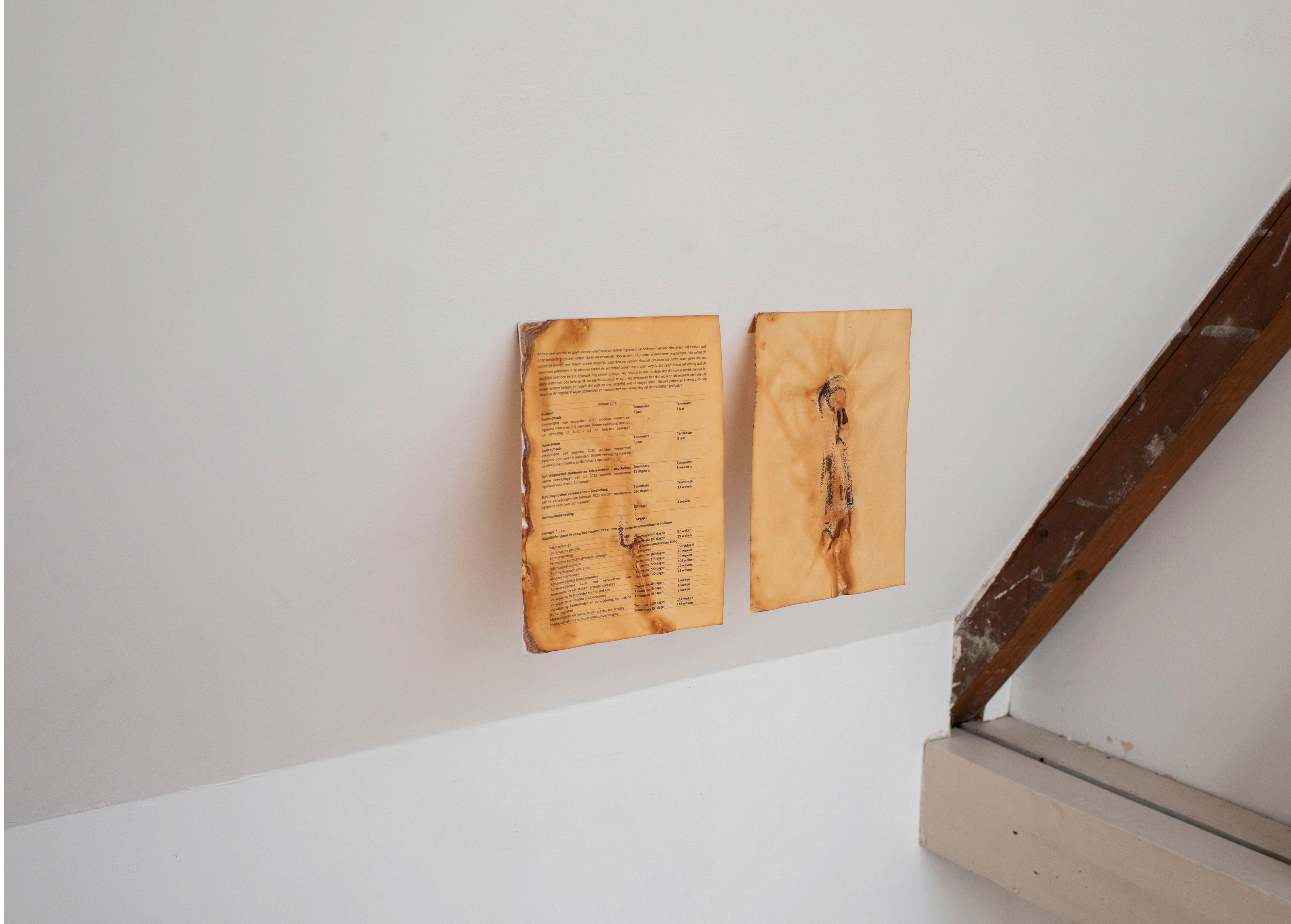
15. Dagmar Bosma, Tough and Tender , rust-dyed documents with indicated waiting times for the Amsterdam UMC gender clinic, kinesiotope used for chest binding, 2024.