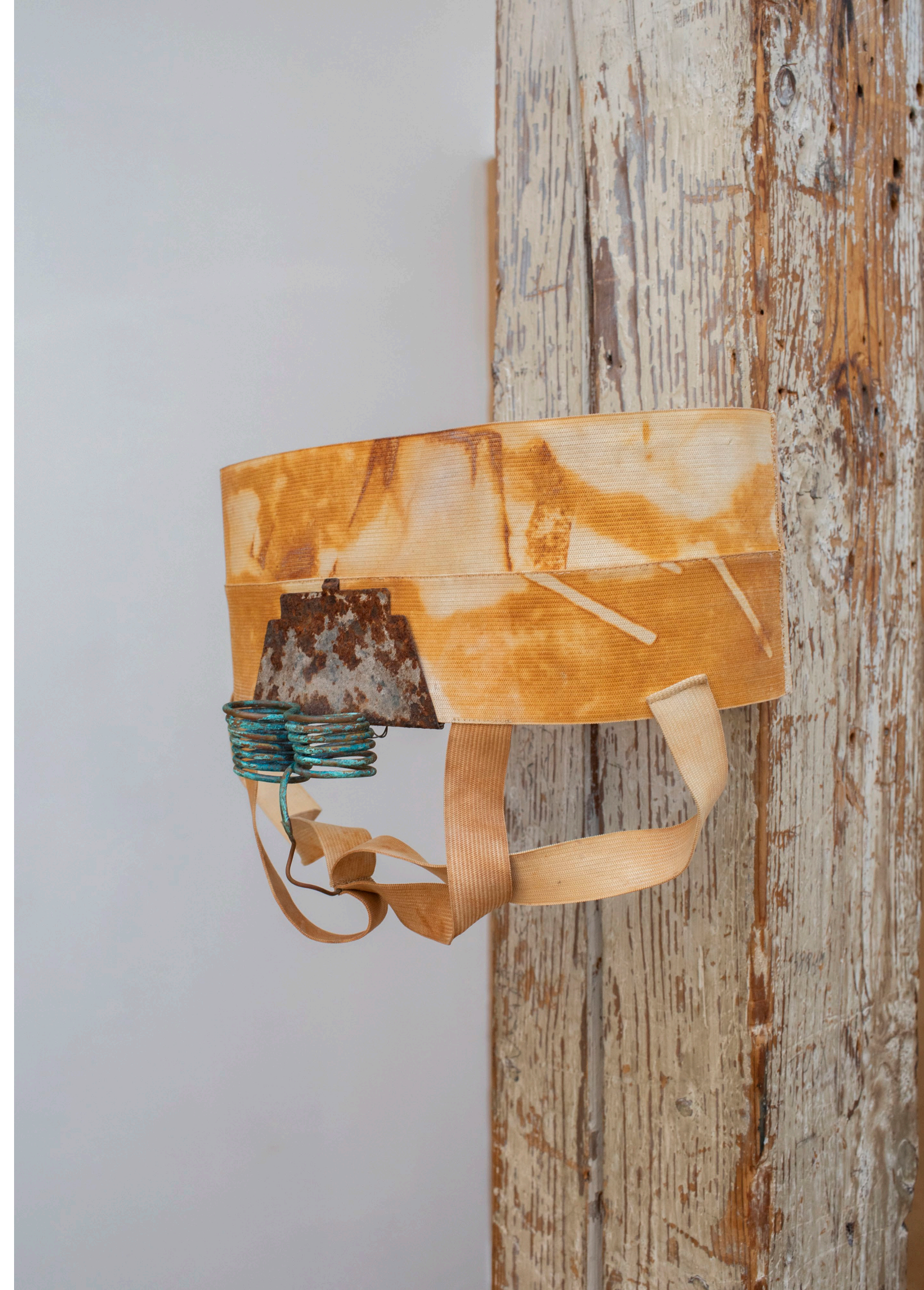
22. Dagmar Bosma, Tough and Tender (for Elsa) , jockstrap made from rust- and copper dyed elastic textile, rusted plate, copper spiral, metal holder, 2024.