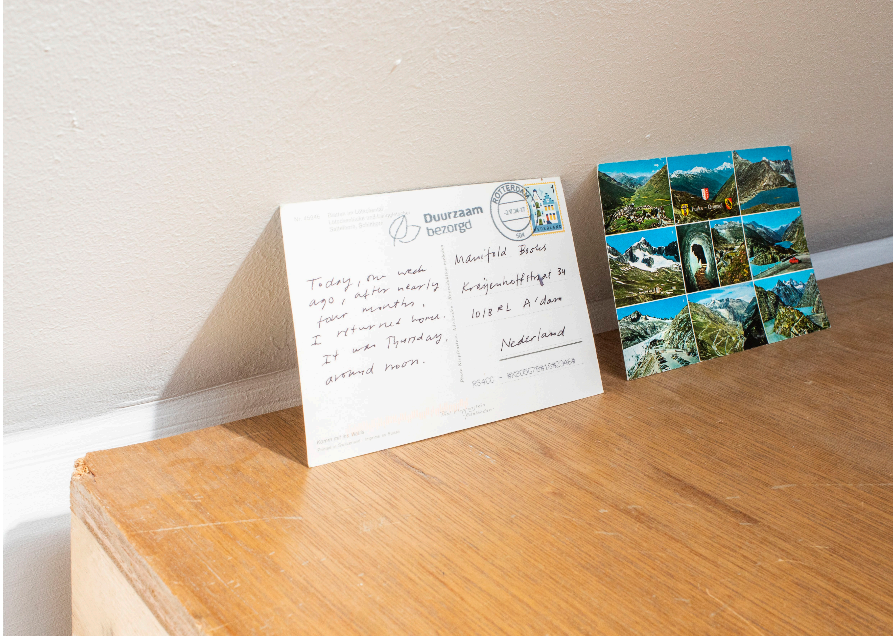
04. Moosje M. Goosen, a growing text-in-progress, handwritten postcards, postage, 2024.