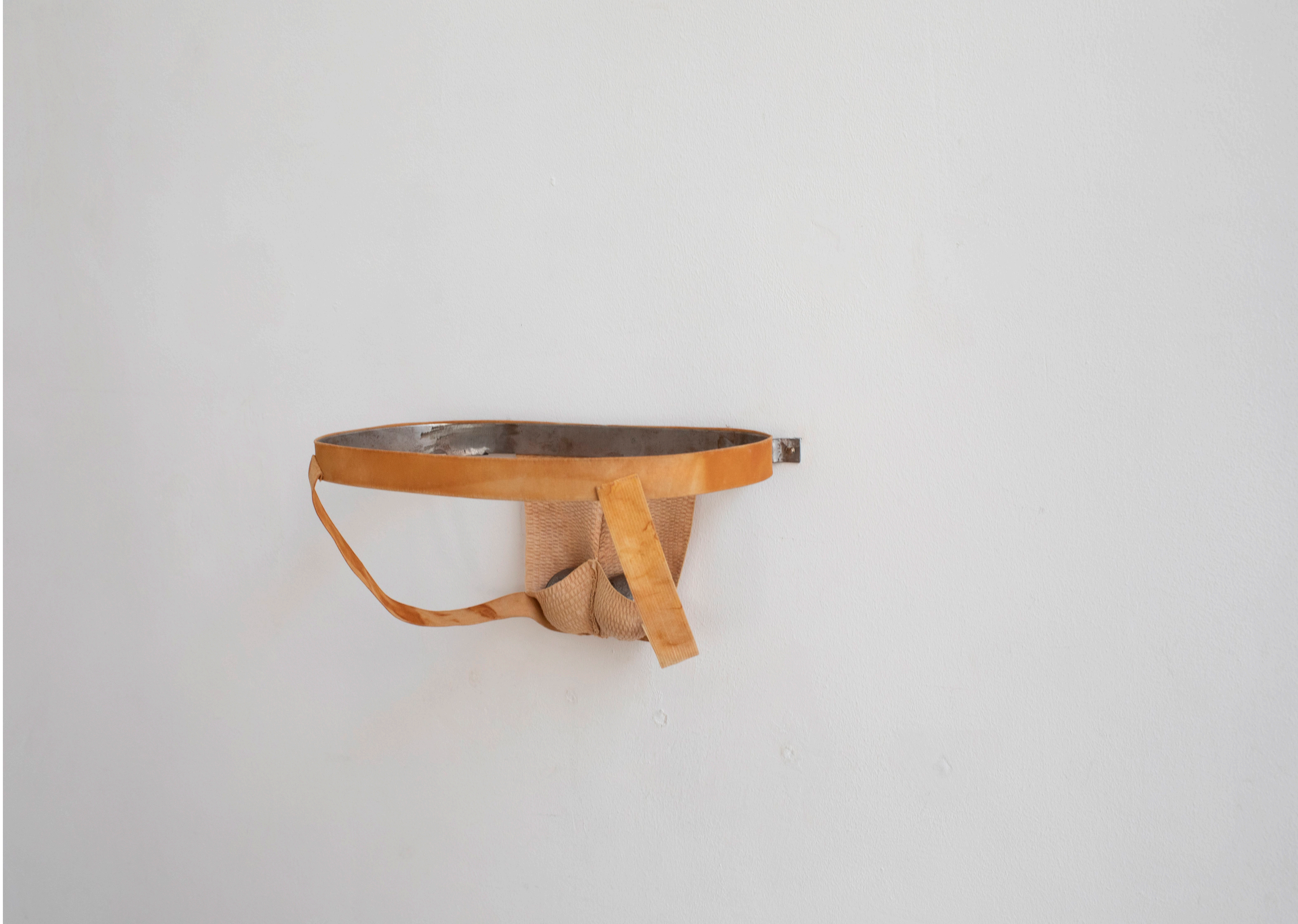
17. Dagmar Bosma, Tough and Tender , jockstrap made from rust-dyed elastic textile and bandage, baoding balls, metal holder, 2024.