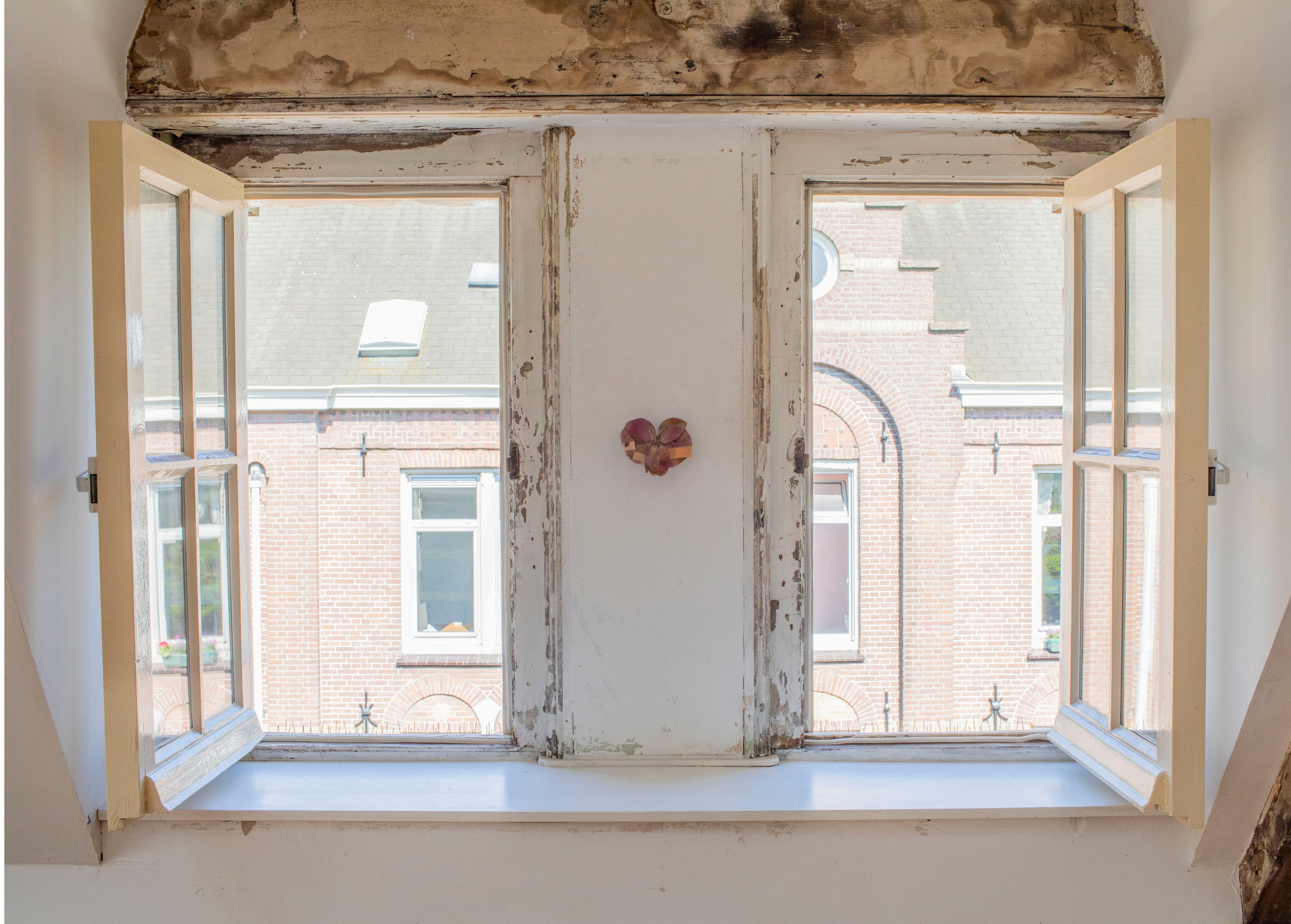
09. Dagmar Bosma, Tough and Tender (for Valter) , gleaned plastic flower, testosterone injection bandaids, blood, 2024.