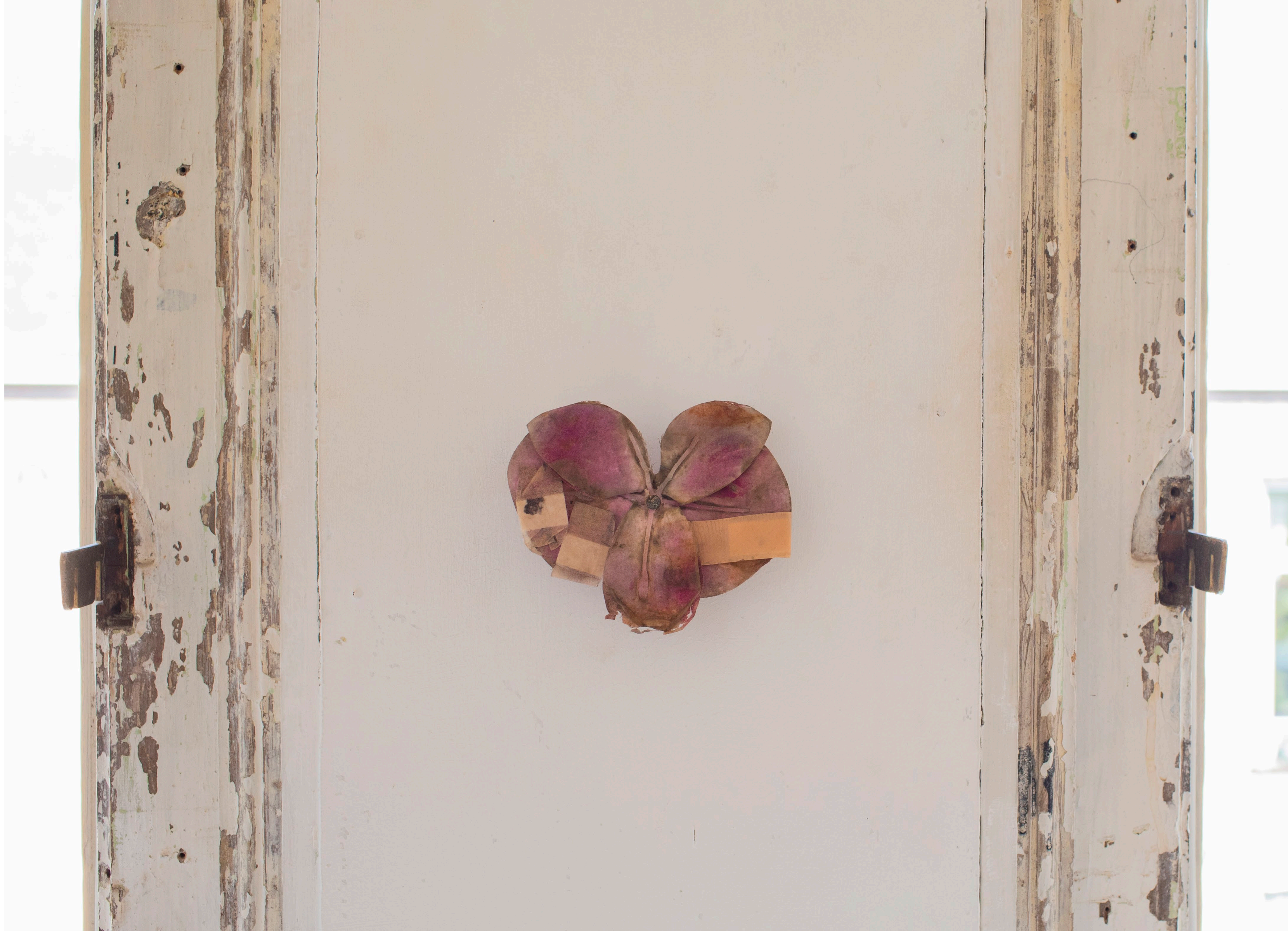
10. Dagmar Bosma, Tough and Tender (for Valter) , gleaned plastic flower, testos-terone injection bandaids, blood, 2024.