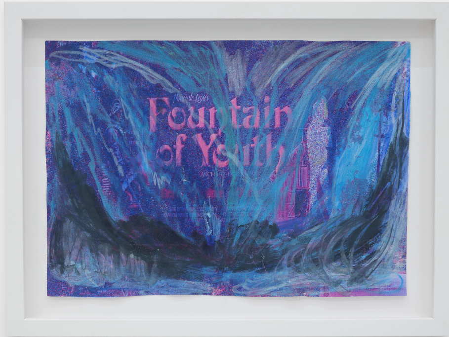
Sequoia Scavullo Fake Fountain IV , 2022 Photoshop, oil pastels, colored pencils, oil paints and markers 7 7/8 x 11 in. (unframed) 20 x 28 cm (unframed) SS0003