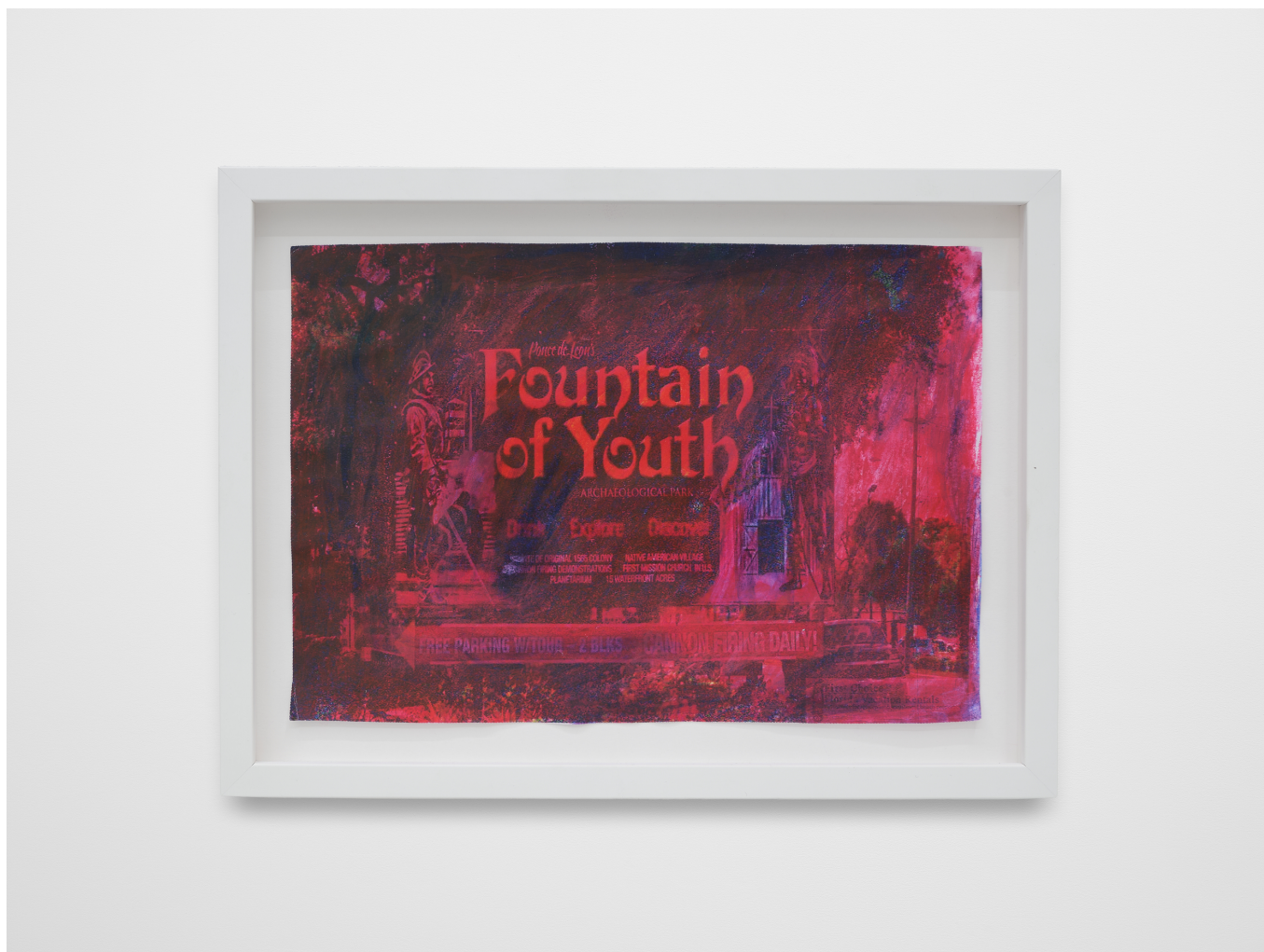
Sequoia Scavullo Fake Fountain III , 2022 Photoshop, oil pastels, colored pencils, oil paints and markers 7 7/8 x 11 in. (unframed) 20 x 28 cm (unframed) SS0004