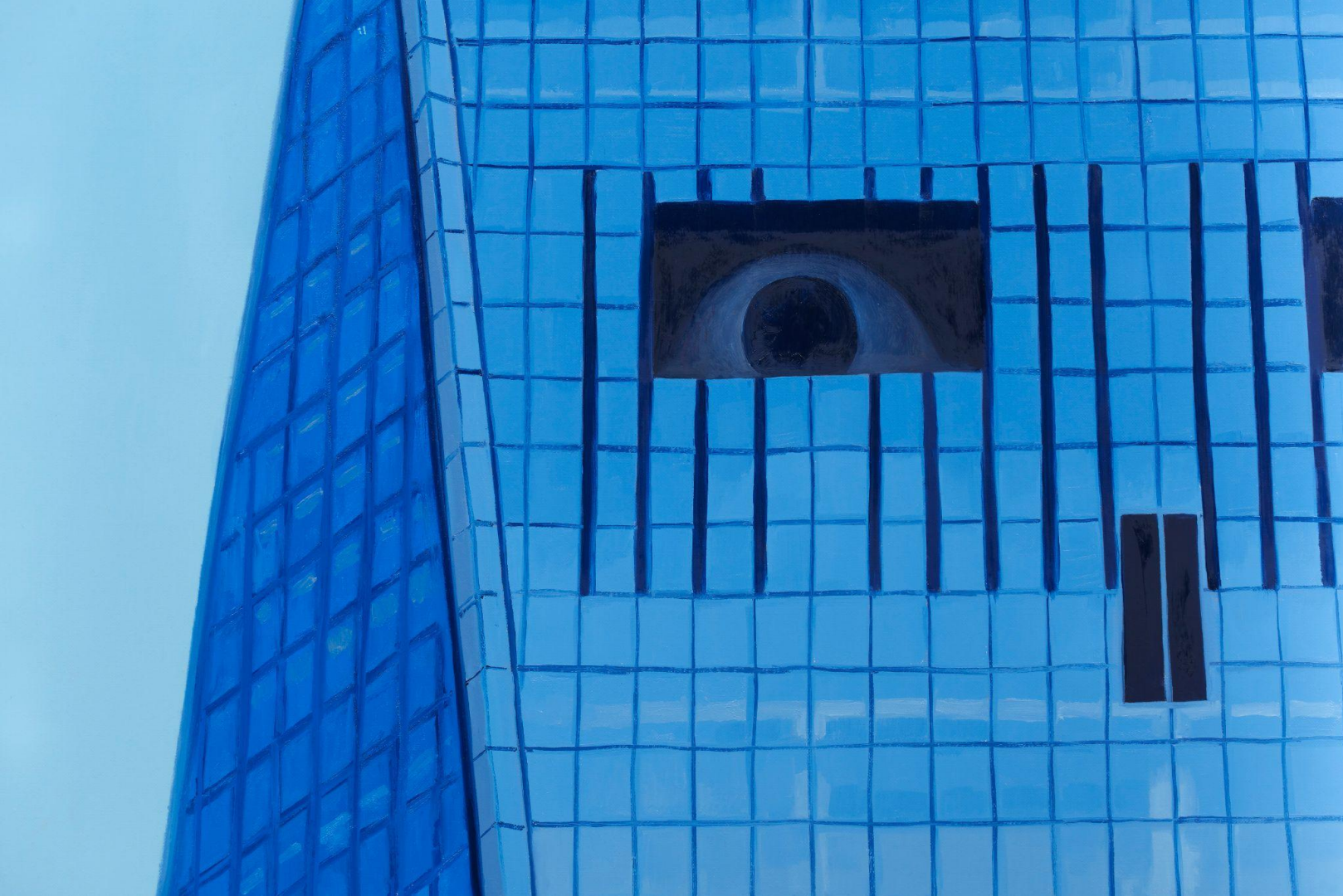
Detail of New Landmarks