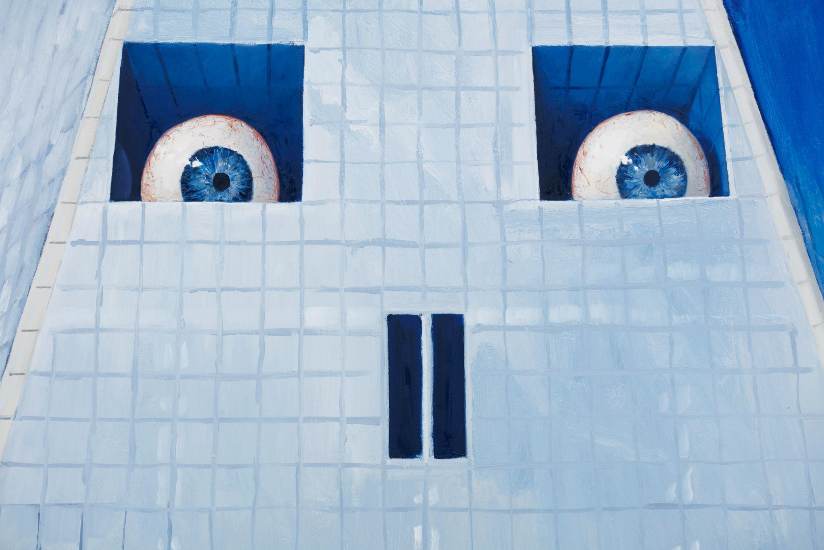
Detail of One World Trade