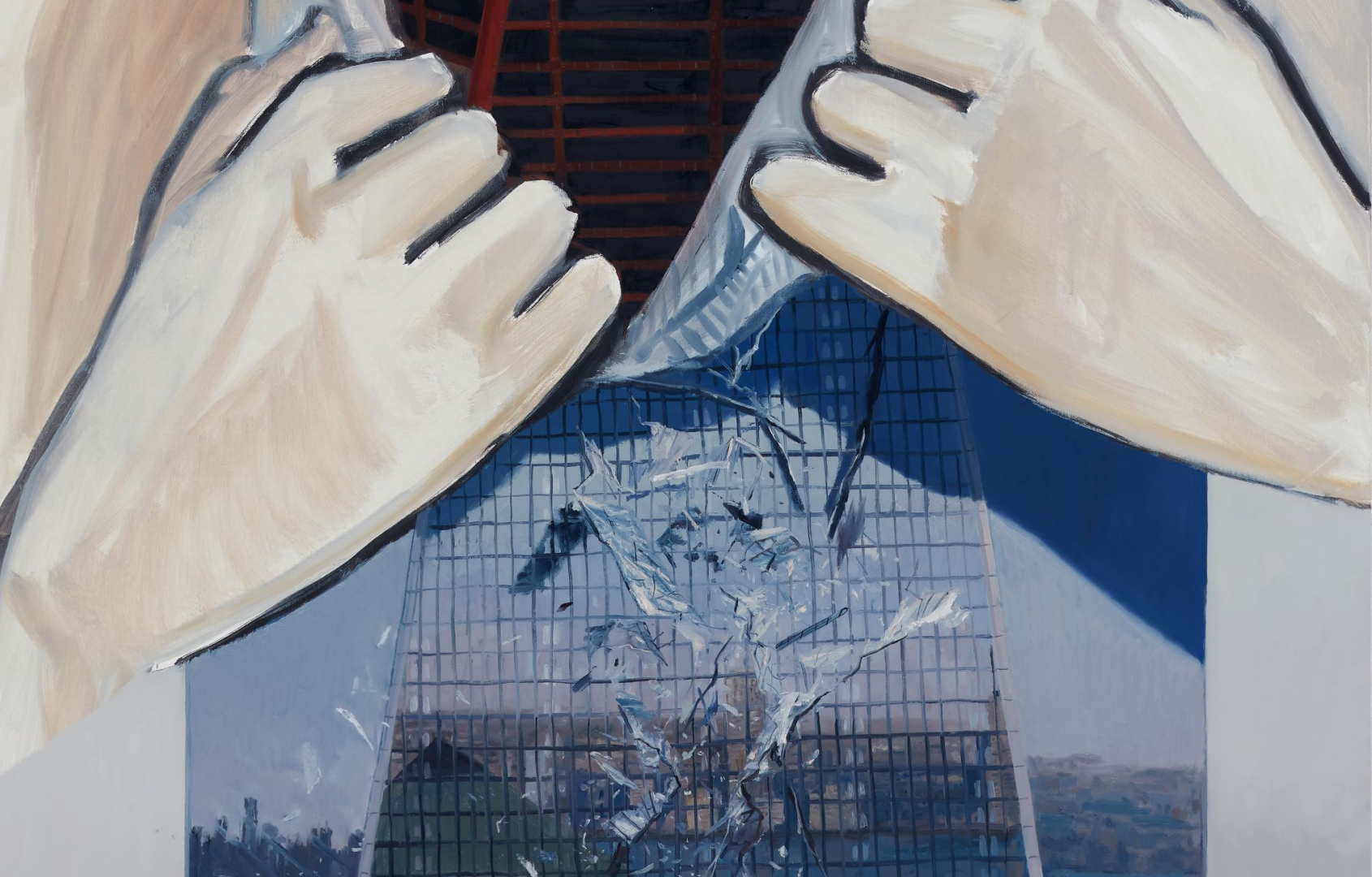
Detail of Portrait