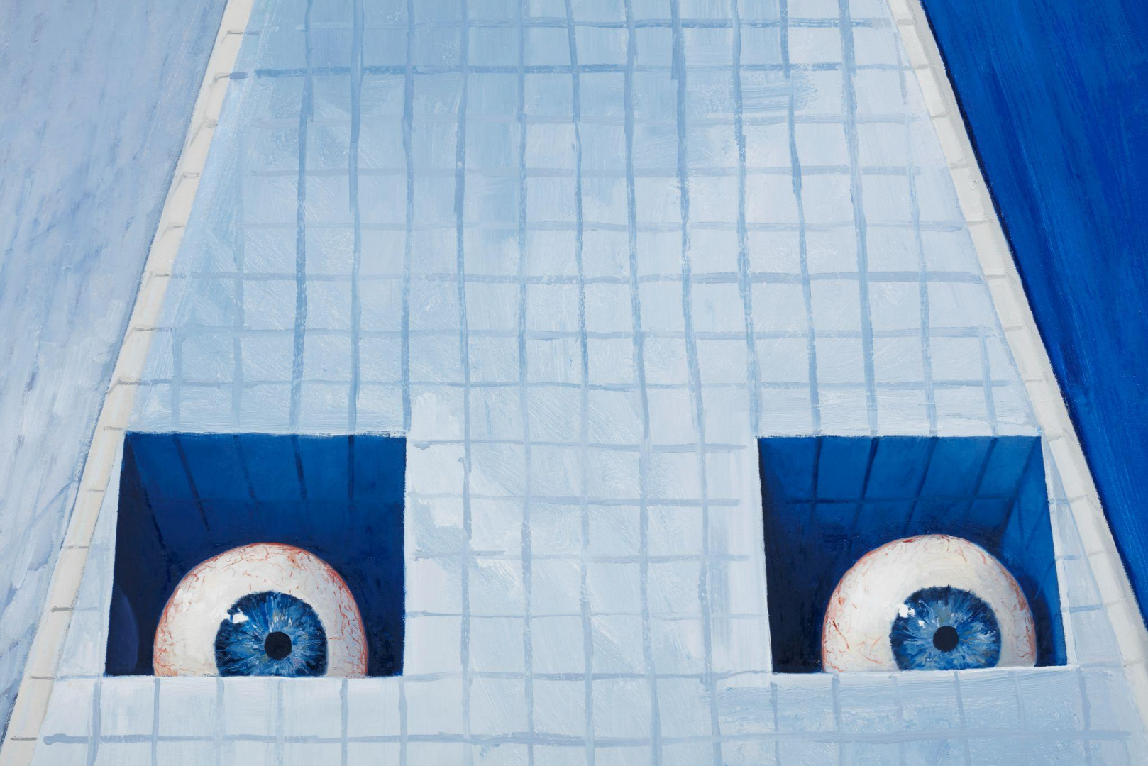
Detail of One World Trade