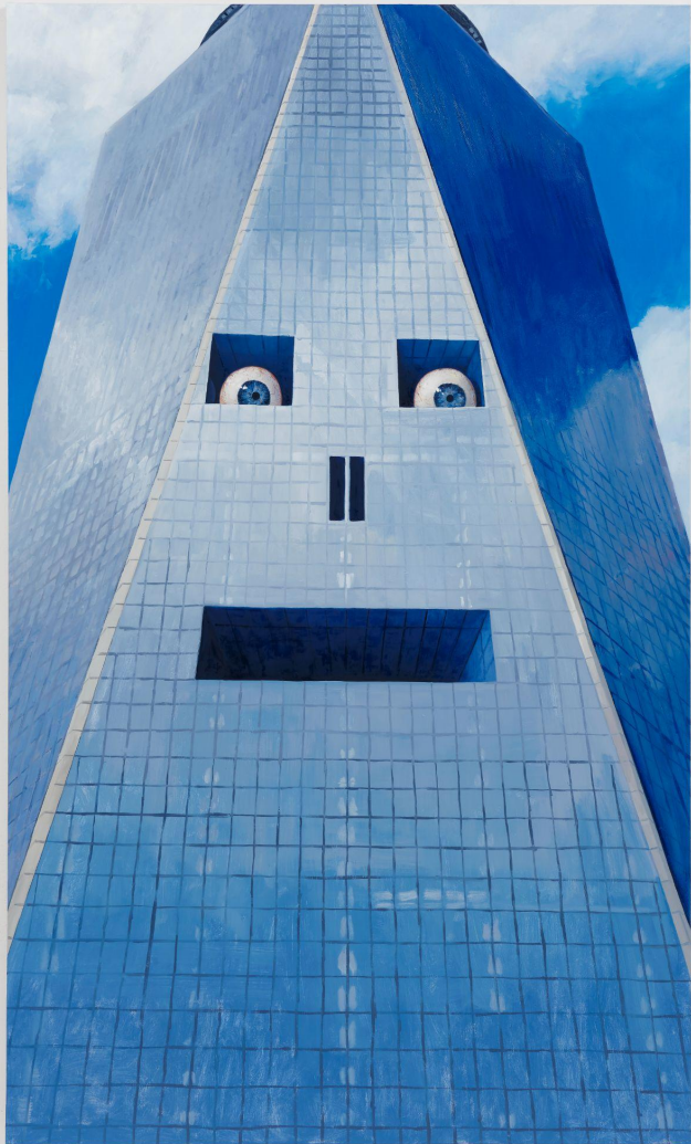
Matt Kenny One World Trade , 2024 Oil on canvas 75 x 45 in (190.5 x 114.3 cm)