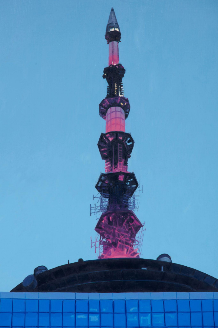
Detail of New Landmarks