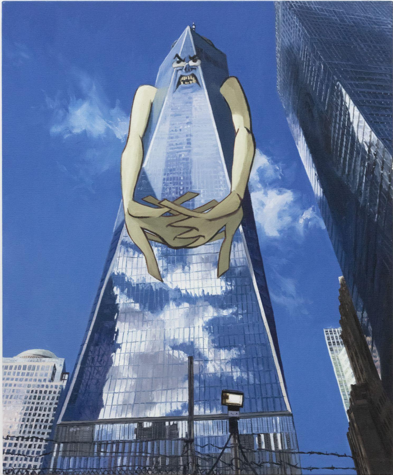
Matt Kenny Knuckles , 2022 Oil on canvas 29 x 24 inches (73.7 x 61 cm)