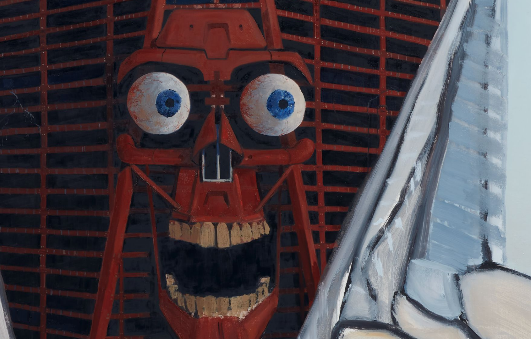
Detail of Portrait