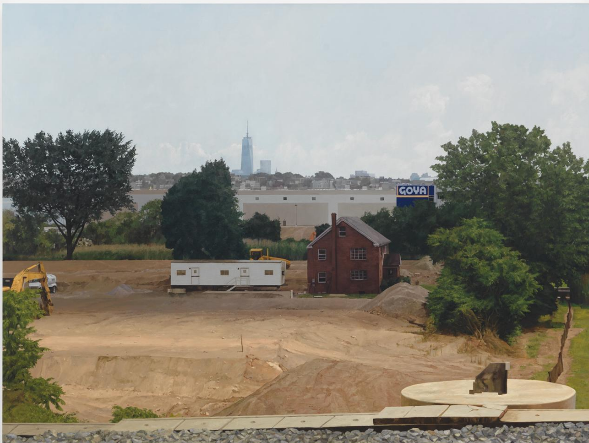
Matt Kenny The House on Penhorn Creek, 2024 Oil on canvas 54 x 72 in (137.2 x 182.9 cm)