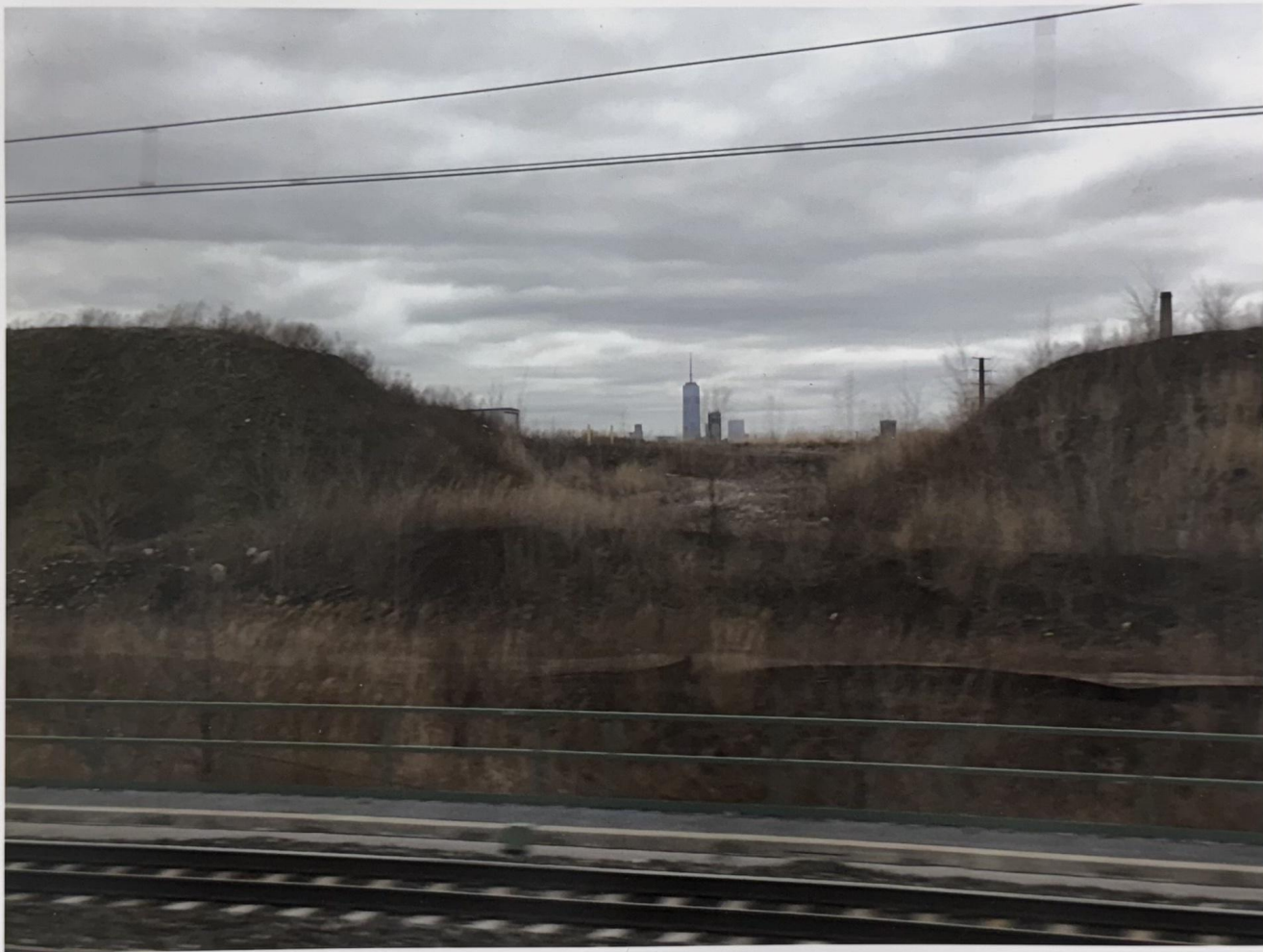
Matt Kenny Northeast Corridor , 2024 Oil on canvas 21 x 25 in (53.3 x 63.5 cm)