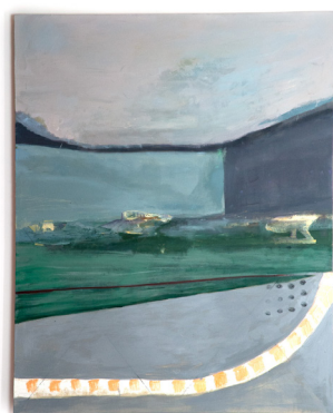
Untitled Landscape 1, 2023

Oil, acrylic, pastel, pigment on plaster 22 x 17 3/4 in