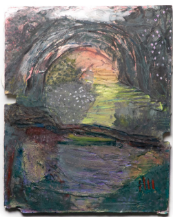
Untitled Landscape 2, 2024

Oil, acrylic, pastel, pigment on plaster 22 x 17 3/4 in