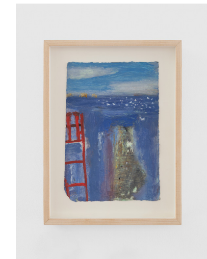
By the lake, flipped, 2024