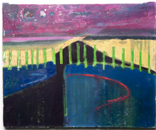
Untitled Landscape, 2023

Oil, burlap, ceramics on plaster 13 x 12.5 in