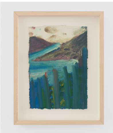
Mendocino by the gate, 2023