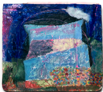
I Had a Dream About It, 2024

Oil and acrylic on plaster 16 1/2 × 19 1/2 in