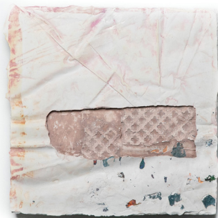
Wall 1, 2022

Oil, oil skins, clay, plaster 12 x 12 in