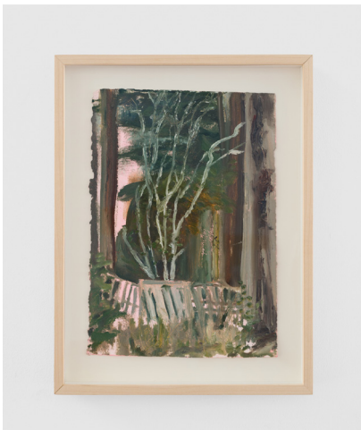
Redwood Stump at Salmon Creek, 2023