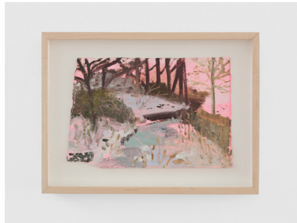
Vale of Cashmere, Snow, 2024