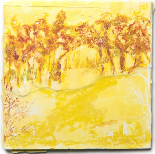
Never Want To Leave The Field, 2022