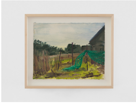
By the Blue Barn, 2023