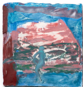
The View, 2023

Oil and acrylic on plaster 16 1/2 × 19 1/2 in