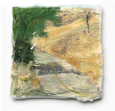
Near Crocket, 2023