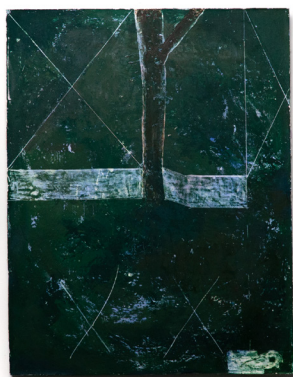
Persephone Underground, 2022

Oil, oil skins, clay, plaster 12 x 12 in