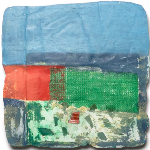
Pile Up, 2022

Oil, burlap, ceramics on plaster 13 x 12.5 in