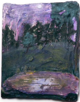
Untitled Landscape 3, 2024