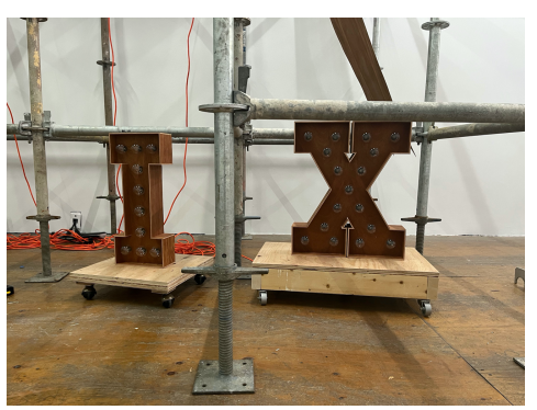
Title IX, 2022, mahogany veneer, plywood, lightbulbs, clamps, electrical cords, dollies