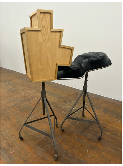
Studiolo Gubbio model, 2022, ash and cherry veneer, poplar, plywood, two-up seat, steel modeling stands