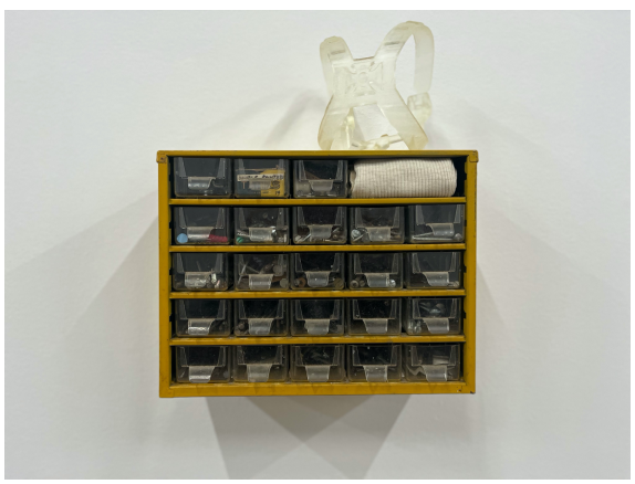
Fasteners, 2022, 3D resin print, undershirt, hardware storage cabinet