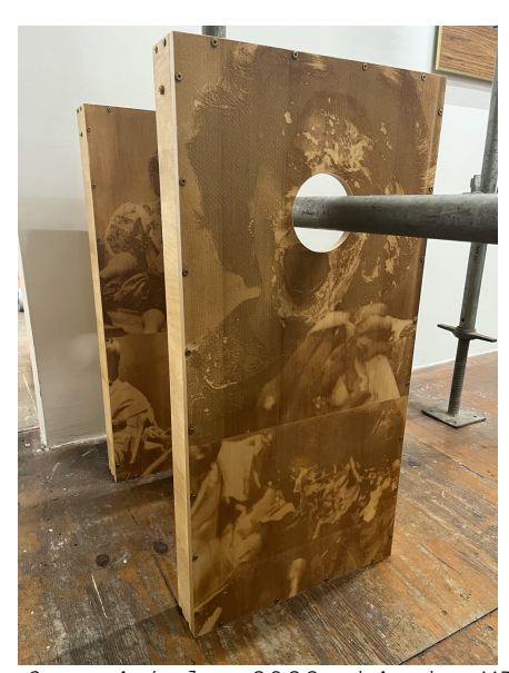
Cornpiehole, 2022, birch, MDF, hardware, oranges