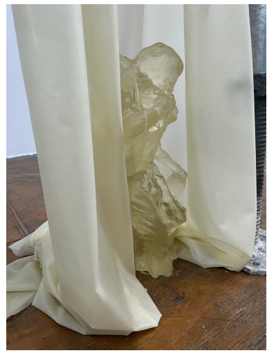
Imitation with original, 2022, 3D print, silicone caulking, latex, clamps