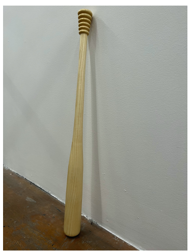
Ribbed bat, 2022, turned ash