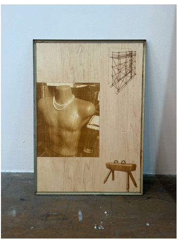
Pearl necklace diagram, 2022, maple, birch and hickory veneer, TV tray frame, plywood