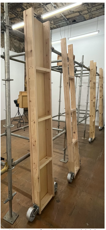
Library ladders, 2022, 2x4s, pine molding, steel casters, MDF, mahogany, cherry, maple, and birch veneer, hardware