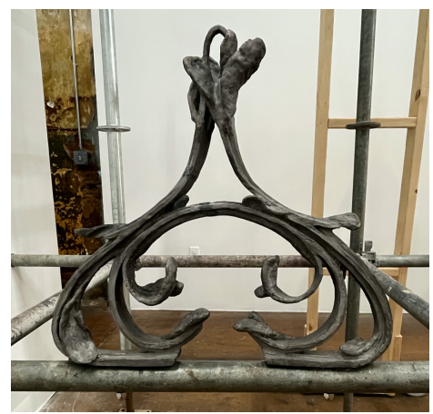
Cast iron brackets, 2022