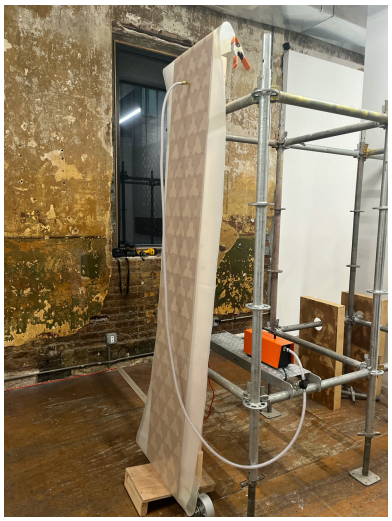
Pressure device, 2022, vacuum bag, vacuum pump, electrical cord, cherry, mahogany, veneer tape, MDF, plywood, netting, hardware