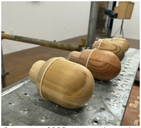
Inverts , 2022, turned wood, internal condoms