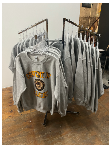
Prefigurative merch, 2022, Convent of Pleasure sweatshirts (edition of 50), garment rack, hangers, size markers