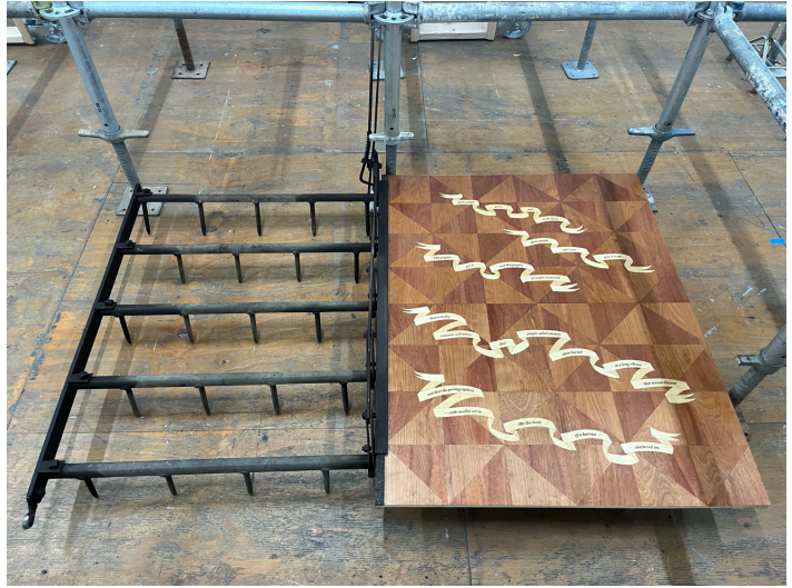
Sondheim/Dworkin duet, 2022, steel, mahogany, cherry, ash, and birch veneer, plywood