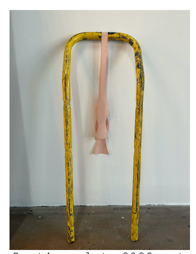
Bowtie valet, 2022, steel, latex