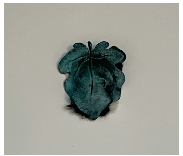
Custom Spell by Jonah Welch, 2022 Bronze Fig Leaf, 2017