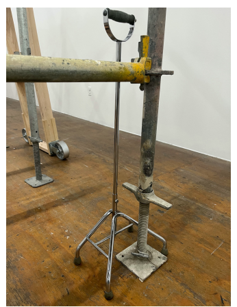
Untitled , 2022, adaptive device