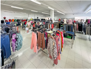
Loose Canon, 2024. Installation view