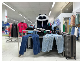
I have a million dollar figure... but it's all loose change, Jasmine Gregory, 2024.