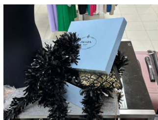
I have a million dollar figure... but it's all loose change, Jasmine Gregory, 2024.