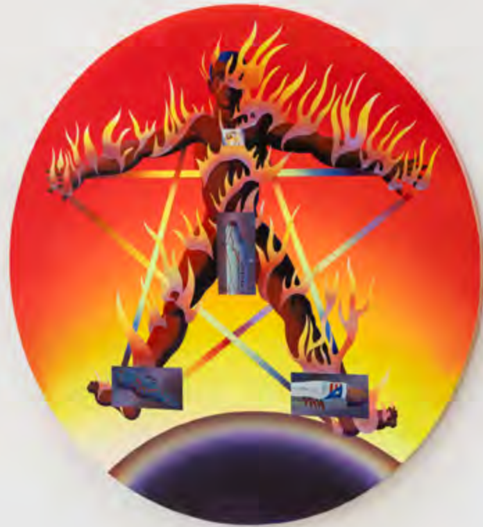
Jonny Negron, La Vision del Pan , exhibition view, 2024, Crèveœur, Paris.