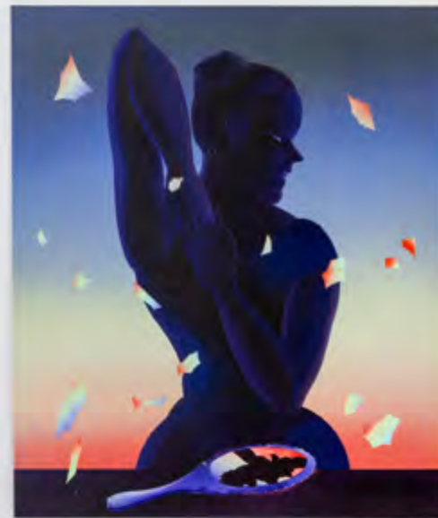
Jonny Negron, La Vision del Pan , exhibition view, 2024, Crèveœur, Paris.