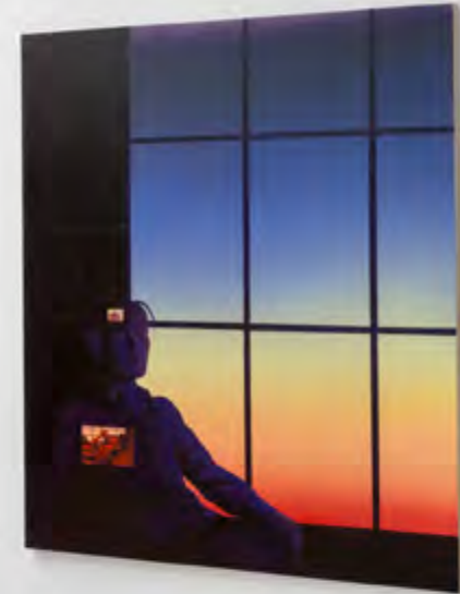
Jonny Negron, La Vision del Pan , exhibition view, 2024, Crèveœur, Paris.