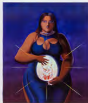
Jonny Negron, La Vision del Pan , exhibition view, 2024, Crèveœur, Paris.