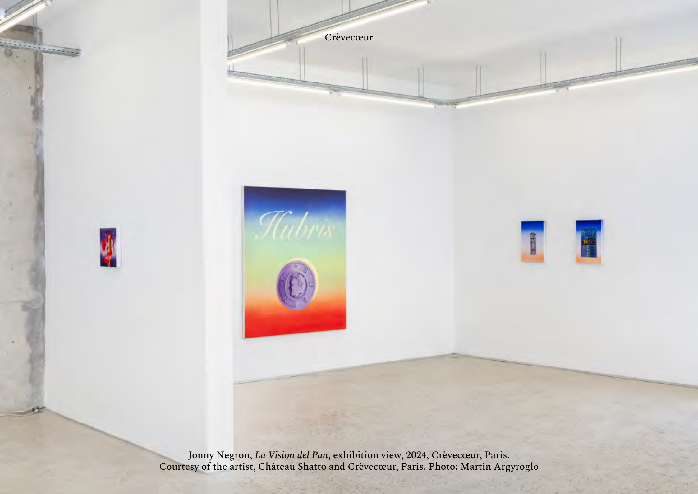
Jonny Negron, La Vision del Pan , exhibition view, 2024, Crèveœur, Paris. Courtesy of the artist, Château Shatto and Crèveœur, Paris. Photo: Martin Argyroglo