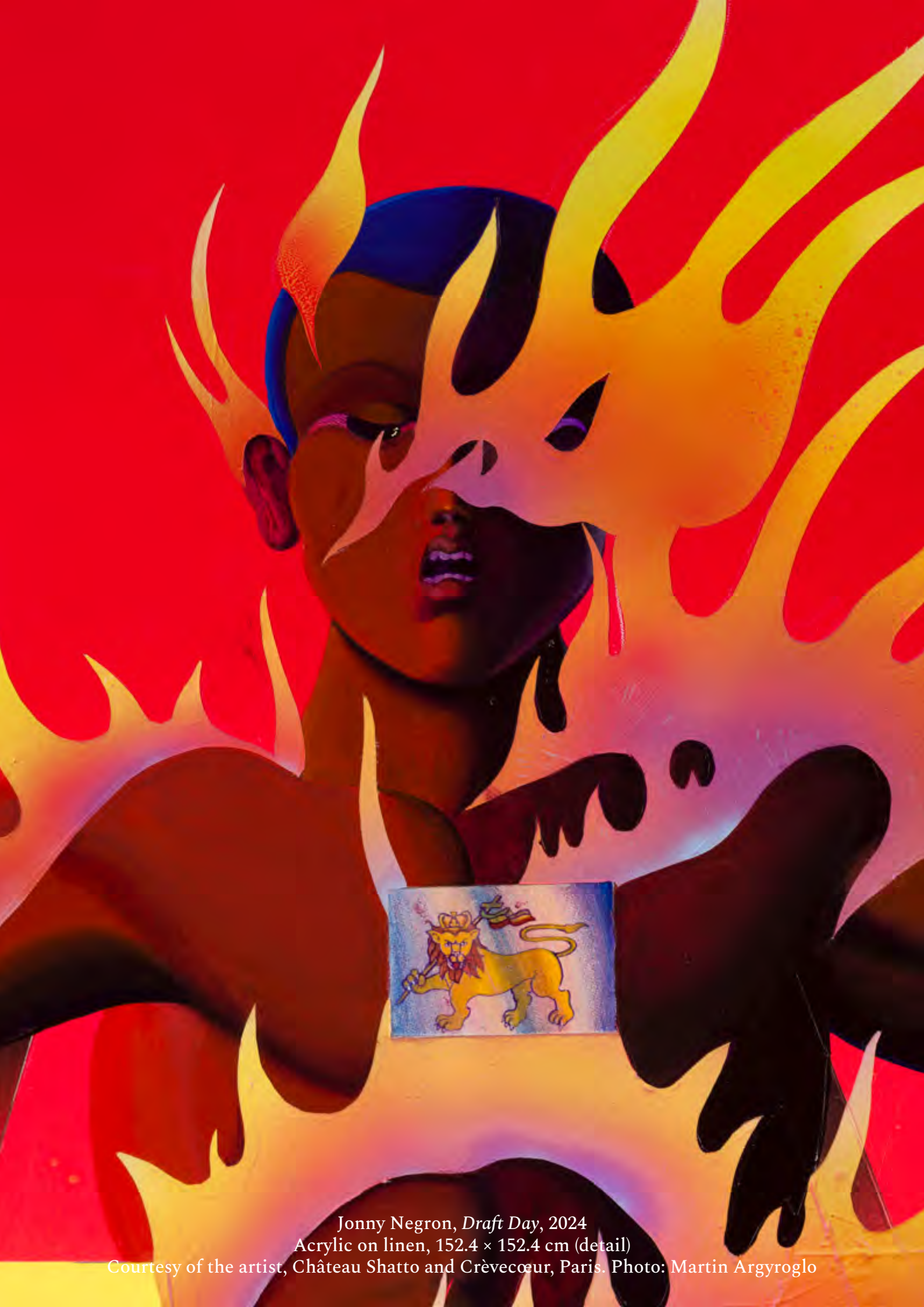
Jonny Negron, Draft Day , 2024 Acrylic on linen, 152.4 × 152.4 cm (detail) Courtesy of the artist, Château Shatto and Crèvecœur, Paris. Photo: Martin Argyroglo