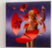
Jonny Negron, La Vision del Pan , exhibition view, 2024, Crèveœur, Paris.