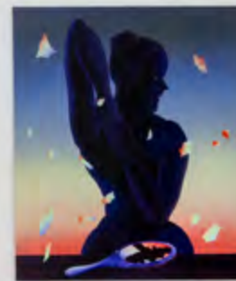
Jonny Negron, La Vision del Pan , exhibition view, 2024, Crèveœur, Paris. Courtesy of the artist, Château Shatto and Crèveœur, Paris. Photo: Martin Argyroglo