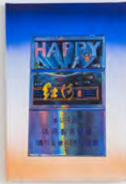
Jonny Negron, Left: Come on baby Light My Fire , 2024, Acrylic on linen, 48.3 × 33 cm Right: Happiness is Easy , 2024, Acrylic on linen, 48.3 × 33 cm