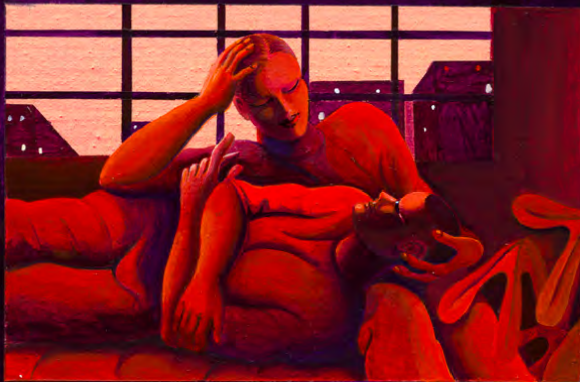
Jonny Negron, Ich Ruf Zu Dir, Herr Jesu Christ , 2024 Acrylic on linen, 162.6 × 142.2 cm (detail)