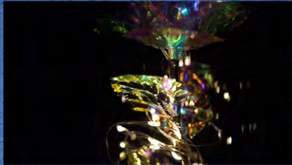
Jonny Negron, Vehiculum Streaming , 2024 Digital video, 22 min 1 sec (Video still)