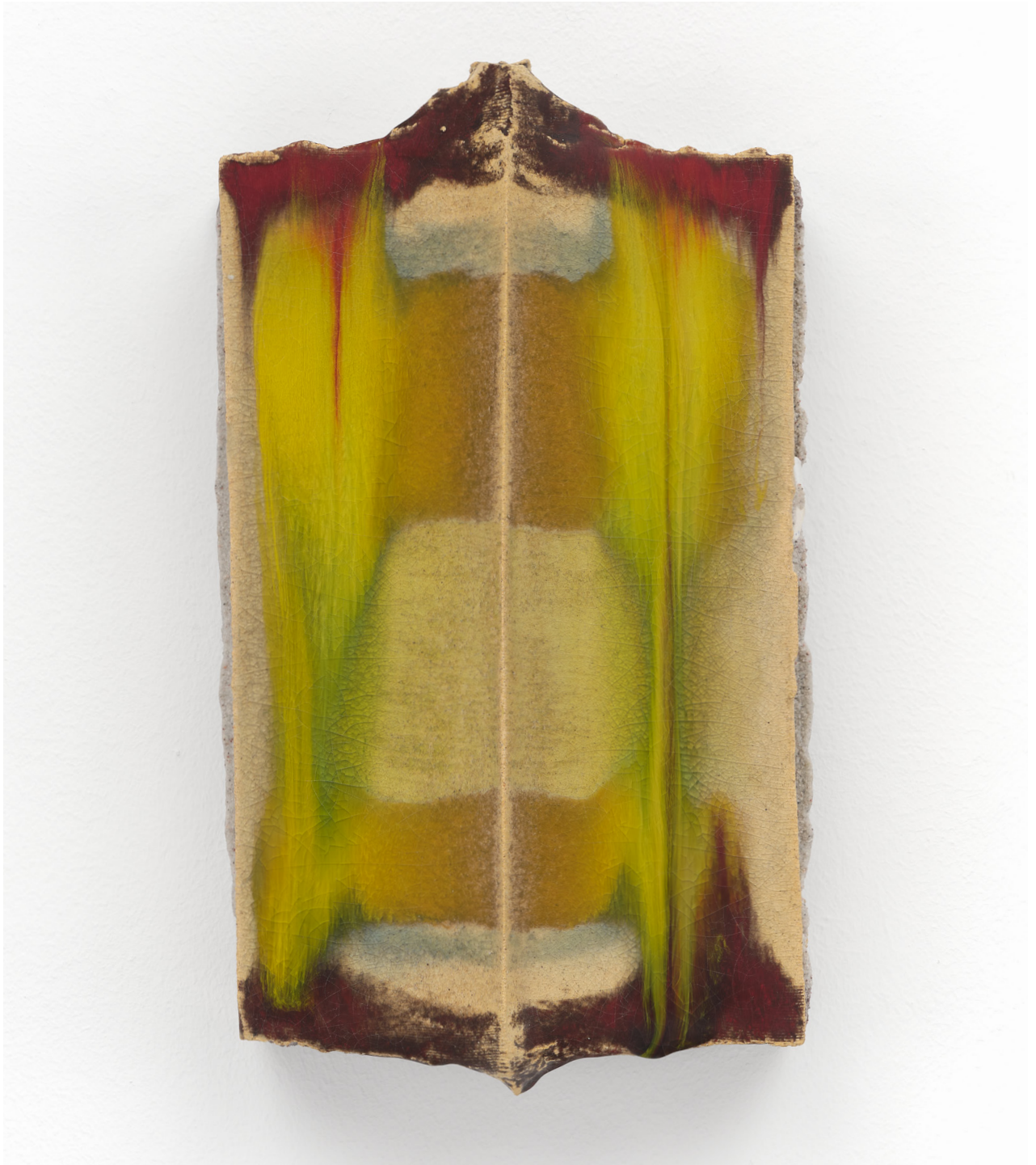
Cross Lypka h.e.r.d., 2024 glazed ceramic 13" x 8" x 3"