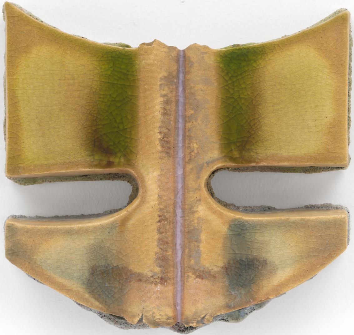
Cross Lypka crookrooks, 2024 glazed ceramic 11" x 11" x 2.5"