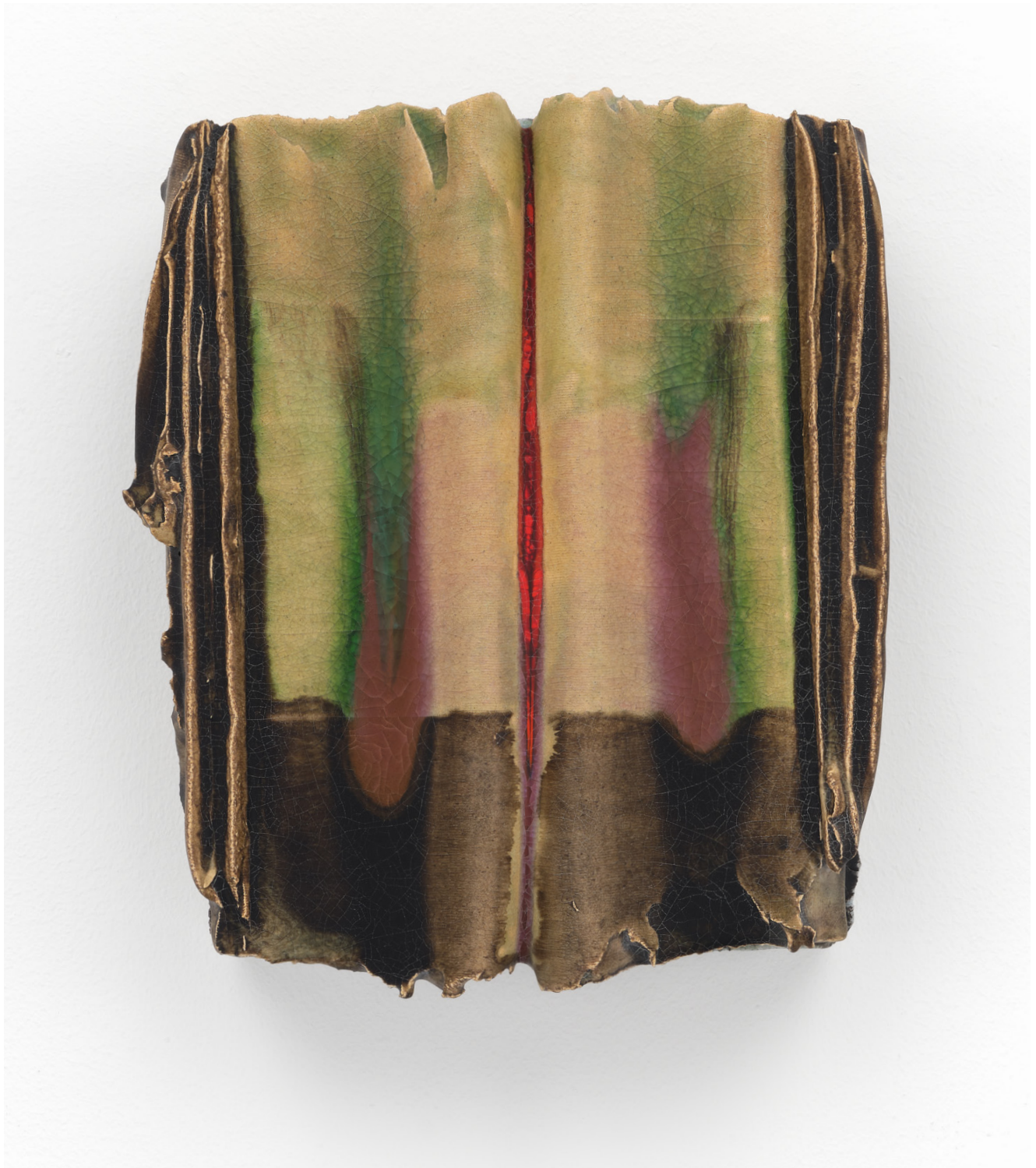
Cross Lypka Thunderhead, 2024 glazed ceramic 13" x 11" x 3"