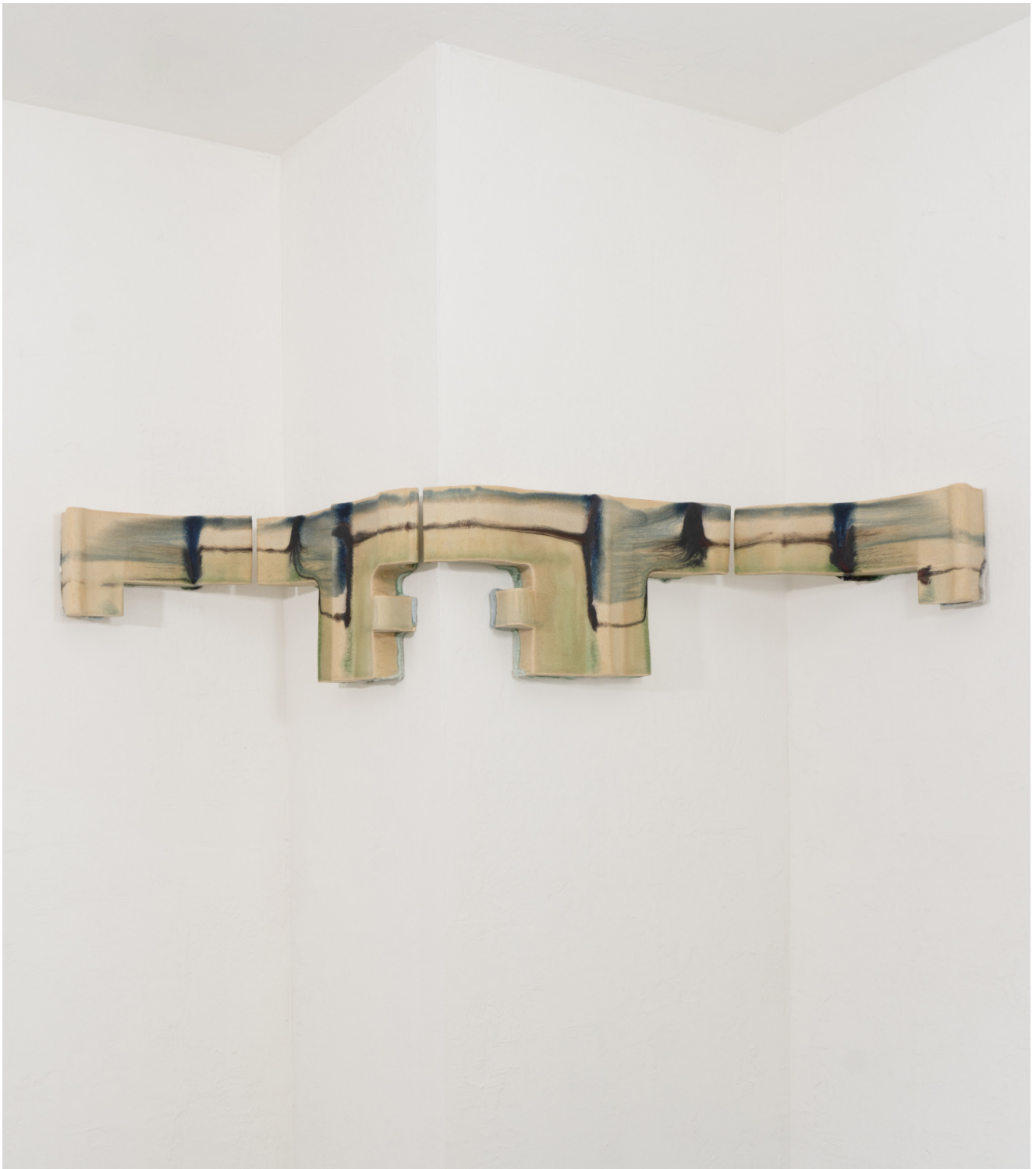
Cross Lypka vVVv, 2024 glazed ceramic 84" x 11" x 7"