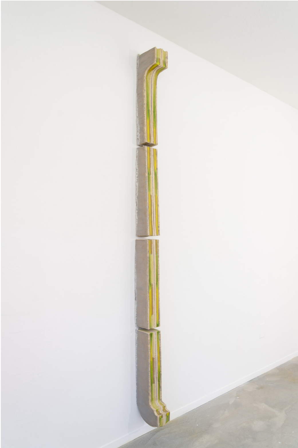
Cross Lypka TIIJ, 2024 glazed ceramic 84" x 4" x 7.5"