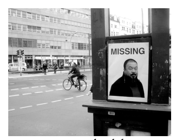
intensities are health, taste,

magic, death. A quadrangulation station where reverse destiny was the ultimate luxury.