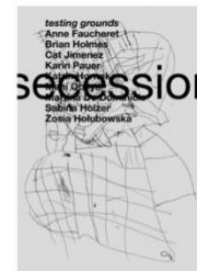
Katrin Hornek. testing grounds