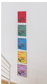
I have no change, 2023 Risograph Prints Printed on A3 Paper 6 frames, each 42 x 29.7 cm