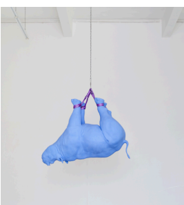
Rhino, 2022 PETG 3d print, fiberglass, resin 218 x 151 x 84cm (variable dimensions)