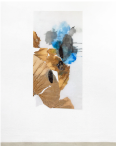
Brilon & Bestwig, 2023 Taro leaves ( Alocasia macrorrhiza ), polystyrene, polyester resin, oil paint, ink 200 x 100 cm