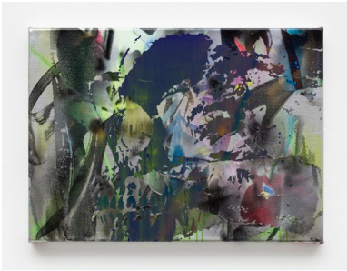
I3, 2023 Acrylic on canvas 50 x 70 x 4,5 cm