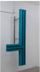
Untitled (I speak because I got asked, not because I know the truth), 2023 Gypsum, Styrofoam, Steel, Polyurea, Car Finish 200 x 75 x 10 cm