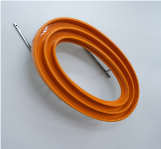
Untitled (Unlimited Access), 2023 Gypsum, Styrofoam, Steel, Polyurea, Car Finish 128 x 125 x 10 cm