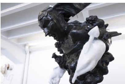
the revenge of Lady Snowblood, 2023 3D print 100 x 100 x 100 cm