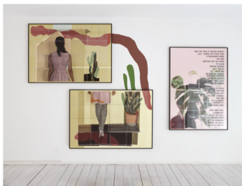
Rose (may the world be translated into stories about individuals ), 2023 Inkjet print on acetate, offset paper, lacquer total dimension: 180 x 280 cm