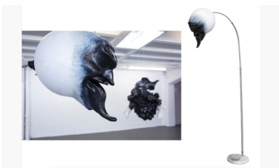
the revenge of Lady Snowblood, 2023 3D print, stone, steel 210 x 110 x 40 cm