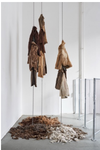
What You Waiting For?, 2023 Steel chains, shaved fur coats, hooks 400 x 200 x 300 cm (height variable)