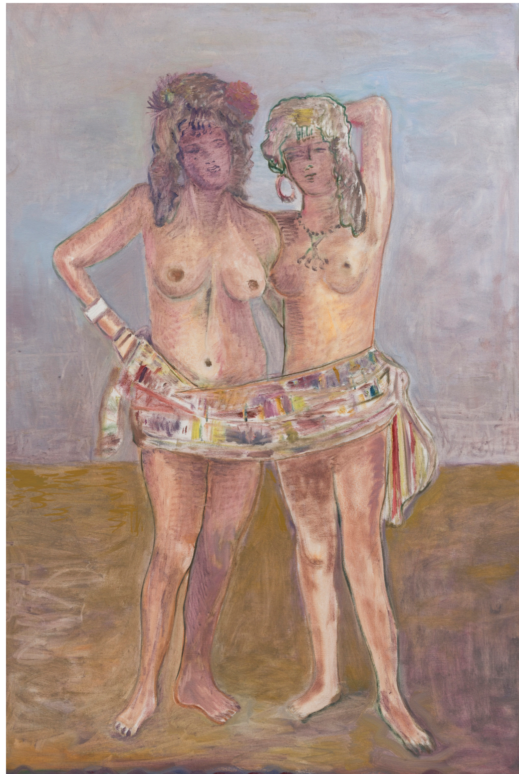
Behrang Karimi Body of Revolution , 2024 (detail) Oil on canvas 120x120 cm (47,2x47,2")