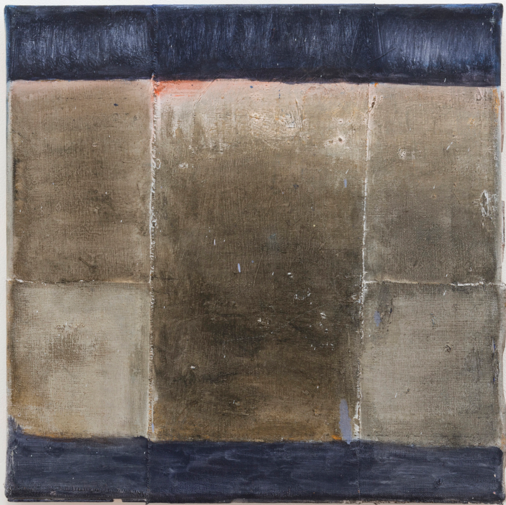
Behrang Karimi Nocturne wall , 2012 Oil on canvas 40x40 cm (15,7x15,7")