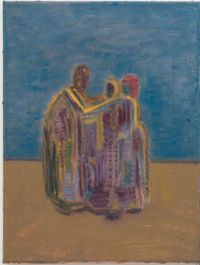
Behrang Karimi Masse liebt Dichte , 2024 Oil on canvas 40x30 cm (15,7x11,8")