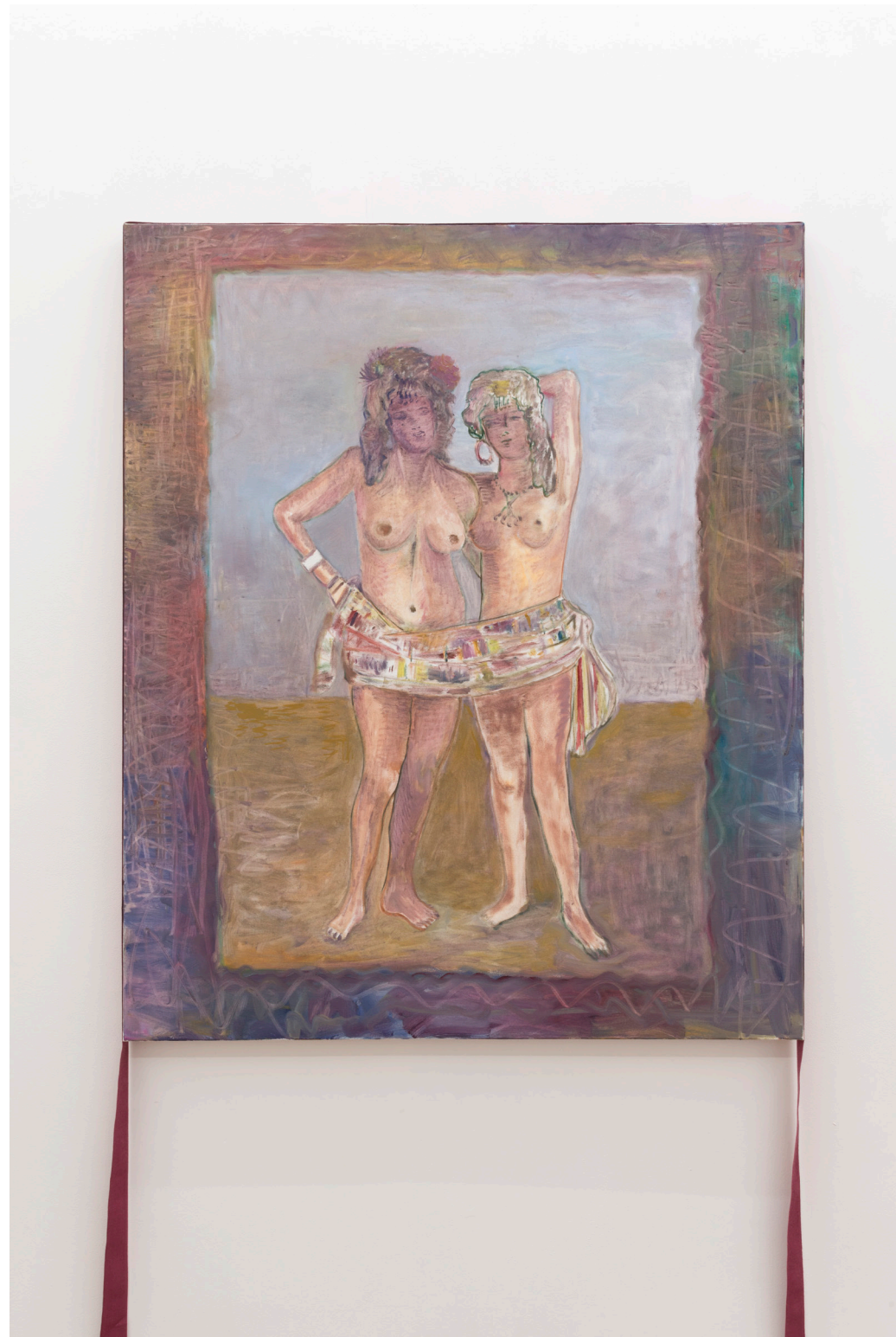
Behrang Karimi Body of Revolution , 2024 Oil on canvas 120x120 cm (47,2x47,2")