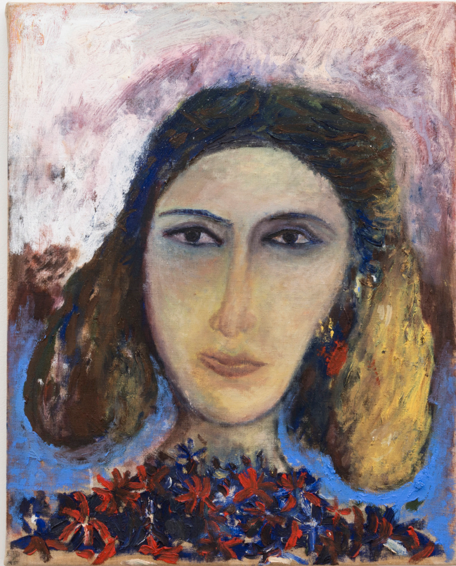
Behrang Karimi Mutter/Selbst , 2012 Oil on linen 50x40 cm (19,6x15,7")