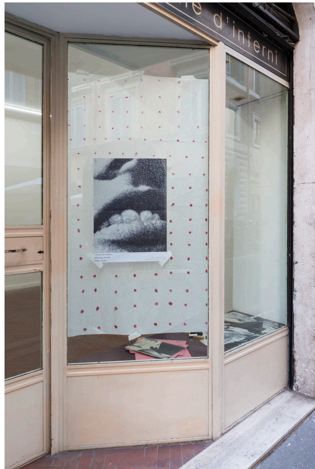
Behrang Karimi, Theory of a smell, 2024, exhibition view, Ermes Ermes, Rome, IT