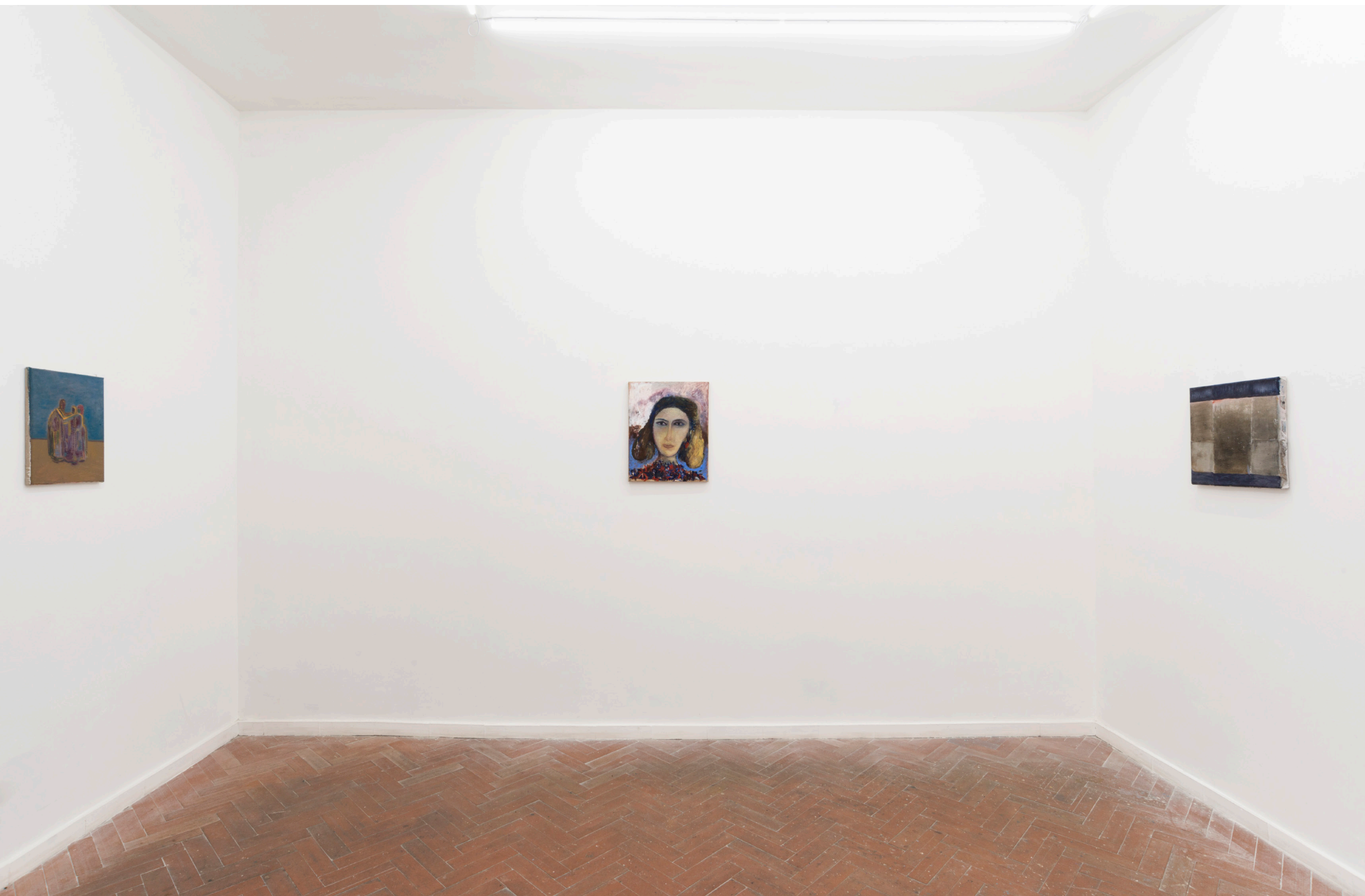
Behrang Karimi, Theory of a smell, 2024, exhibition view, Ermes Ermes, Rome, IT