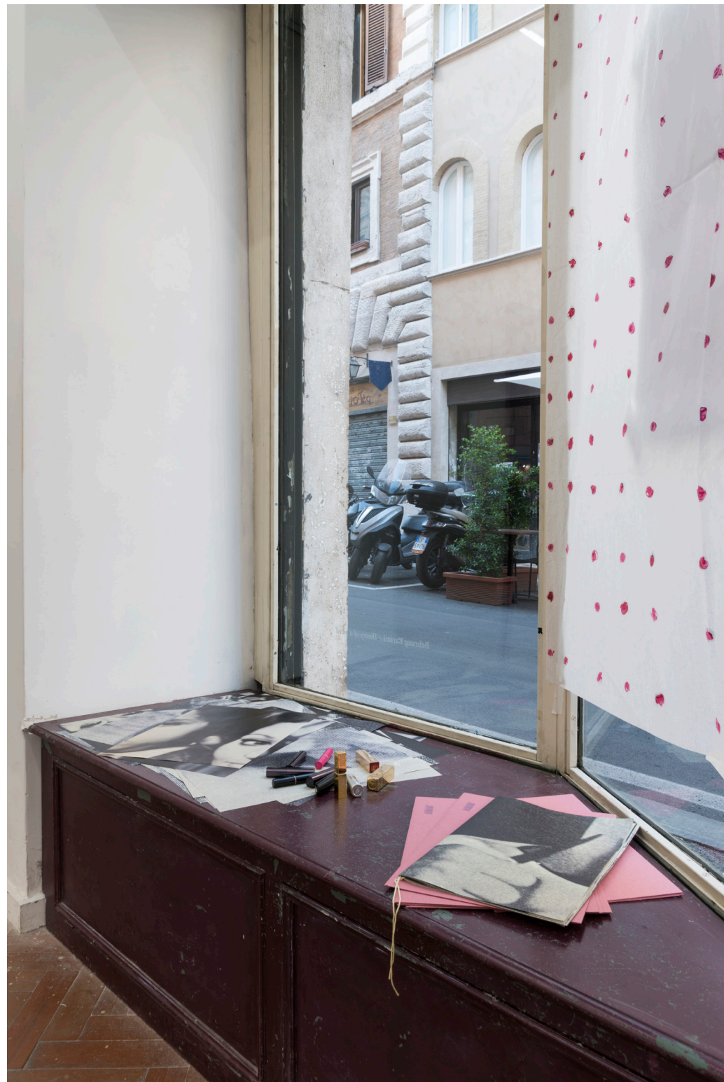
Behrang Karimi, Theory of a smell, 2024, exhibition view, Ermenegildo Zegna, Rome, IT