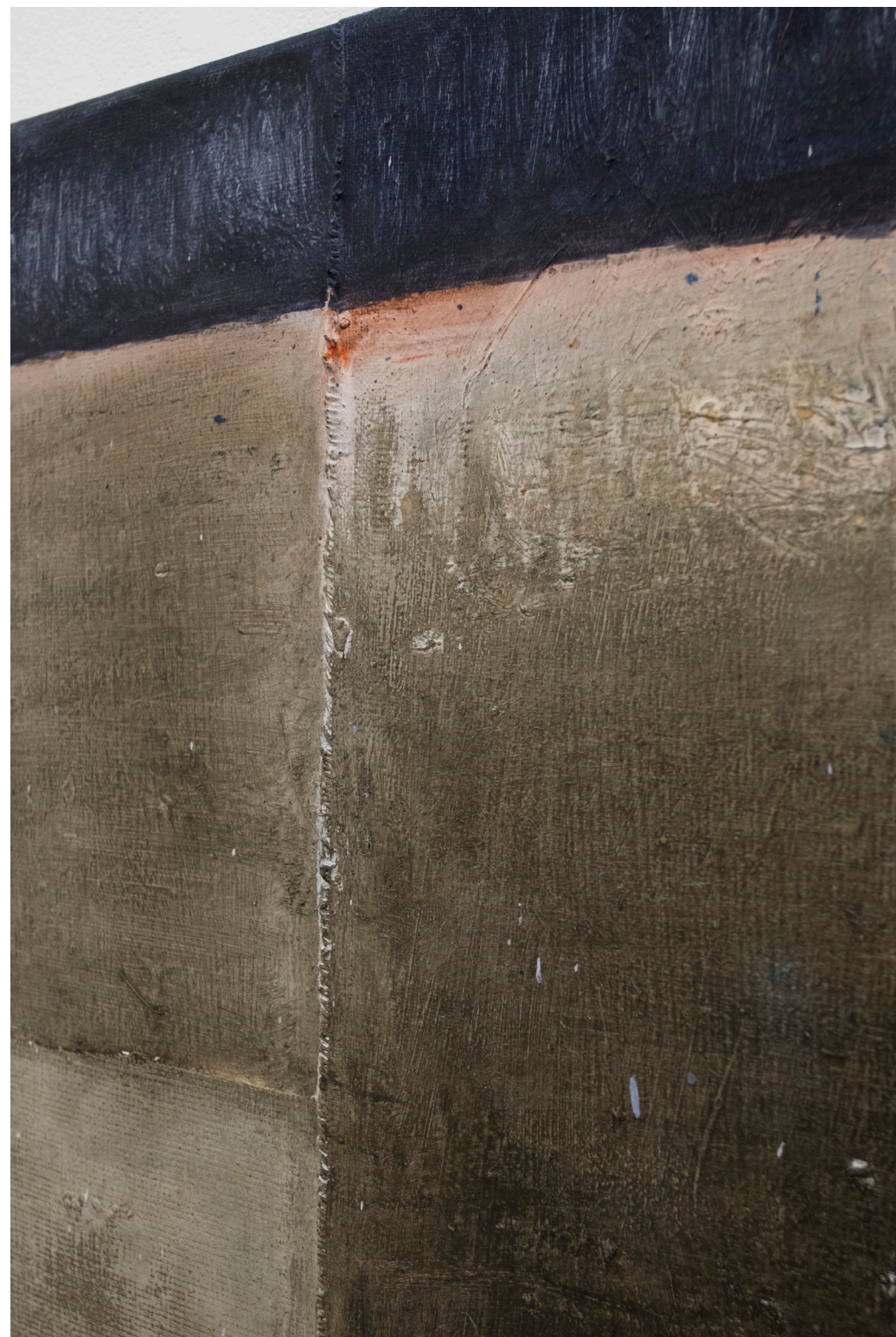
Behrang Karimi Nocturne wall , 2012 (detail) Oil on canvas 40x40 cm (15,7x15,7")