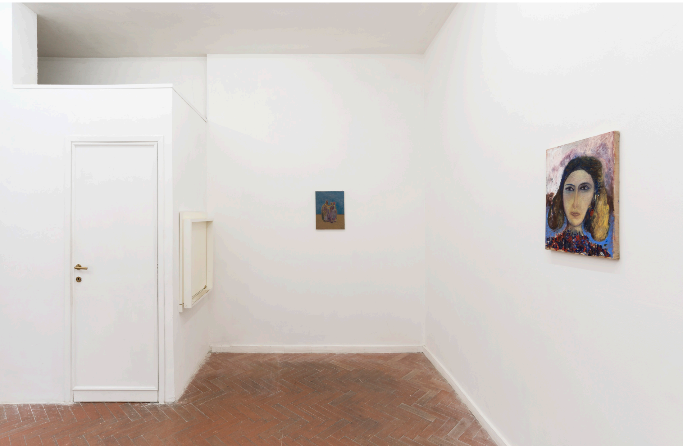
Behrang Karimi, Theory of a smell, 2024, exhibition view, Ermenegildo Zegna, Rome, IT