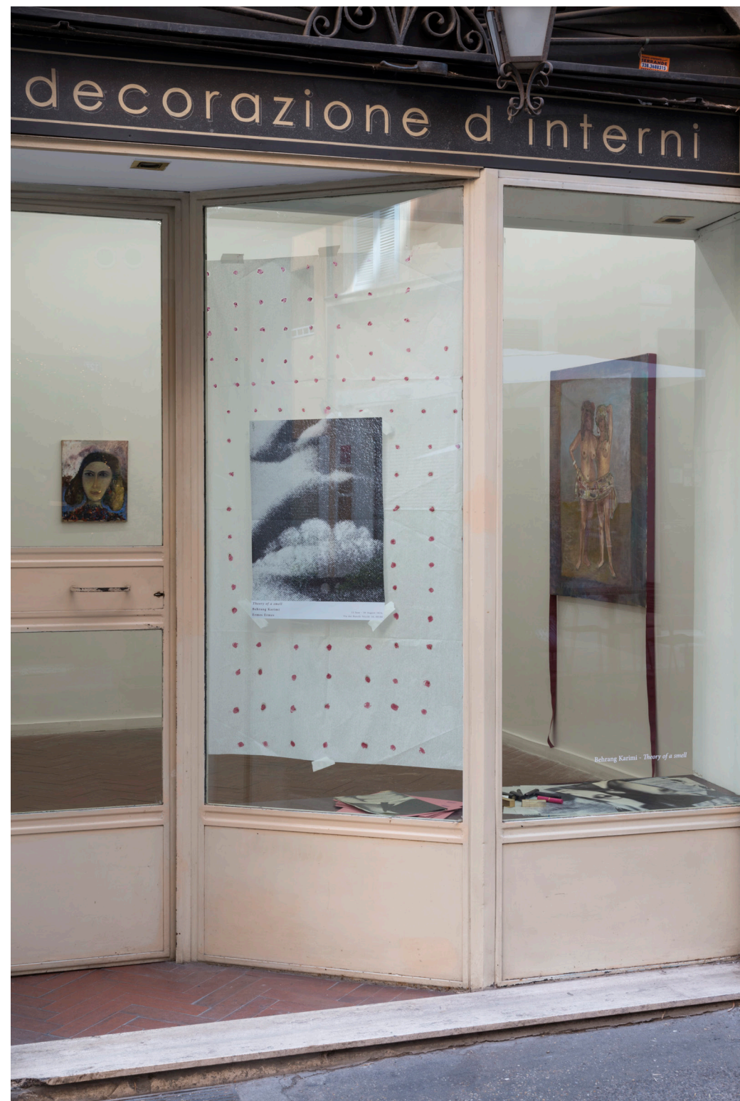
Behrang Karimi, Theory of a smell, 2024, exhibition view, Ermes Ermes, Rome, IT