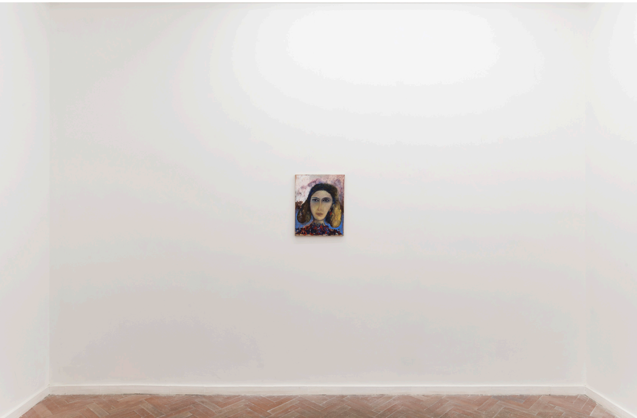
Behrang Karimi, Theory of a smell, 2024, exhibition view, Ermes Ermes, Rome, IT