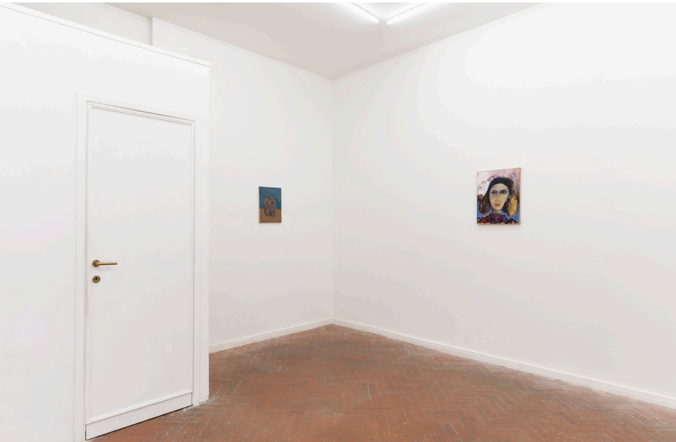
Behrang Karimi, Theory of a smell, 2024, exhibition view, Ermes Ermes, Rome, IT