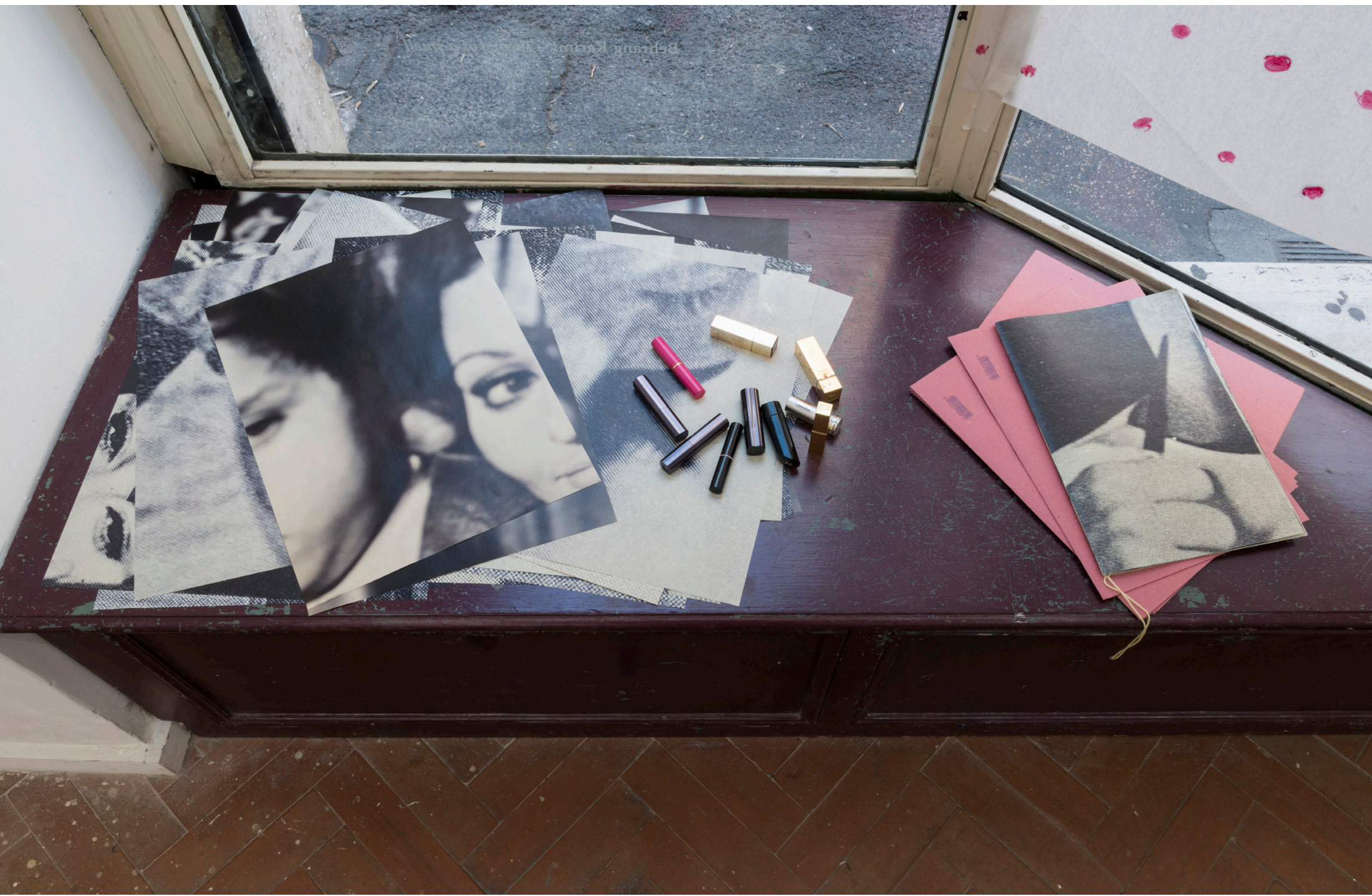
Behrang Karimi, Theory of a smell, 2024, exhibition view, Ermes Ermes, Rome, IT