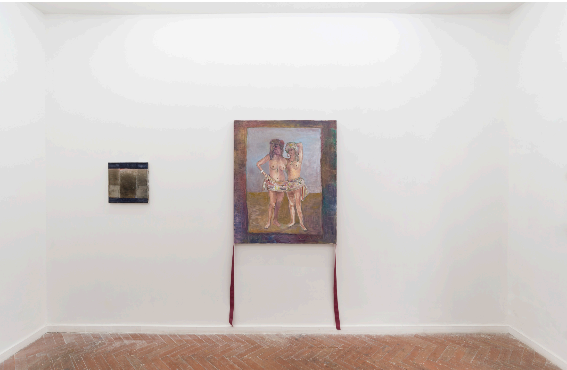
Behrang Karimi, Theory of a smell, 2024, exhibition view, Ermes Ermes, Rome, IT