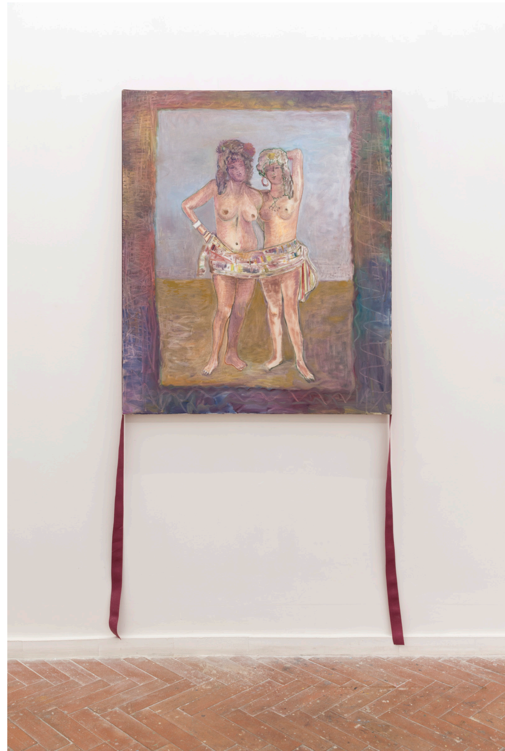
Behrang Karimi, Theory of a smell, 2024, exhibition view, Ermes Ermes, Rome, IT