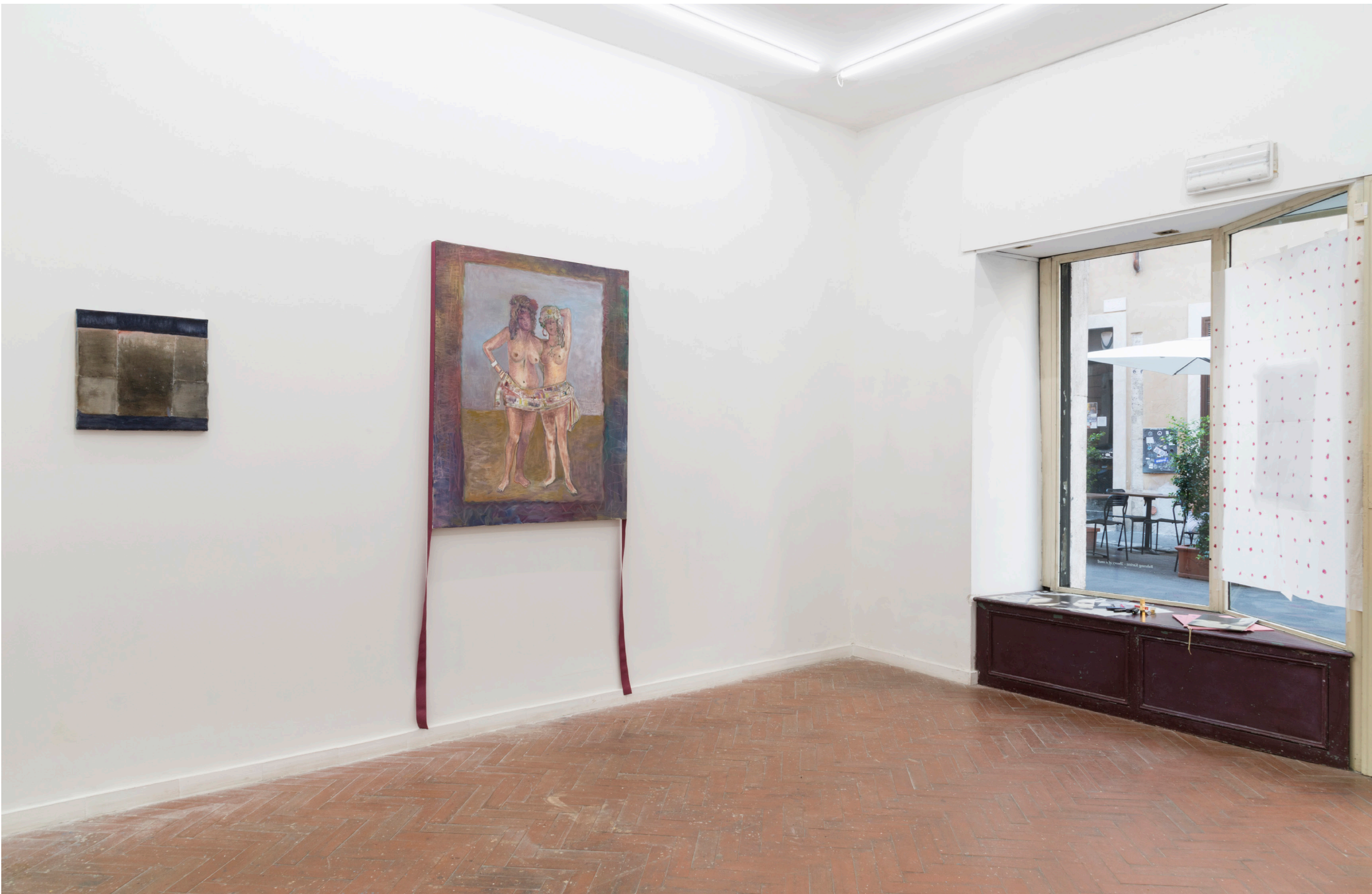
Behrang Karimi, Theory of a smell, 2024, exhibition view, Ermenegildo Zegna, Rome, IT