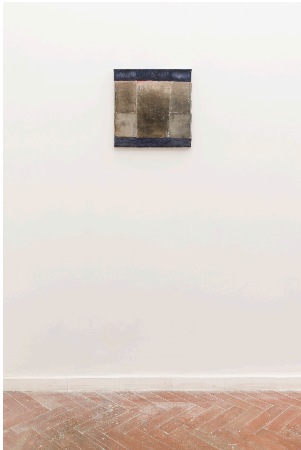
Behrang Karimi, Theory of a smell, 2024, exhibition view, Ermes Ermes, Rome, IT