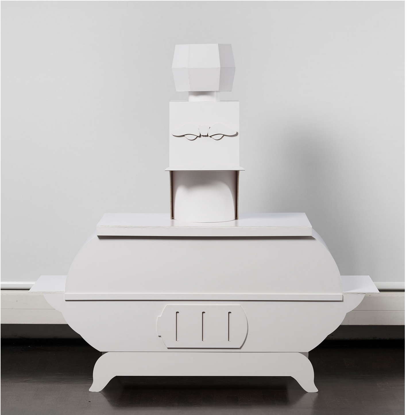
Asta Lynge Chef Bouche , 2024 Foamboard, glue, filler 160 x 135 x 57 cm