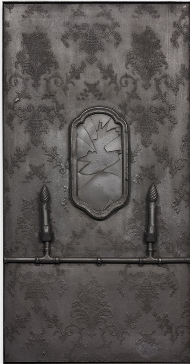
Rico Weber Zerbrochene Spiegel , 1993 Acrylic resin, silicone, metal 115 x 60 cm