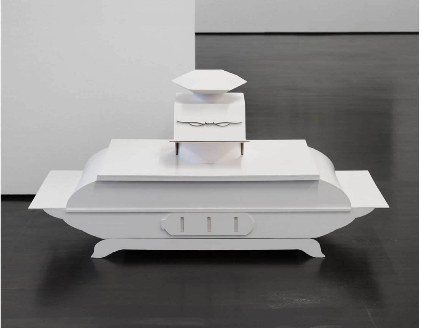
Asta Lyngé Chef Bouche (flat) , 2024 Foamboard, glue, filler 76 x 135 x 78 cm