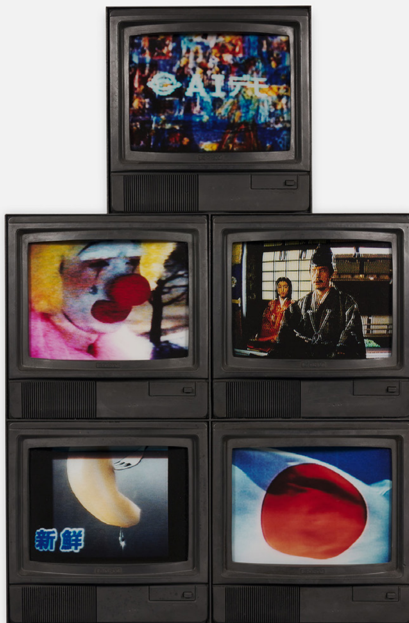
Rico Weber Telemix , 1994 Acrylic resin, silicone, metal, photo print 120 x 80 cm