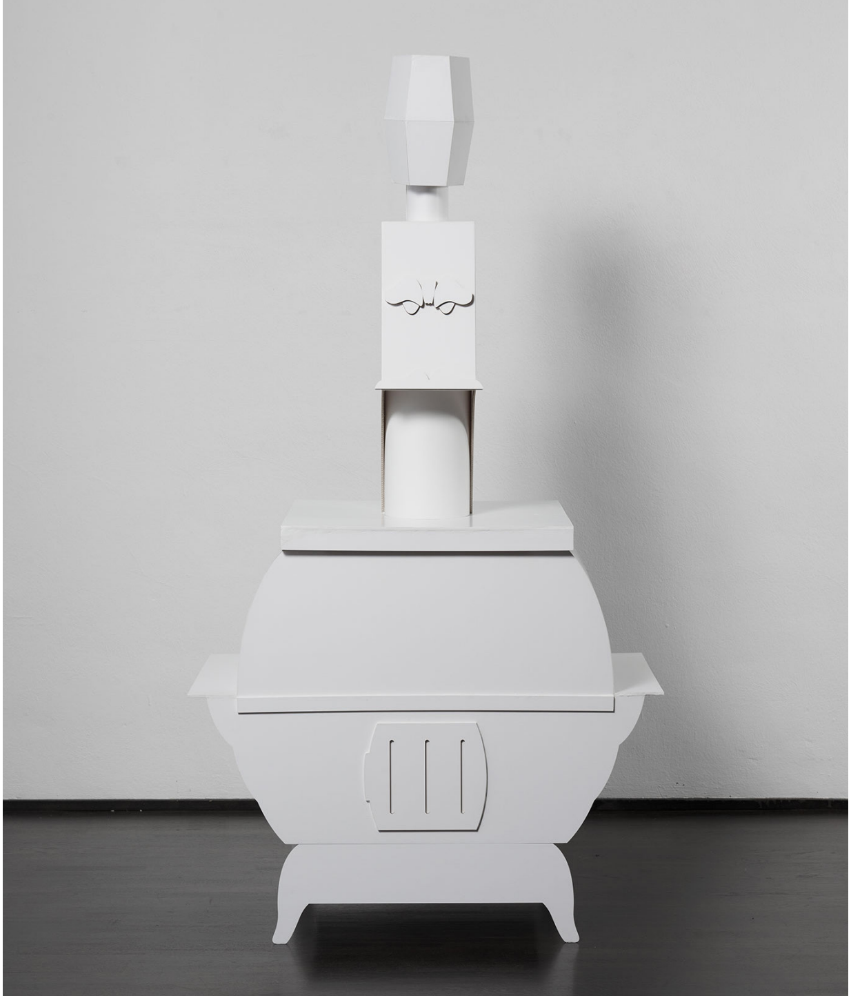
Asta Lynge Chef Bouche (tall) , 2024 Foamboard, glue, filler 190 x 102 x 70 cm