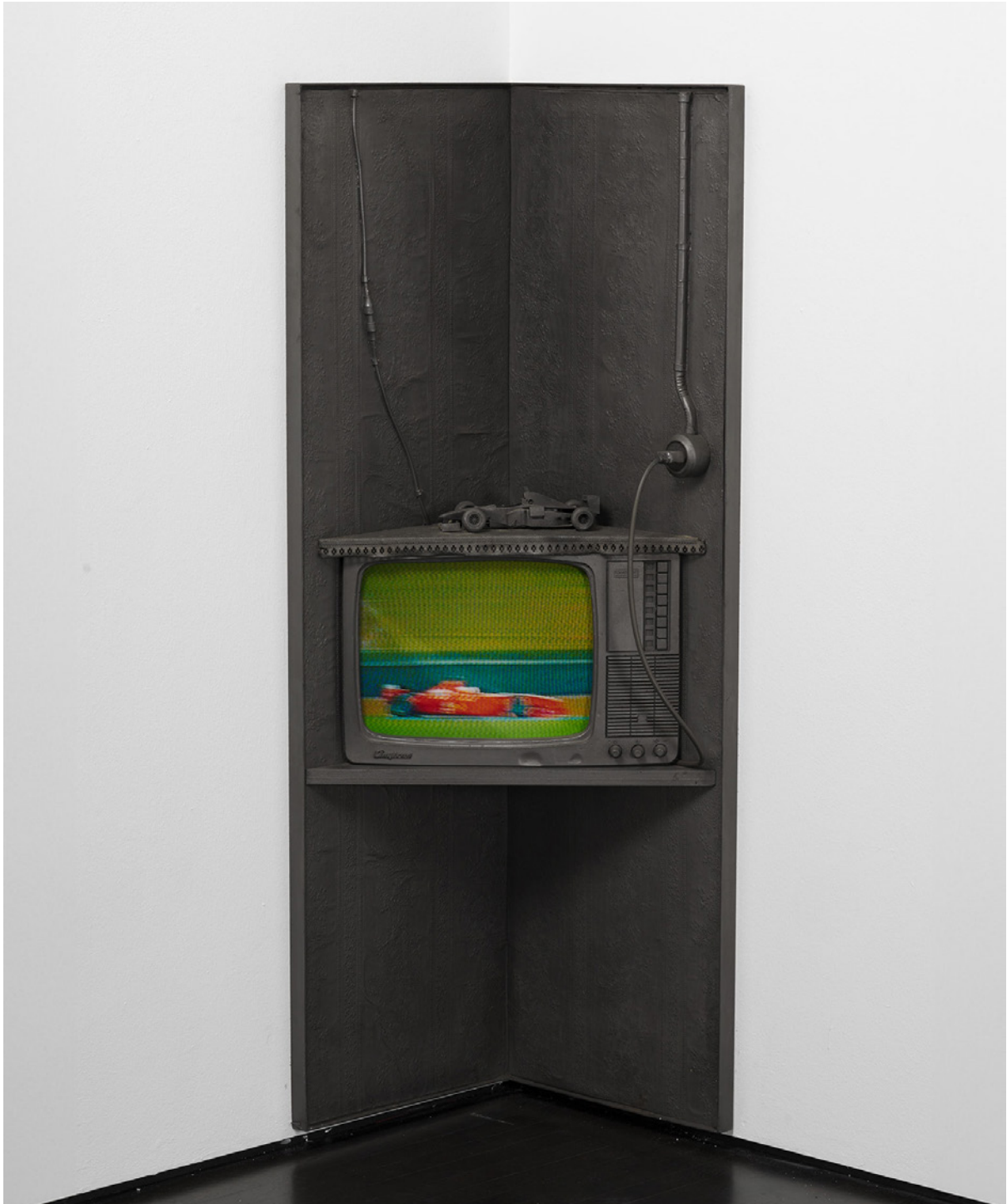
Rico Weber Ferrari Corner , 2000 Acrylic resin, silicone, metal, photo print 140 x 60 cm