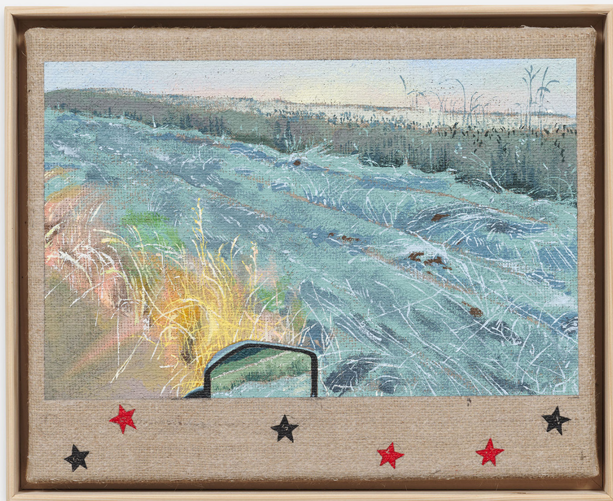
Elise Corpataux JUNE 18, 2023 Acrylic on canvas 24 x 30 cm