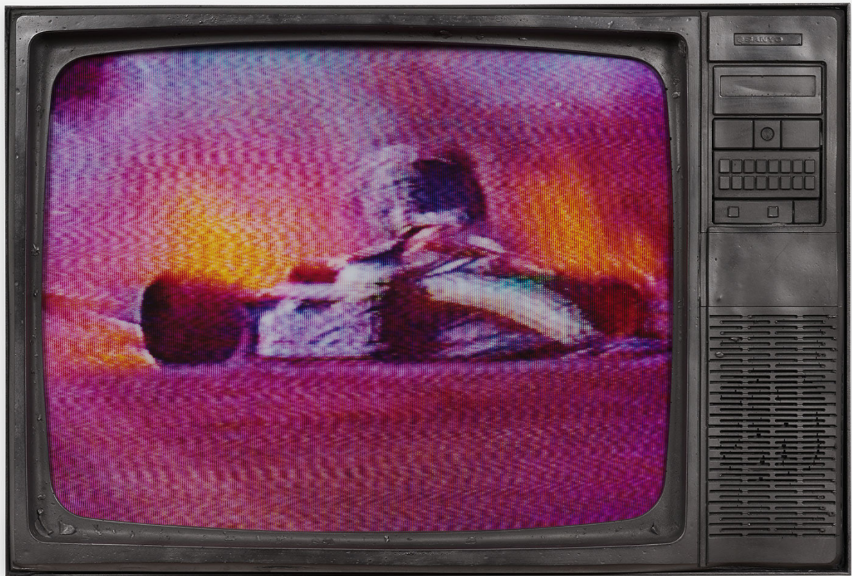
Rico Weber Fuego , 2000 Acrylic resin, silicone, metal, photo print 52 x 76 x 3 cm