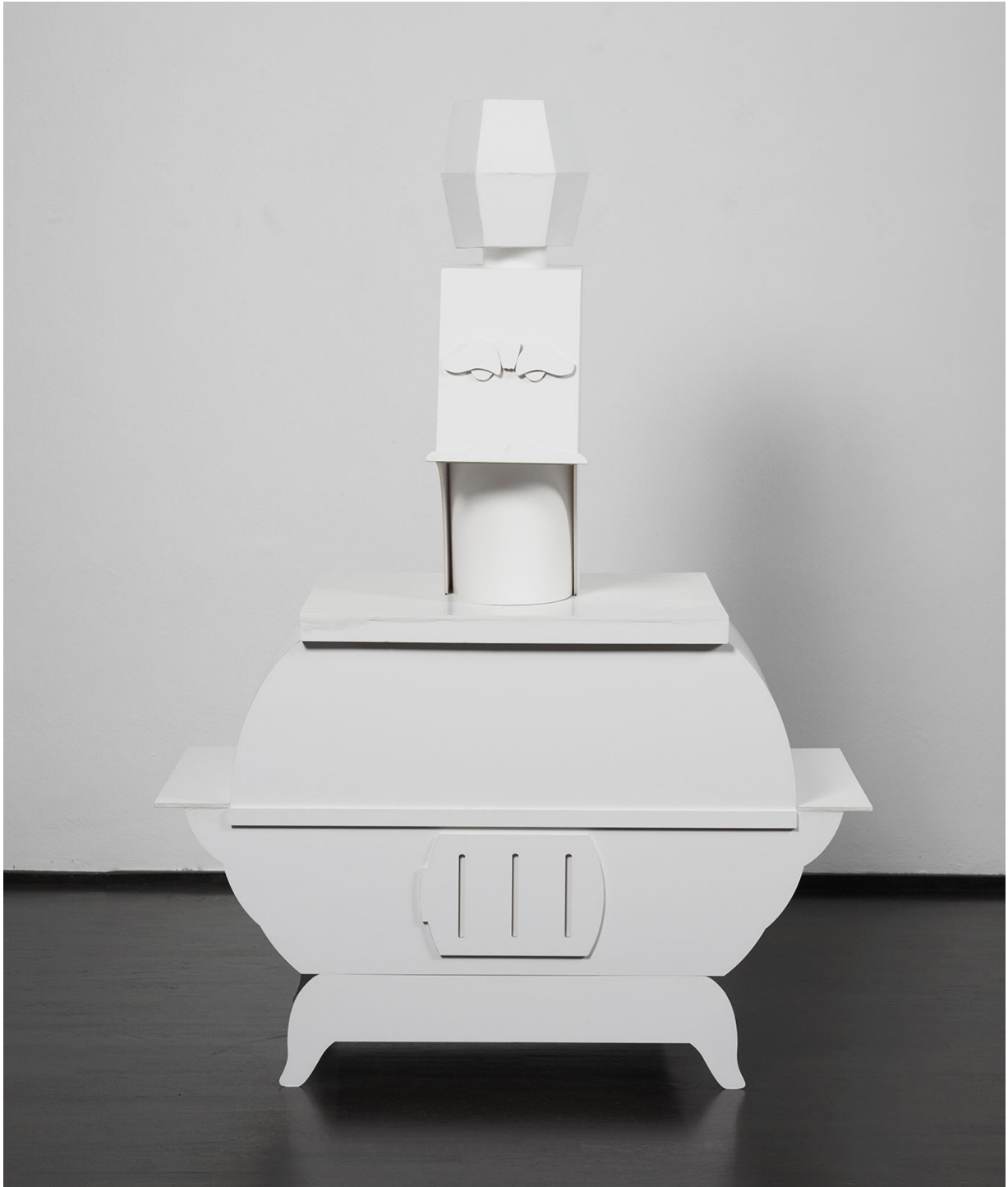
Asta Lynge Chef Bouche (elongated) , 2020 Foamboard, glue, filler 120 x 120 x 60 cm