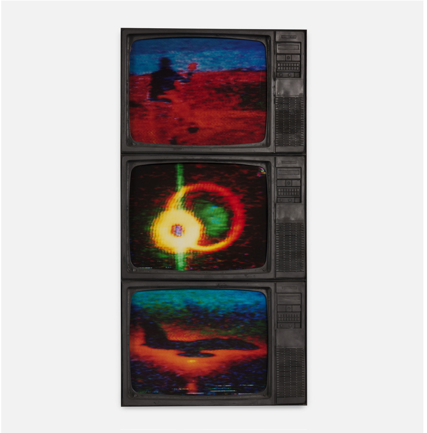
Rico Weber Unheimlich Schön , 1994 Acrylic resin, silicone, metal, photo print 154 x 76 cm