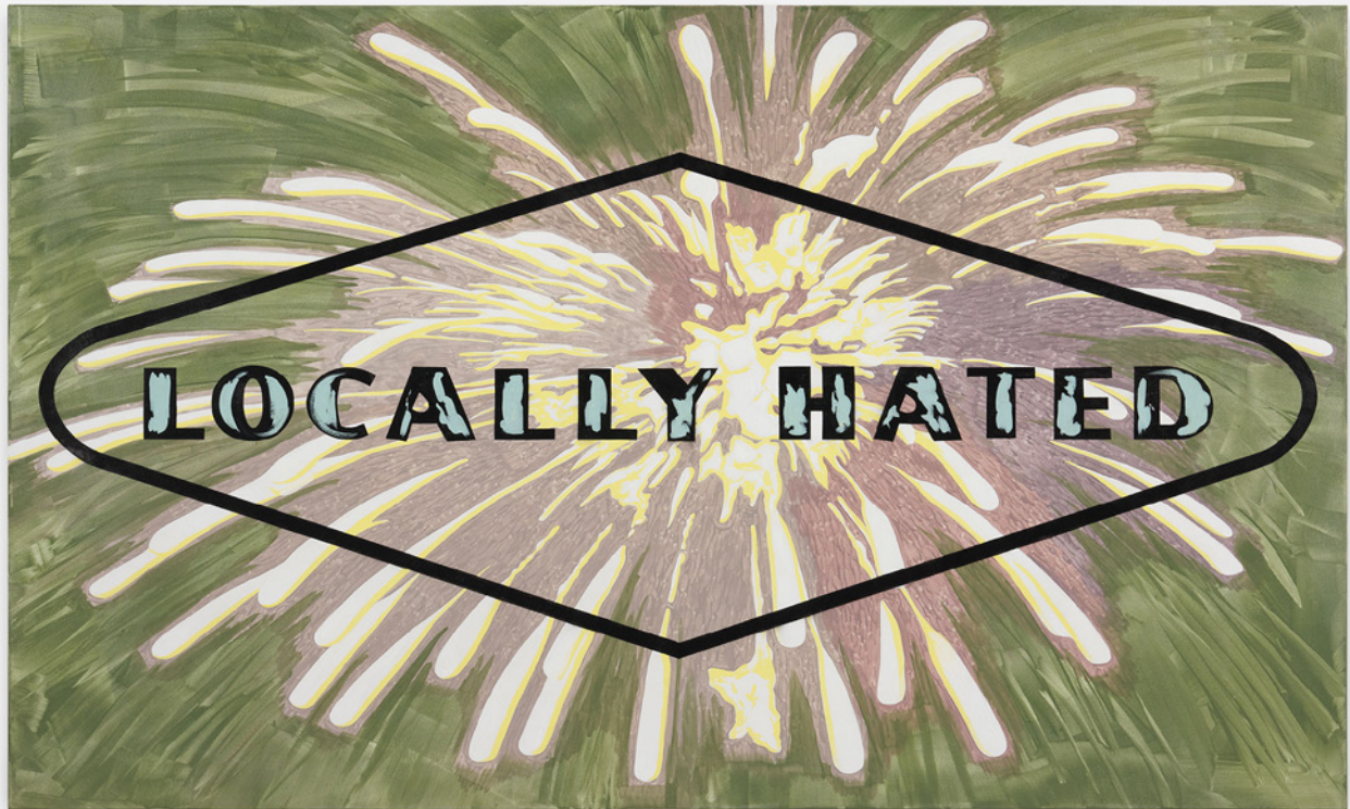
Elise Corpataux #1, Lucky that my breasts are small , 2021 Acrylic on canvas 120 x 200 cm