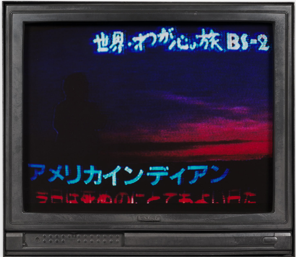
Rico Weber Sun Set , 1994 Acrylic resin, silicone, metal, photo print 56 x 65 cm