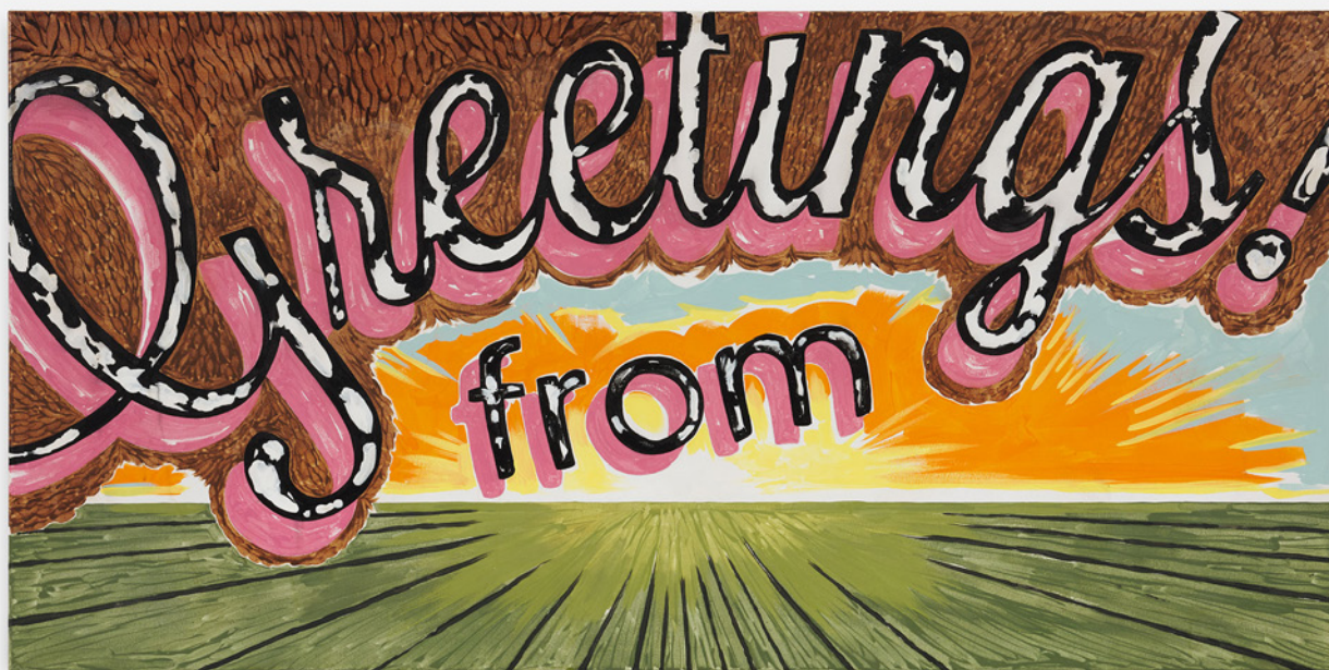
Elise Corpataux SMELL OF BED SHEETS , 2022 Acrylic on canvas 70 x 140 cm