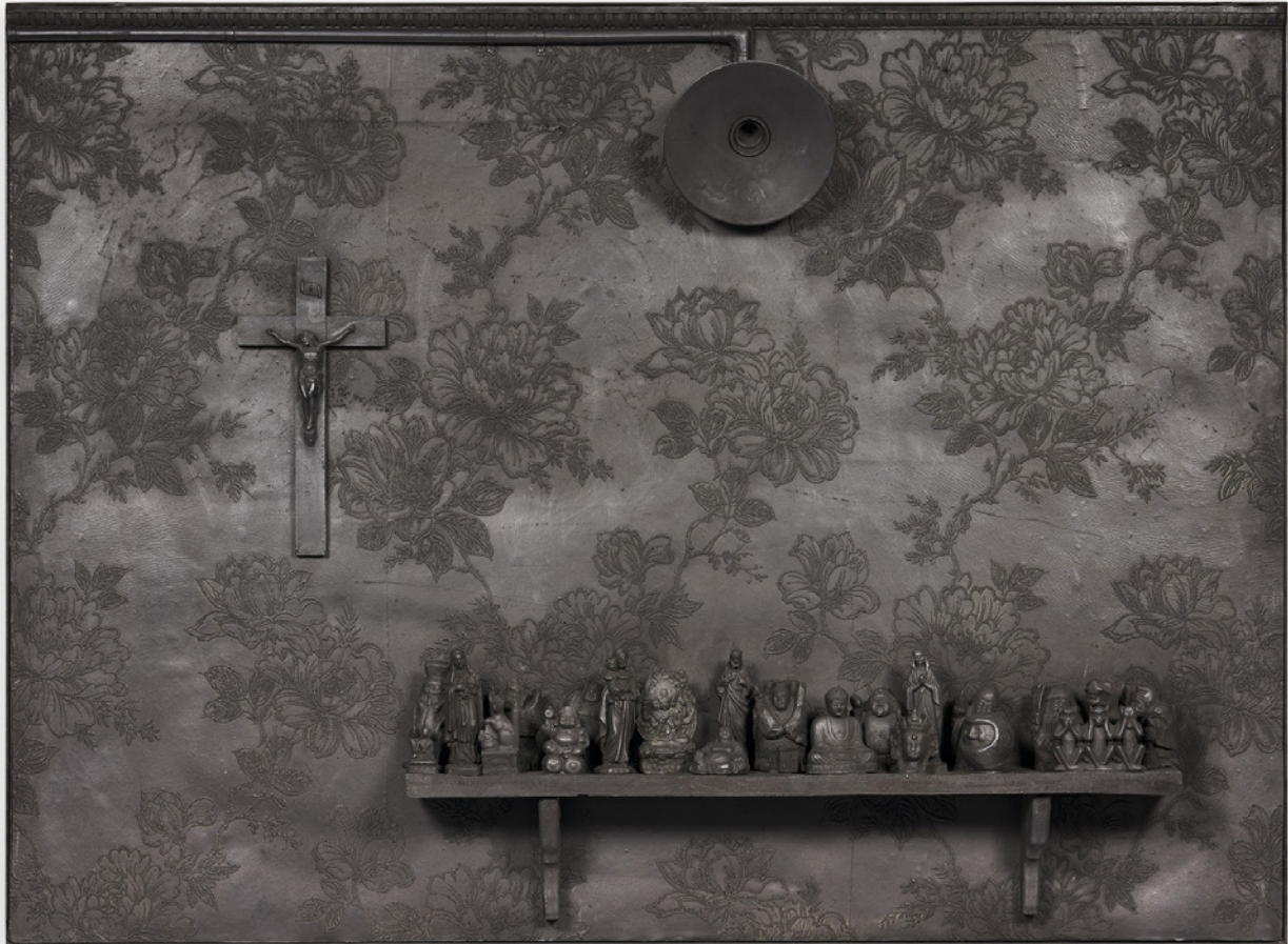
Rico Weber Es werde Licht auf dem Olymp Acrylic resin, silicone, metal 110 x 150 cm