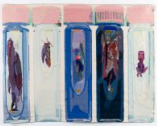
Sheila Held Imagines Agentes (from the Art of Memory series) , 1996 Wool, silk and metallic weft on cotton warp 39h x 50w in 99.06h x 127w cm SHE-96-01