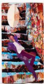
Sheila Held The Hybrid Dreams of the Egg (from The Dreamers series) , 2020 Wool and silk weft on cotton warp 77h x 39w in 195.58h x 99.06w cm SHE-20-01