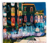
Sheila Held House Party (from the Phenomena + Noumena series), 2021 Wool and silk weft on cotton warp 38h x 38.50w in 96.52h x 97.79w cm SHE-21-02