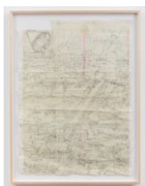
Sheila Held The Rocket Dreams of the Mother Ship (from The Dreamers series), 2022 graphite, colored pencil and tape on graph paper 30.50h x 22.25w in 77.47h x 56.52w cm SHE-22-02