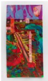
Sheila Held The Rocket Dreams of the Mother Ship (from The Dreamers series), 2022 Wool and silk weft on cotton warp 80h x 40w in 203.20h x 101.60w cm SHE-22-01