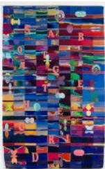
Sheila Held Sabotage the Grid (from the Text/Tiles series) , 1988 wool weft on cotton warp 81h x 51w in 205.74h x 129.54w cm SHE-88-01