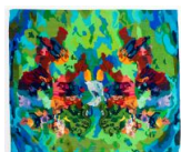
Sheila Held Guardians of the Secret (from the Broken Symmetry series), 2021 Wool and silk weft on cotton warp 34h x 39w in 86.36h x 99.06w cm SHE-21-01