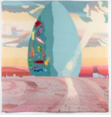
Sheila Held Sunnyside Up (from the Origins series) , 1993 Wool and cotton weft on cotton warp 54h x 51w in 137.16h x 129.54w cm SHE-93-01