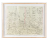
Sheila Held House Party (from the Phenomena + Noumena series), 2021 graphite, colored pencil and tape on graph paper 16.50h x 22w in 41.91h x 55.88w cm SHE-21-04