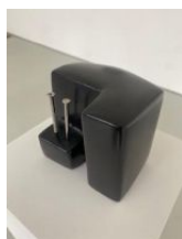
Margaret Lee Form #3 (nail & screw), 2022 Foam, aqua resin, aqua veil, gesso, wax, polished stainless steel. 4h x 4 1/2w x 4 1/4d in 10.16h x 11.43w x 10.80d cm ML-22-06