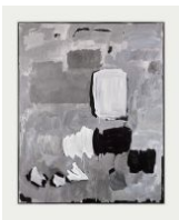
Margaret Lee Inner Form, #1 (white, black, sliver) , 2022 oil paint on canvas. Brushed alluminum frame 60h x 48w in 152.40h x 121.92w cm ML-22-03