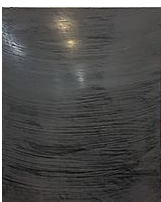
Alex Kwartler Us , 2022 Plaster on panel 20h x 16w in 50.80h x 40.64w cm ALK-22-03