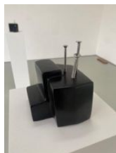
Margaret Lee Form #2 (nail & 2 screws), 2022 Foam, aqua resin, aqua veil, gesso, wax, polished stainless steel. 5 1/2h x 4 1/2w x 4 1/2d in 13.97h x 11.43w x 11.43d cm ML-22-05