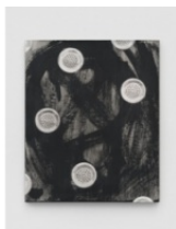
Alex Kwartler Messages , 2022 Oil and plaster on linen 20h x 16w in 50.80h x 40.64w cm ALK-22-02