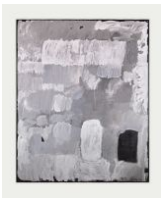
Margaret Lee Inner Form, #3 (white, black, sliver) , 2022 oil paint on canvas. Brushed alluminum frame 60h x 48w in 152.40h x 121.92w cm ML-22-02