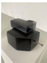
Margaret Lee Form #6 (nail & screw) , 2022 Foam, aqua resin, aqua veil, gesso, wax, polished stainless steel. 4 3/4h x 7 1/4w x 5d in 12.07h x 18.42w x 12.70d cm ML-22-09