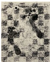
Alex Kwartler Two Left Feet , 2021 Oil on linen 20h x 16w in 50.80h x 40.64w cm ALK-21-01