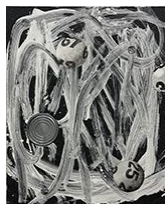
Alex Kwartler However (with tuna), 2021 Oil and plaster on linen with tin can 20h x 16w in 50.80h x 40.64w cm ALK-21-04