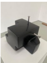
Margaret Lee Form #1 (nail & screw) , 2022 Foam, aqua resin, aqua veil, gesso, wax, polished stainless steel. 5h x 5w x 4 1/4d in 12.70h x 12.70w x 10.80d cm ML-22-04