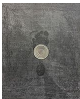
Alex Kwartler ≈9:00 - 10:00 pm, n.d. (with tuna) , 2022 Oil on linen with tin can 20h x 16w in 50.80h x 40.64w cm ALK-22-01