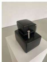
Margaret Lee Form #4 (nail & screw), 2022 Foam, aqua resin, aqua veil, gesso, wax, polished stainless steel. 4 3/4h x 4 1/2w x 4 3/4d in 12.07h x 11.43w x 12.07d cm ML-22-07