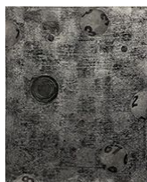
Alex Kwartler Ground Floor, 2021 Oil on linen 20h x 16w in 50.80h x 40.64w cm ALK-21-03