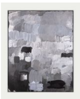
Margaret Lee Inner Form, #2 (black, sliver) , 2022 oil paint on canvas. Brushed alluminum frame 60h x 48w in 152.40h x 121.92w cm ML-22-01