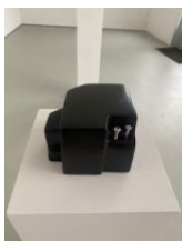
Margaret Lee Form #5 (nail & screw) , 2022 Foam, aqua resin, aqua veil, gesso, wax, polished stainless steel. 3 1/4h x 4 1/4w x 4 3/4d in 8.26h x 10.80w x 12.07d cm ML-22-08