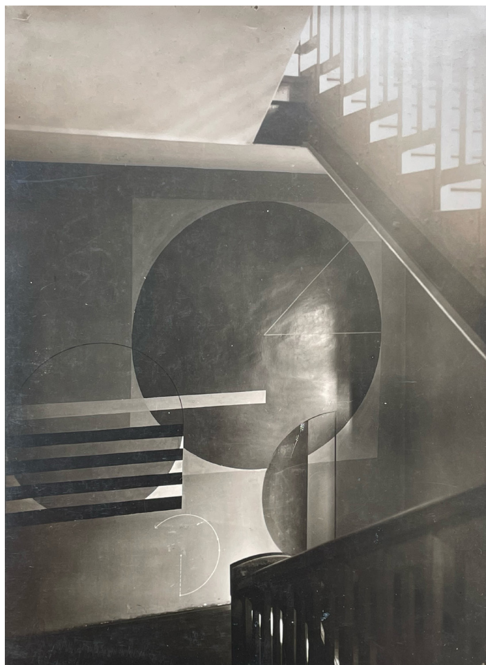
Lucia Moholy, Treppenhaus Bauhaus Weimar mit Wandgestaltung von Herbert Bayer, 1923