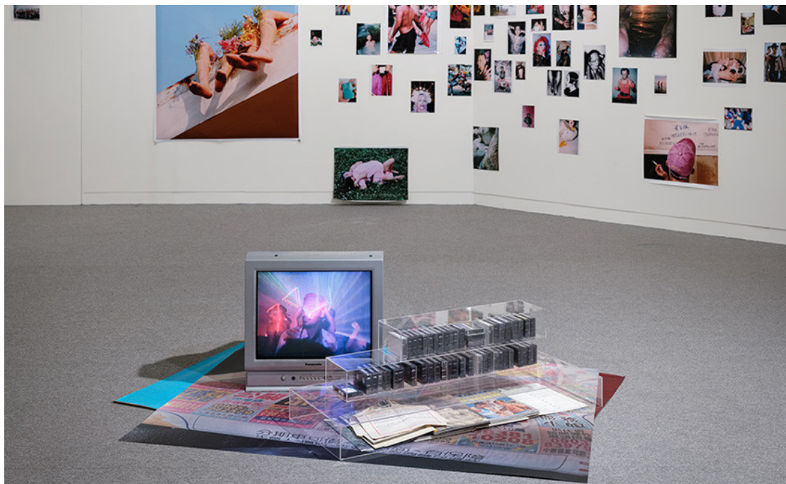
Installation views from Father's Videotapes_Avoid A Void (2021, NCCU Art & Culture Center, Taiwan)

As a photographer, he has worked on fashion, advertising, and numerous celebrity projects for “Vogue Taiwan,” “GQ Taiwan,” “marie claire,” and others. He has photographed notable Japanese celebrities such as Naomi Watanabe and Nana Komatsu. As an artist, he has expanded his activities to Hong Kong, Berlin, and Tokyo. In 2019, Father's Videotapes won the Grand Prize at the Taipei Art Awards. An extension of that series, Father's Videotapes_Avoid A Void was shortlisted for the Taishin Arts Award in 2021. The third iteration, Diverse identities_Father's Videotapes , this most recent series was produced in 2022 with a refocus on his hometown and showcased in the Taiwanese-Lithuanian cultural exchange group exhibition Covered Reality: Archival Orientation and Identity in Taiwanese Contemporary Photography .