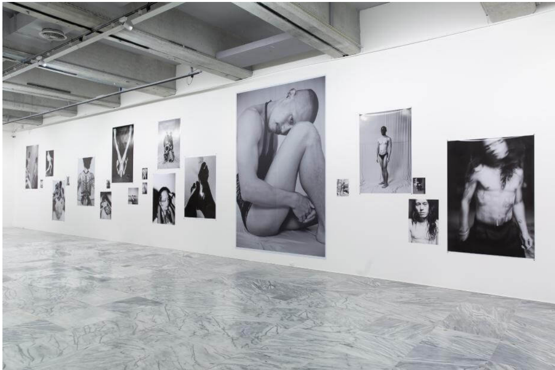
Installation views from Home Pleasure (2022, Taipei Fine Arts Museum, Taiwan)

Maruka bldg 2F, 2-2-14 Nihonbashi-Bakurocho, Chuo-ku, Tokyo