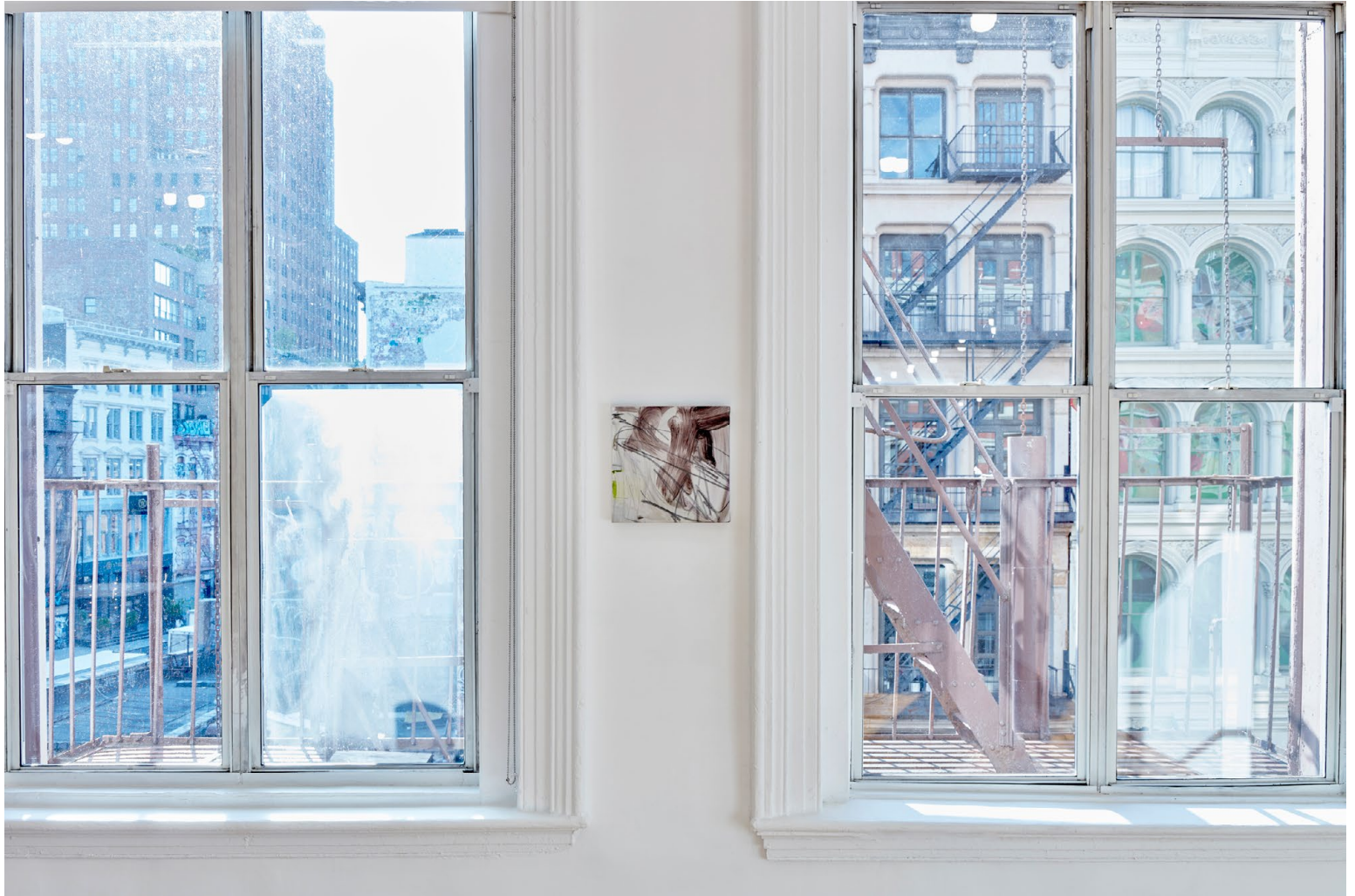
Exhibition view: The Principal Cause of Serial Monogamy 2024 Tara Downs, New York Image courtesy of the artist and Tara Downs, New York.