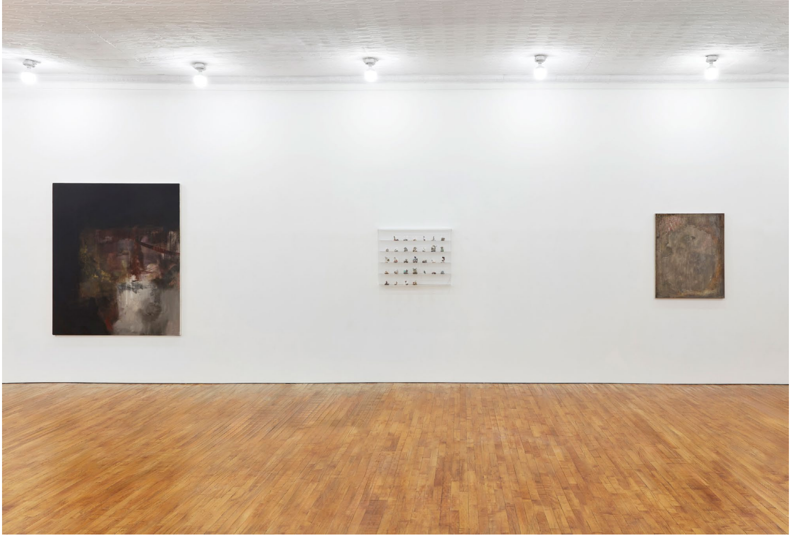
Exhibition view: The Principal Cause of Serial Monogamy 2024 Tara Downs, New York Image courtesy of the artist and Tara Downs, New York.