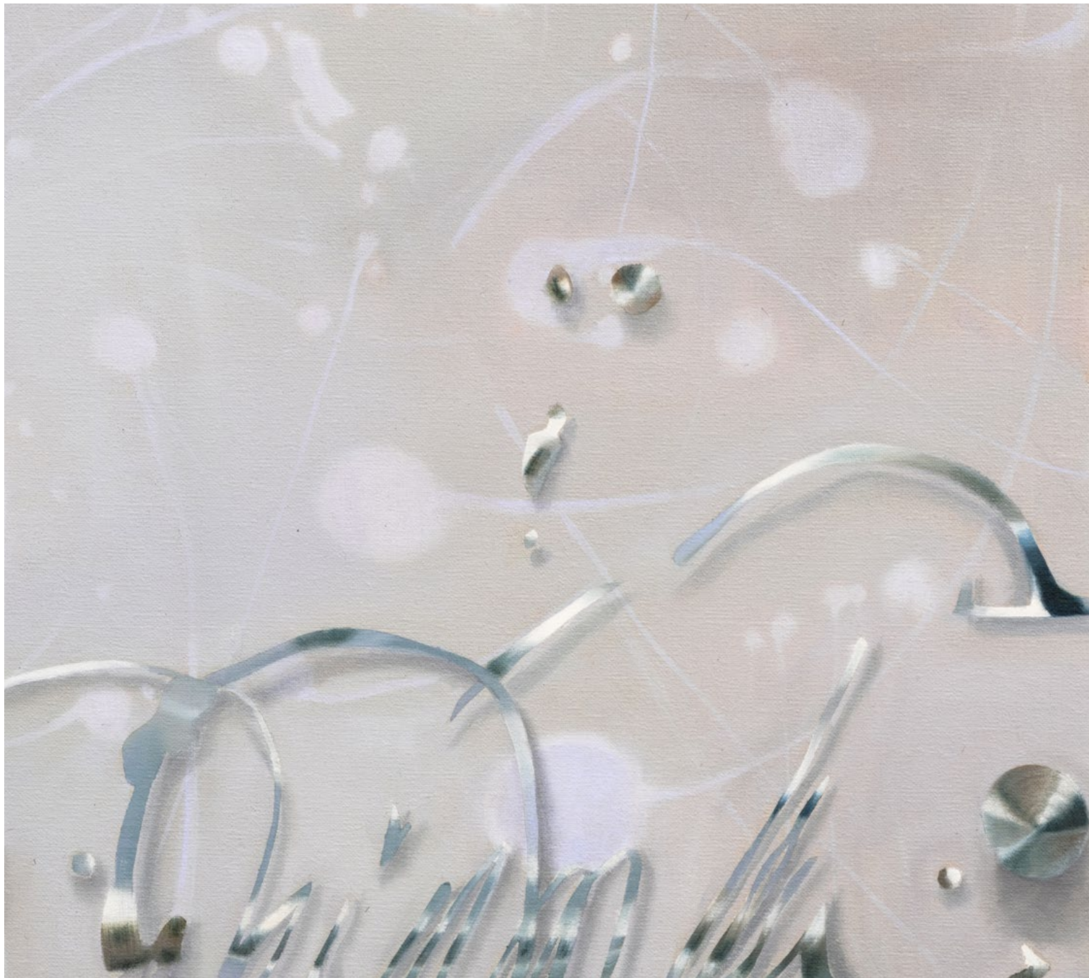
LAUREN ANAÏS HUSSEY Is Ought (Niñ_ 2) , 2024 (detail) Oil on linen