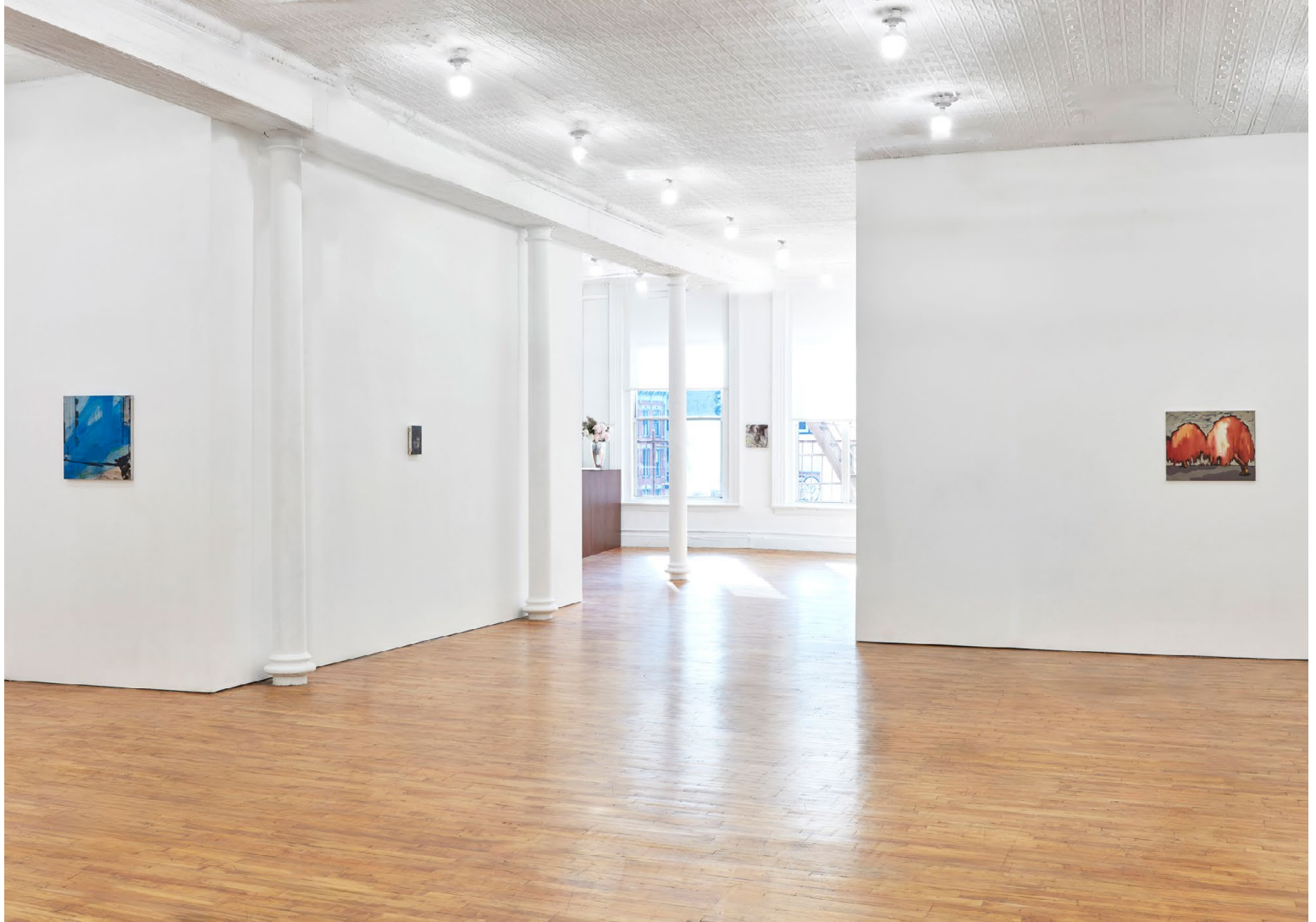
Exhibition view: The Principal Cause of Serial Monogamy 2024 Tara Downs, New York