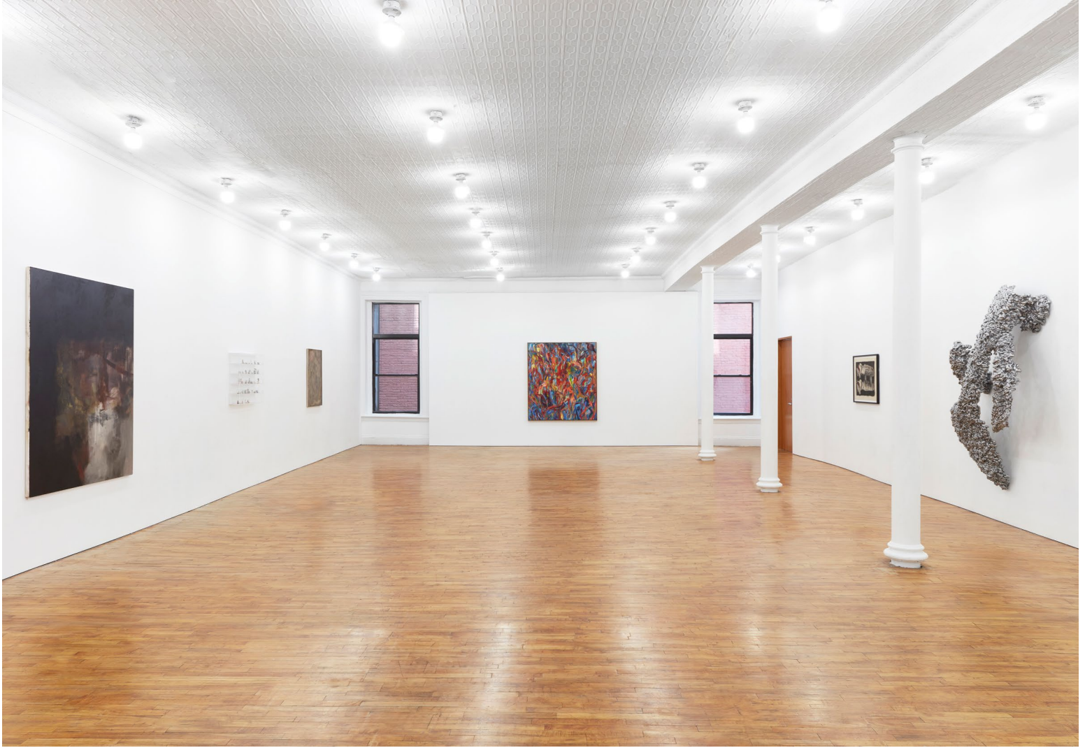
Exhibition view: The Principal Cause of Serial Monogamy 2024 Tara Downs, New York