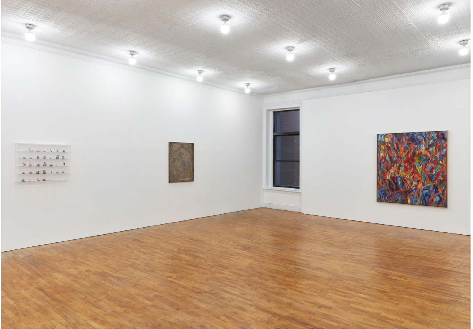
Exhibition view: The Principal Cause of Serial Monogamy 2024 Tara Downs, New York Image courtesy of the artist and Tara Downs, New York.