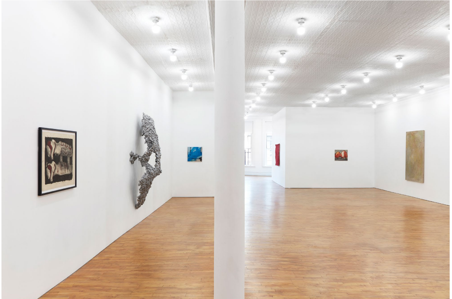
Exhibition view: The Principal Cause of Serial Monogamy 2024 Tara Downs, New York