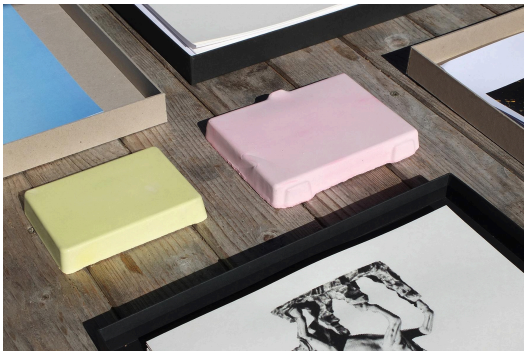
Paul Ahl, Umverpackung 242 , 2024, concrete, 9,5 x 14 x 2,5 cm ( on the left )