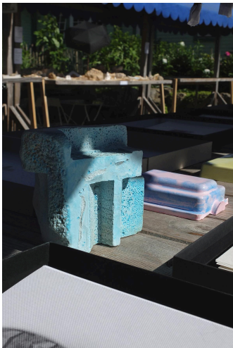
Paul Ahl, Skulptur S , 2023, concrete, 12 x 14 x 6,5 cm