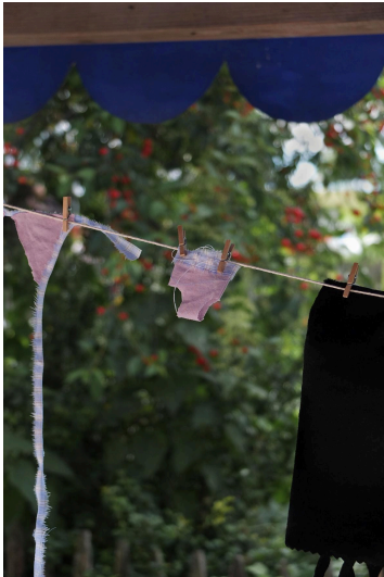
Virginie Sistek, PERSIL Lessive Liquide Ecolabel Naturissime Fraîcheur D'Agrumes , 2024, textile, jute string, wood, glue, dimensions variable (detail)