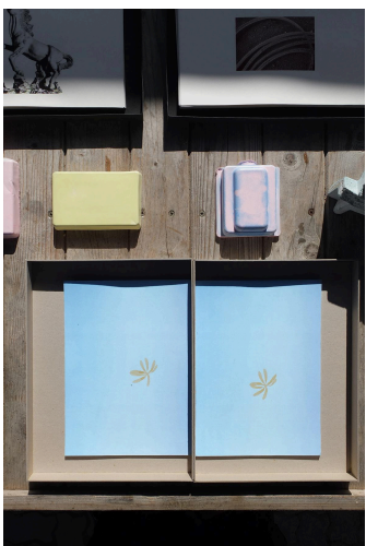
Anas Kahal, untitled , 2024, digital print and screen print on Hahnemühle paper (edition of 10; left and right prints always correspond and constitute a single entity), 29.7 x 21 cm