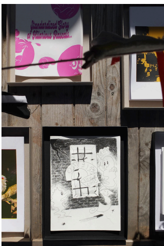
Linus Weber, untitled , 2024, single-color RISO print on Hahnemühle paper (edition of 20), 29,7 x 21 cm