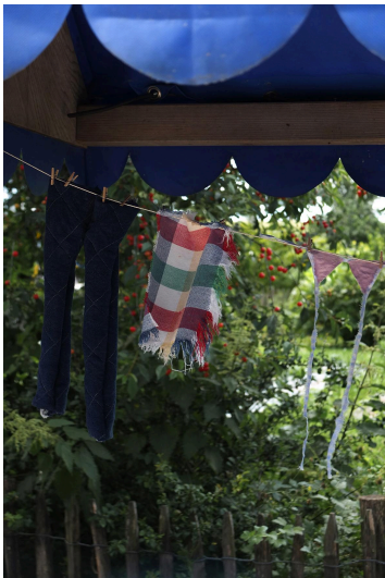
Virginie Sistek, PERSIL Lessive Liquide Ecolabel Naturissime Fraîcheur D'Agrumes , 2024, textile, jute string, wood, glue, dimensions variable (detail)