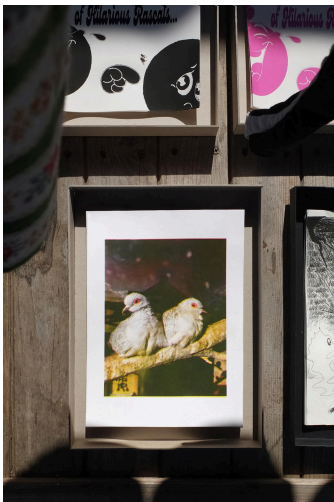
Michael Mönnich, Spectators , 2024, four-color RISO print on Hahnemühle paper (edition of 20), 29,7 x 21 cm