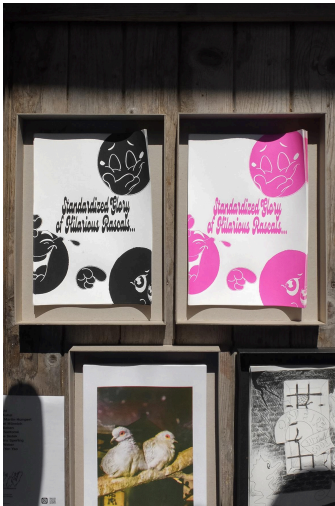
Virginie Sistek, untitled (Standardized Glory of Hilarious Rascals) , 2024, screen print on Hahnemühle paper (edition of 10 for both color variants), 29,7 x 21cm