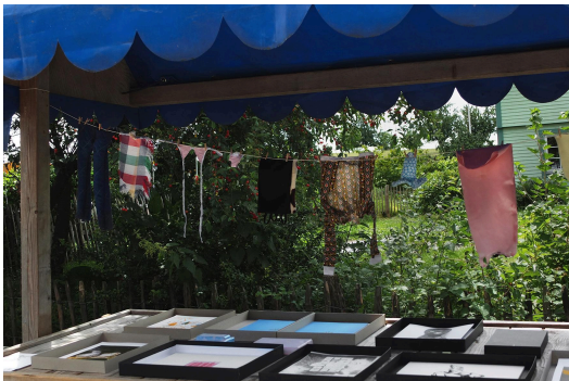
Virginie Sistek, PERSIL Lessive Liquide Ecolabel Naturissime Fraîcheur D'Agrumes , 2024, textile, jute string, wood, glue, dimensions variable