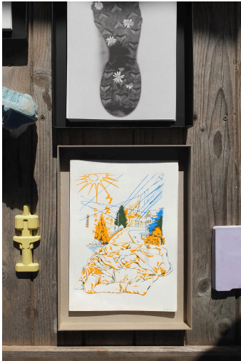
Hsiao-Yen Yao, untitled , 2024, screen print on Hahnemühle paper (edition of 20), 29,7 x 21 cm