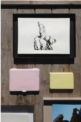
Christina Sperling, untitled , 2024, screen print on Hahnemühle paper (edition of 20), 29,7 x 21 cm