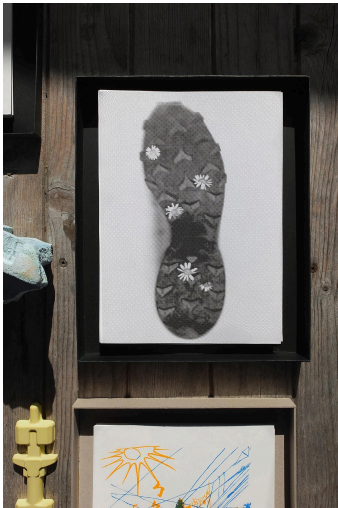
Nina Rieben, untitled (Going to Basel Social Club) , 2024, screen print on Hahnemühle paper (edition of 20), 29,7 x 21 cm