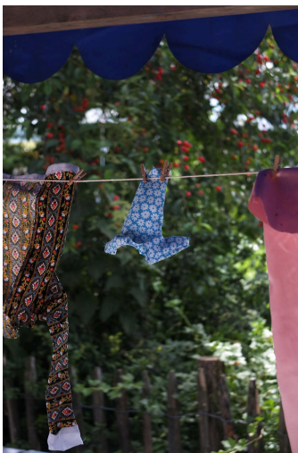
Virginie Sistek, PERSIL Lessive Liquide Ecolabel Naturissime Fraîcheur D'Agrumes , 2024, textile, jute string, wood, glue, dimensions variable (detail)