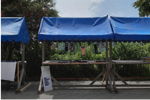
Basel Social Club 2024, Artist Market (installation view)