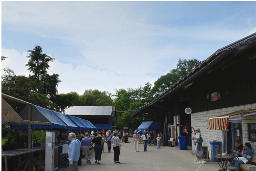
Basel Social Club 2024, Artist Market (installation view)