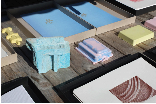
Paul Ahl, Umverpackung 247 , 2024, concrete, 10 x 12 x 3,5 cm ( in the middle )