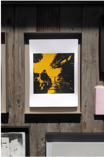
Julius Martin-Humpert, Hannes , 2024, screen print on Hahnemühle paper (edition of 20), 29,7 x 21 cm