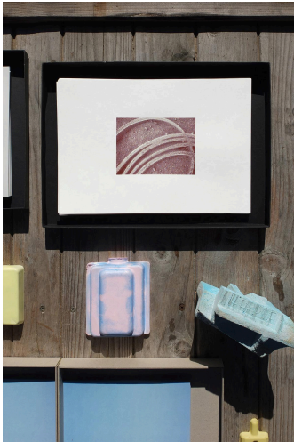
Paul Ahl, untitled , 2024, screen print on Hahnemühle paper (edition of 20), 29,7 x 21 cm