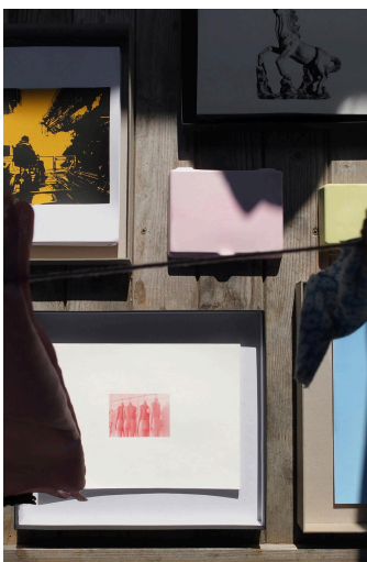
Paula Santomé, untitled , 2024, screen print on Hahnemühle paper (edition of 20), 29,7 x 21 cm