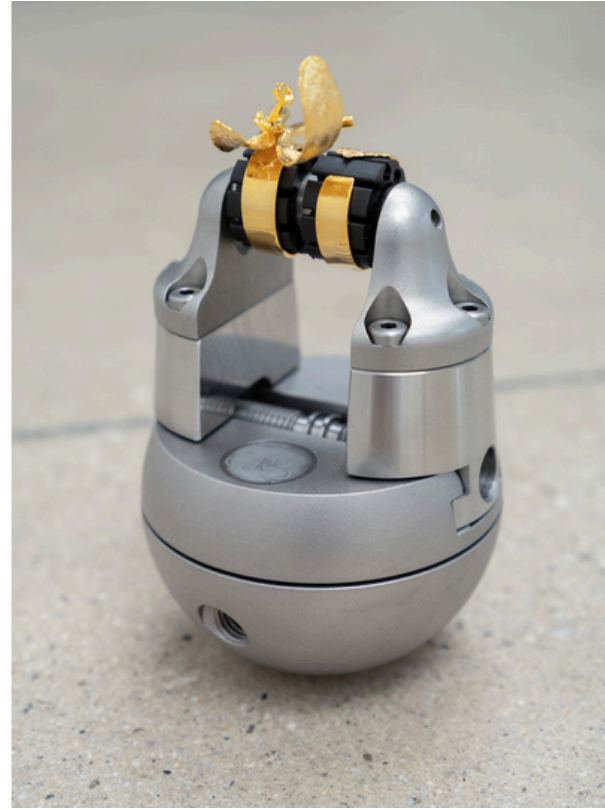
K.R.M. Mooney En V , 2022 Engraving block, polyurethane, cast mistletoe, bronze, silver, solder, gold 7 x 4 1/2 x 4 1/4 inches (17.8 x 11.4 x 10.8 cm)