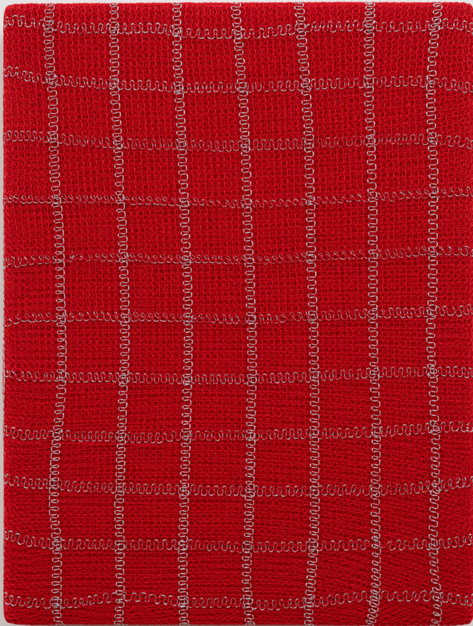
Miguel Bendaña Hell , 2024 Custom machine knit cotton, polyester and metallic thread on panel 16 x 12 x 1 in