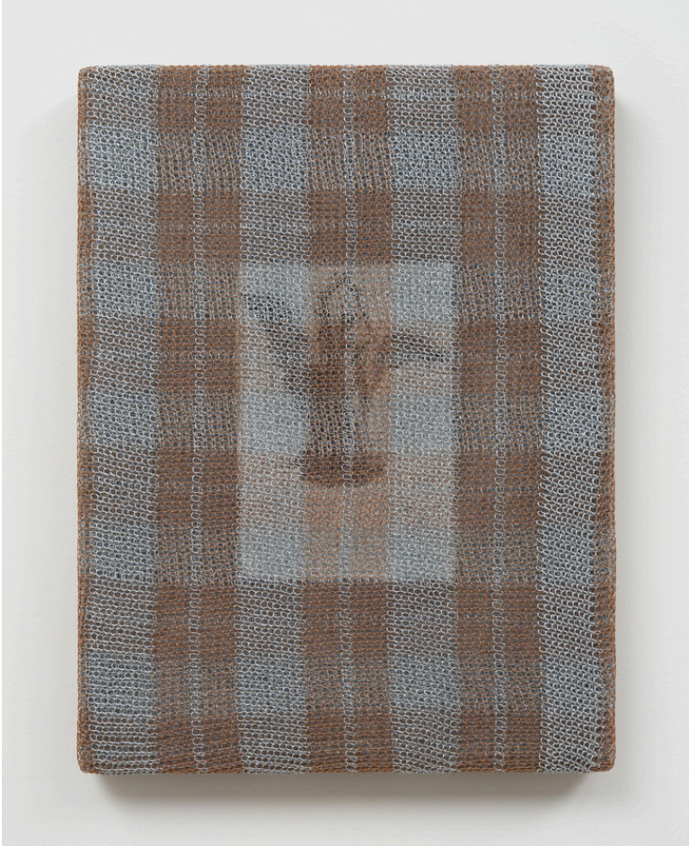
Miguel Bendaña Fortress in Rome , 2024 Custom machine knit polyester and metallic thread, enamel, oil pastel, xerox on panel 16 x 12 x 1 in

Miguel Bendaña (b. 1988, College Station, TX) lives and works in New York. Recent exhibitions include And Now , Dallas (solo, 2022); Lomex , New York; Mercy Pictures , Auckland; Lulu , Mexico City; X Bienal de Nicaragua , Managua.