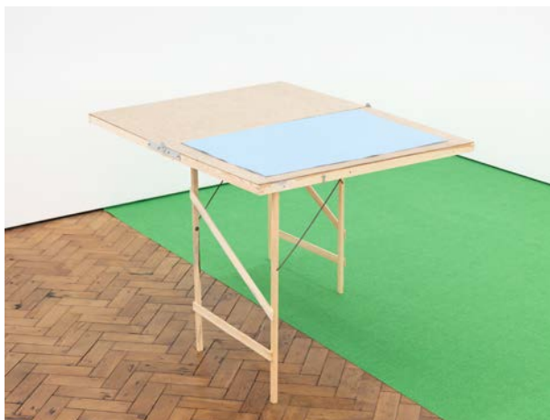
3. Table-book 3 Wallpaper pasting table, blue backed billboard paper, binding thread, archival glue 112 x 89 x 74 open