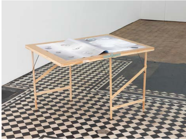
1. Table-book 1 Wallpaper pasting table, blue backed billboard paper, binding thread, archival glue 112 x 89 x 74 open