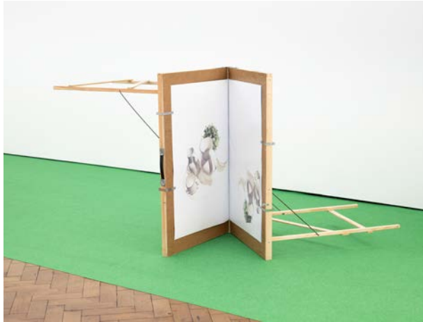
3. Table-book 4 Wallpaper pasting table, blue backed billboard paper, binding thread, archival glue 112 x 89 x 74 open