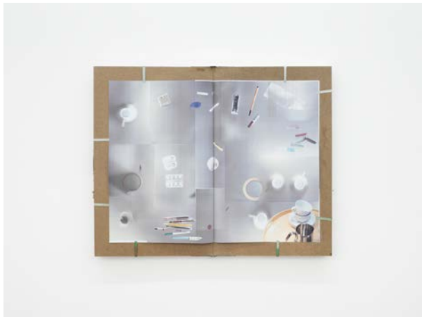
2. Table-book 2 Wallpaper pasting table, blue backed billboard paper binding thread, table cloth clips archival glue 112 x 89 x 74 open