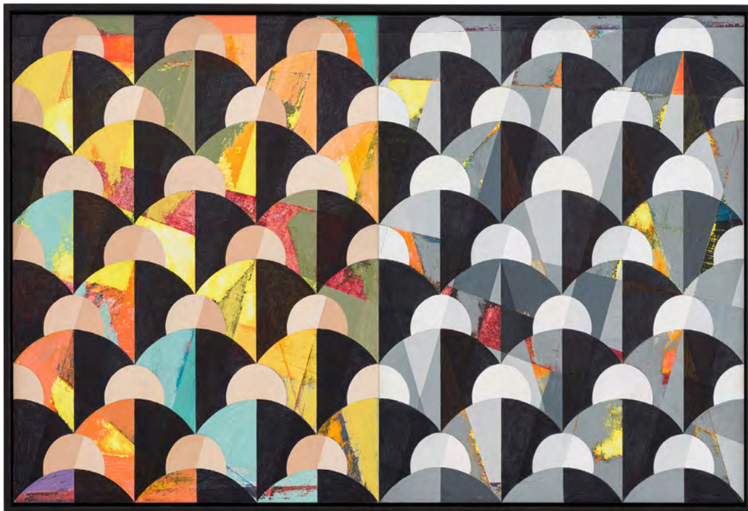
Bernd Ribbeck Untitled, 2022/016

Bernd Ribbeck (DE 1974) lives and works in Berlin. His works have been shown in numerous international exhibitions and are represented in several institutional collections such as Museum of Modern Art New York, Museum Haus Konstruktiv Zurich, Sammlung de Belvedere / 21er Haus Vienna, Städtische Galerie im Lenbachhaus Munich, Kunstpalast Düsseldorf or the Wilhelm-Hack Museum Ludwigshafen. His solo exhibitions at Haus Konstruktiv in Zurich and Wilhelm-Hack Museum Ludwigshafen are accompanied by a comprehensive publication by Distanz Verlag.