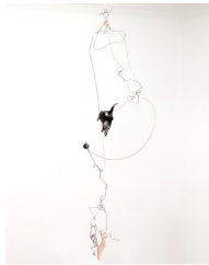
Emily Steinfeld Mahler Grooved-Indent, Lined , 2024 Himalayan sea salt tongue formed bicarbonate building material, flecked rigid charcoal plastic, flattened aluminum wire, steel wire 40 x 15 inches (101.6 x 38.1 cm) 001