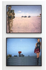
Martha Rosler Afghanistan (?) and Iraq (?) , from the series House Beautiful: Bringing the War Home, New Series , 2008 Photomontage 30 x 39.875 inches (76.2 x 101.3 cm) 001