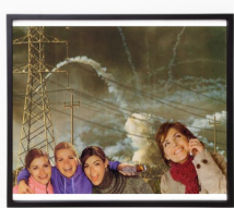
Martha Rosler Cellular , from the series House Beautiful: Bringing the War Home, New Series , 2004 Photomontage 20 x 24 inches (50.8 x 61 cm) 002