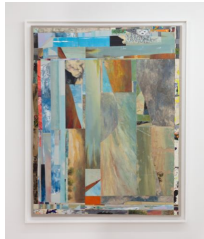
Graham Collins The Working Sky , 2024 Sewn found painting remnants 64 x 52 inches (162.6 x 132.1 cm) GCollins144