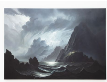
Chino Amobi Uncreated Light , 2023 Oil on canvas 24 x 36 inches (61 x 91.4 cm) 001