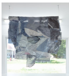
Kelly Jazvac Apron , 2010 Recuperated PVC, thread 74 x 80 inches (188 x 203.2 cm) 001