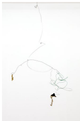
Emily Steinfeld Mahler Prnk Still Even?! (Salad 3) , 2024 French green clay mask hard cure (tempted mold), lettuce carved full thick brass, alpha wire, steel wire 22 x 40 inches (55.9 x 101.6 cm) 002