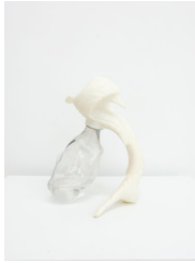
Sissel Tolaas & Misha Kahn Airdrop 01 , 2024 Glass water bottles, liquid, smell molecule Dimensions variable 001