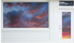
Glen Baldrige Sunset , 2024 Inkjet on perforated vinyl on glass 93.5 x 173 inches (237.5 x 439.4 cm) GB139

When the Sky Changes Tone, I'll Be Absolutely Tender, Curated by R.H. Lossin, 2024