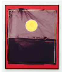
Chris Duncan Strawberry 2 , 2022 Sun, time, thread, paint on fabric 62 x 52 inches (157.5 x 132.1 cm) CDu150