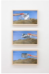
Jaclyn Wright Collected Targets (I, II, III) , 2021 Archival Inkjet Prints 16 x 9 inches (40.6 x 22.9 cm) 001