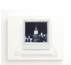
Cynthia Daignault CCTV , 2012 Oil on linen 12 x 16 inches (30.5 x 40.6 cm) 003