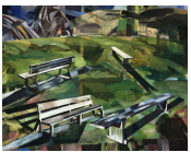
Hope Park, 2024 24 x 30 inches Oil on canvas