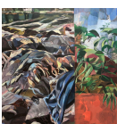
Drift Inn Beach, 2024 29 x 28 inches Oil on panel