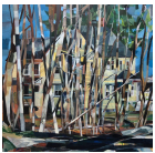
House on Mechanic St., 2024 48 x 48 inches Oil on canvas