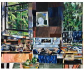
Forever Suspended in a Doorway (Self Portrait), 2024 65 x 80 inches Oil on canvas