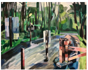
Birch Point Signs, 2024 24 x 30 inches Oil on canvas