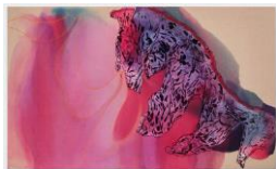
Milena Dragicevic More Like Air Than Land (Frieda), 2024 acrylic and oil on linen 123.4 x 202.8 cm