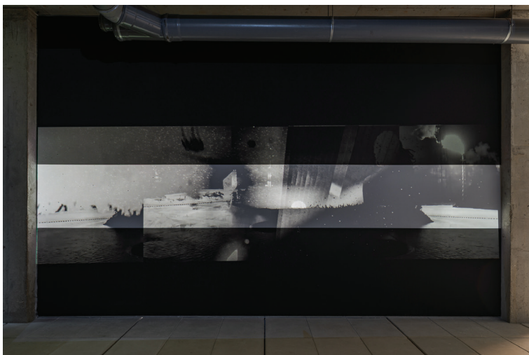
landovka/Tsyrlina, once in a hundred years , 2024 site-specific installation, multiple screens, video, sound once in a hundred years-16.tiff