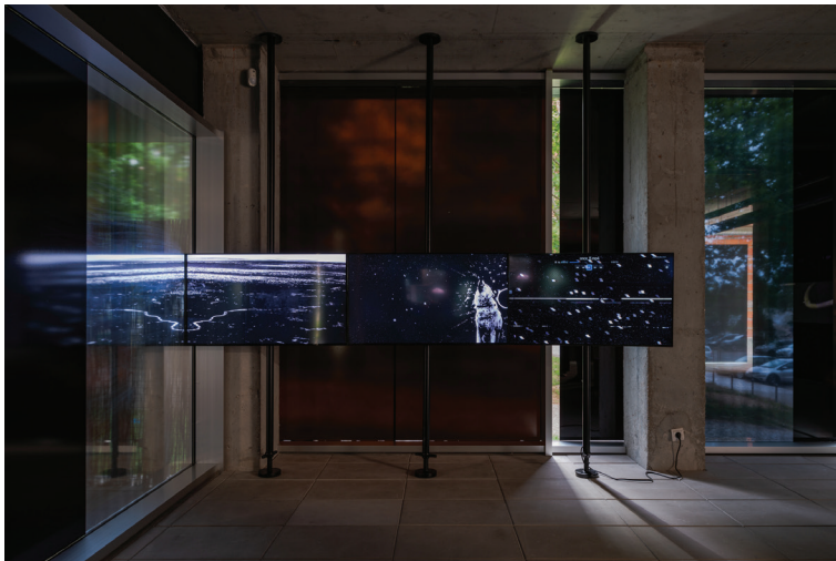
landovka/Tsyrlina, once in a hundred years , 2024 site-specific installation, multiple screens, video, sound once in a hundred years-9.tiff