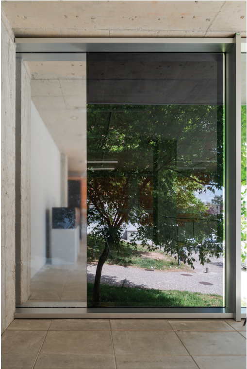
once in a hundred years , installation view, 2024 once in a hundred years-18.tiff