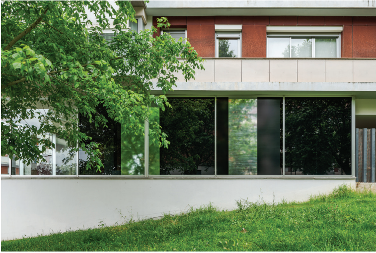
once in a hundred years , installation view, 2024 once in a hundred years-17.tiff