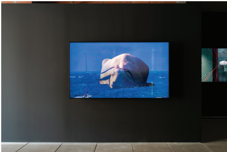
landovka/Tsyrlina, escape goat , 2020 once in a hundred years-15.tiff