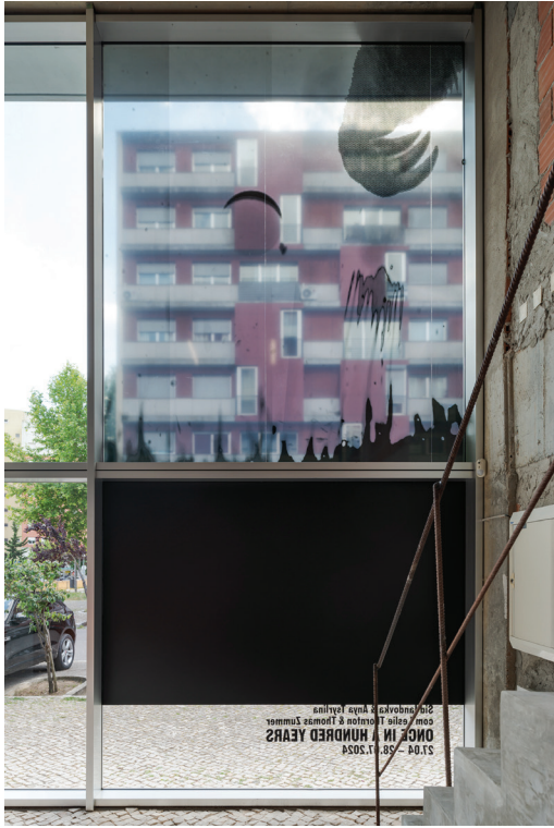
once in a hundred years , installation view, 2024 window mural by landovka/Tsyrlina once in a hundred years-6.tiff