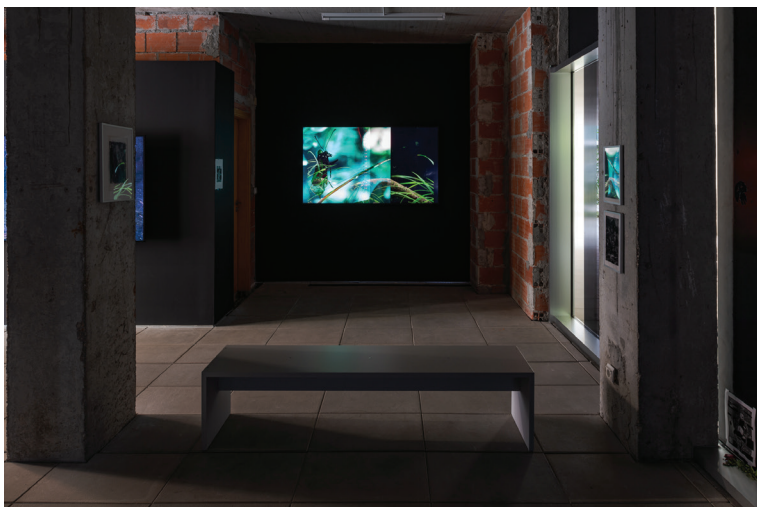
once in a hundred years , installation view, 2024 once in a hundred years-13.tiff