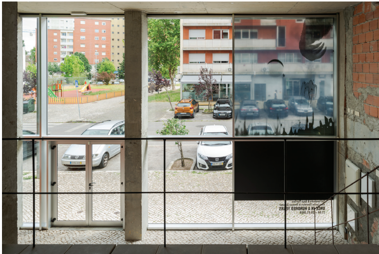
once in a hundred years , installation view, 2024 once in a hundred years-5.tiff