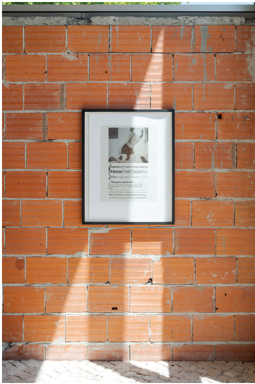
Thomas Zummer, photograph of a drawing of a photograph of a page of a book on Violence and the Brain ("throws guitar against wall"), 2024, monoprint 1/1 plus 1AP once in a hundred years-4.tiff