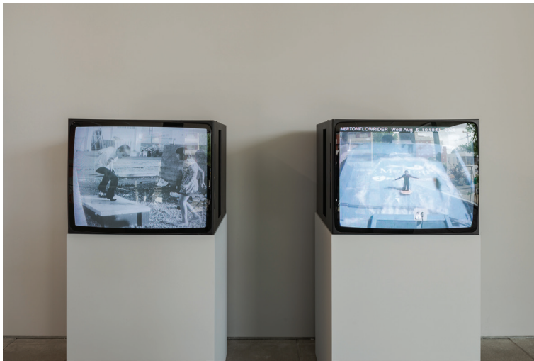
Thornton, landovka/Tsyrlina, beloved/memory , 2024 site-specific installation on CRT monitors, video and 16mm film to video, sound once in a hundred years-8.tiff