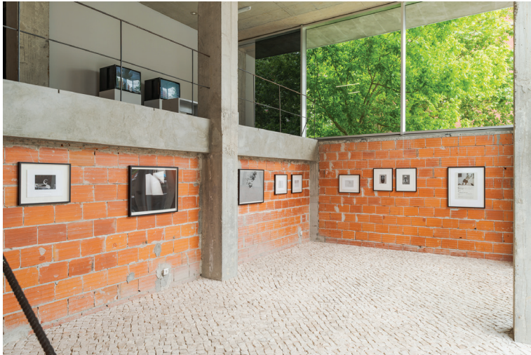
once in a hundred years , installation view, 2024 drawings and monoprints by Thomas Zimmer once in a hundred years-2.tiff