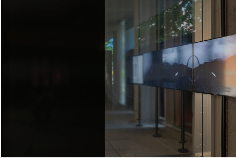
once in a hundred years , installation view, 2024 once in a hundred years-11.tiff