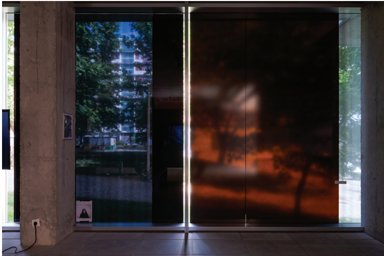
once in a hundred years , installation view, 2024 once in a hundred years-12.tiff