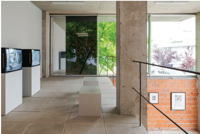
once in a hundred years , installation view, 2024 once in a hundred years-7.tiff