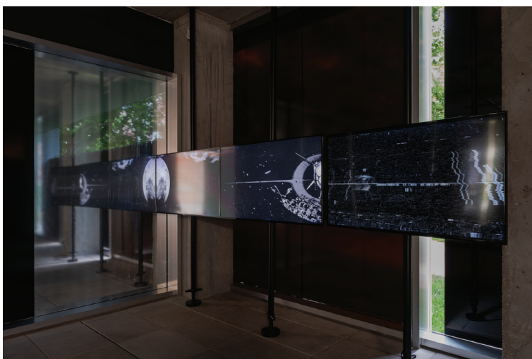
landovka/Tsyrlina, once in a hundred years , 2024 site-specific installation, multiple screens, video, sound once in a hundred years-10.tiff