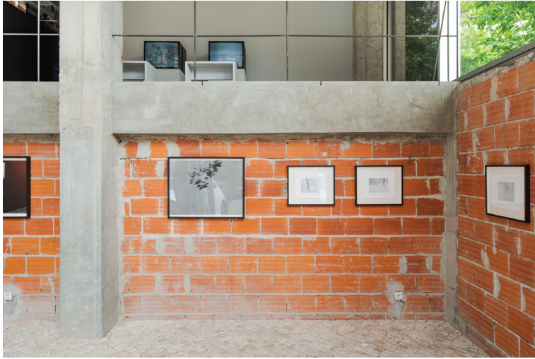
once in a hundred years , installation view, 2024 drawings and monoprints by Thomas Zimmer once in a hundred years-1.tiff