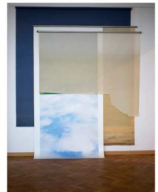
Idylla/installation/180 x 210cm/2016 blinds/wallpaper