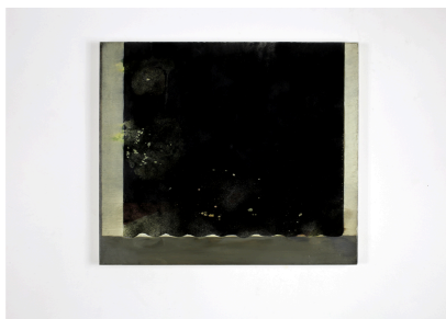
untitled/2015 diplomarbeit an der universität von trieste

It is significant, in this sense, that Kina's first curtains were within depicted frames of sills and stages in the foreground, suggesting a certain depth in the construction of the image -- a visual device often used in modern