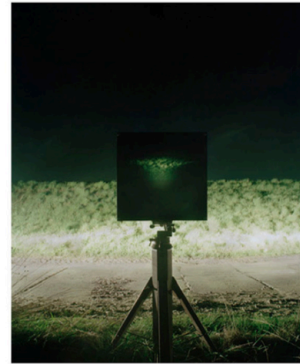
dead eye/2x 174x 120cm + 36/36cm/2015 traditional photography/negative

In this endeavour, the view, the picture, and the eye become central to Kina's quest. Their historical and formal addressing, from linear perspective to photography, almost in a rebours route, that coincided with the development of her artistic practice hand in hand with a gradual drying of means, shifted the attention from the object of the artwork to the viewer's gaze. Kina thus put the emphasis not so much along the lines of an analytical exercise, but rather on a conceptual level that posited the subject and their gaze at the centre of the quest, sliding the discourse from a medium-oriented approach to a broader interrogation of the status and agency of pictures in the present day. [03]