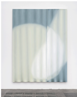
untitled(spotlight series)/ 200 x 100 x 5cm/2020 oil on mildred canvas

In fact, there is a sort of «tangible aporia» at stake in these pieces for they operate a rebound of the gaze: the aporia lays in a seesaw between figuration and abstraction, cancellation and construction, absence and presence of the subject. Such an aporia, which would otherwise prevent the painting from exiting its stylistic impasse, I argue, is ultimately upset by the spotlights Kina casts on the curtains' surfaces, introducing a further device that opens new possibilities in her work as well as a new strain of production ( Spotlight Series , 2020). [08]