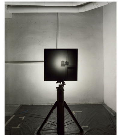
dead eye/36x 36cm/2015 traditional photography

In this endeavour, the view, the picture, and the eye become central to Kina's quest. Their historical and formal addressing, from linear perspective to photography, almost in a rebours route, that coincided with the development of her artistic practice hand in hand with a gradual drying of means, shifted the attention from the object of the artwork to the viewer's gaze. Kina thus put the emphasis not so much along the lines of an analytical exercise, but rather on a conceptual level that posited the subject and their gaze at the centre of the quest, sliding the discourse from a medium-oriented approach to a broader interrogation of the status and agency of pictures in the present day. [03]