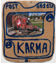
Thomas Hirschhorn Post (KARMA 1), 2024 Cardboard, print and felt pencil 28 x 24 cm