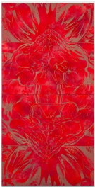
Mitchell Anderson Answered Prayers , 2024 Gouache and security pigments on raw canvas 140 x 70 cm (in two parts)