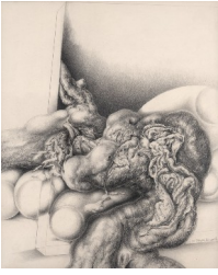
Sibylle Ruppert Untitled , 1971 pencil on paper 42 x 34 cm