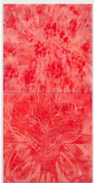
Mitchell Anderson Answered Prayers , 2024 Gouache and security pigments on raw canvas 140 x 70 cm (in two parts)