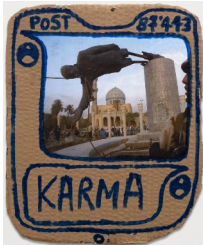
Thomas Hirschhorn Post (KARMA 2), 2024 Cardboard, print and felt pencil 33 x 27 cm