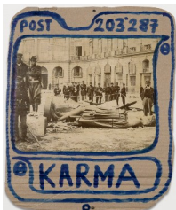
Thomas Hirschhorn Post (KARMA 3), 2024 Cardboard, print and felt pencil 32 x 27 cm