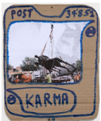
Thomas Hirschhorn Post (KARMA 4), 2024 Cardboard, print and felt pencil 30 x 24 cm