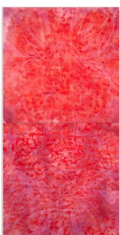
Mitchell Anderson Answered Prayers , 2024 Gouache and security pigments on raw canvas 140 x 70 cm (in two parts)