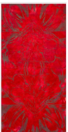
Mitchell Anderson Answered Prayers , 2024 Gouache and security pigments on raw canvas 140 x 70 cm (in two parts)