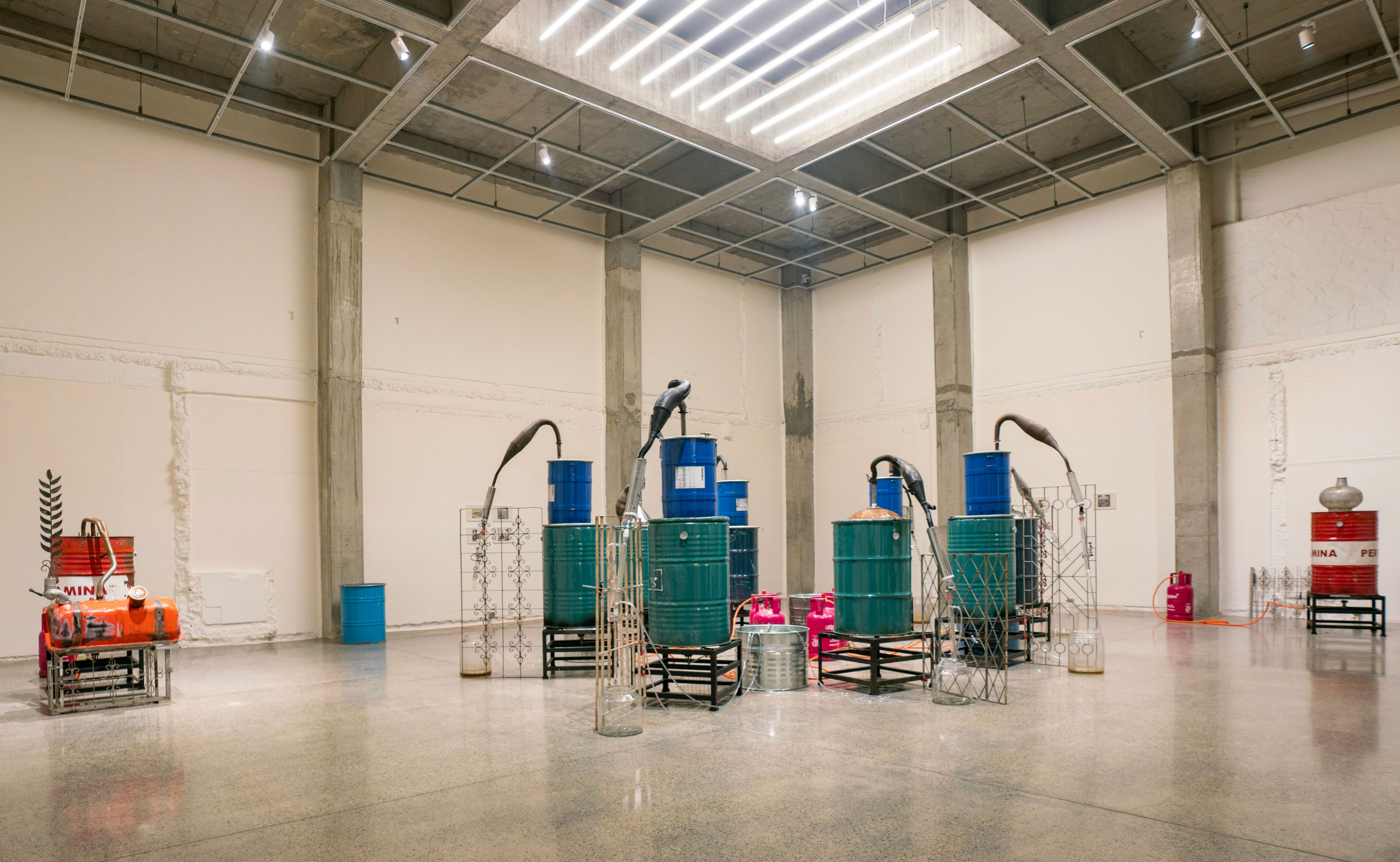
Santalum Album Family 2024 Oil barrel, gas, stove, trellis, hose, motorbike pipe exhaust, sandalwood, gas tank, fuso truck Variable dimensions