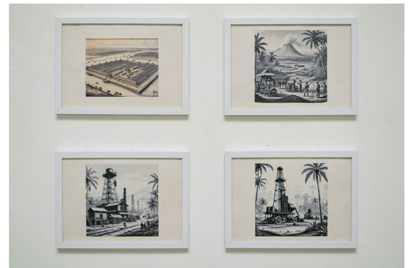
Lexicon of a Lexicon of Foreign Artists Who Visualize Indonesia 2024 - ongoing 23 set of AI generated drawings printed on book paper Variable dimensions