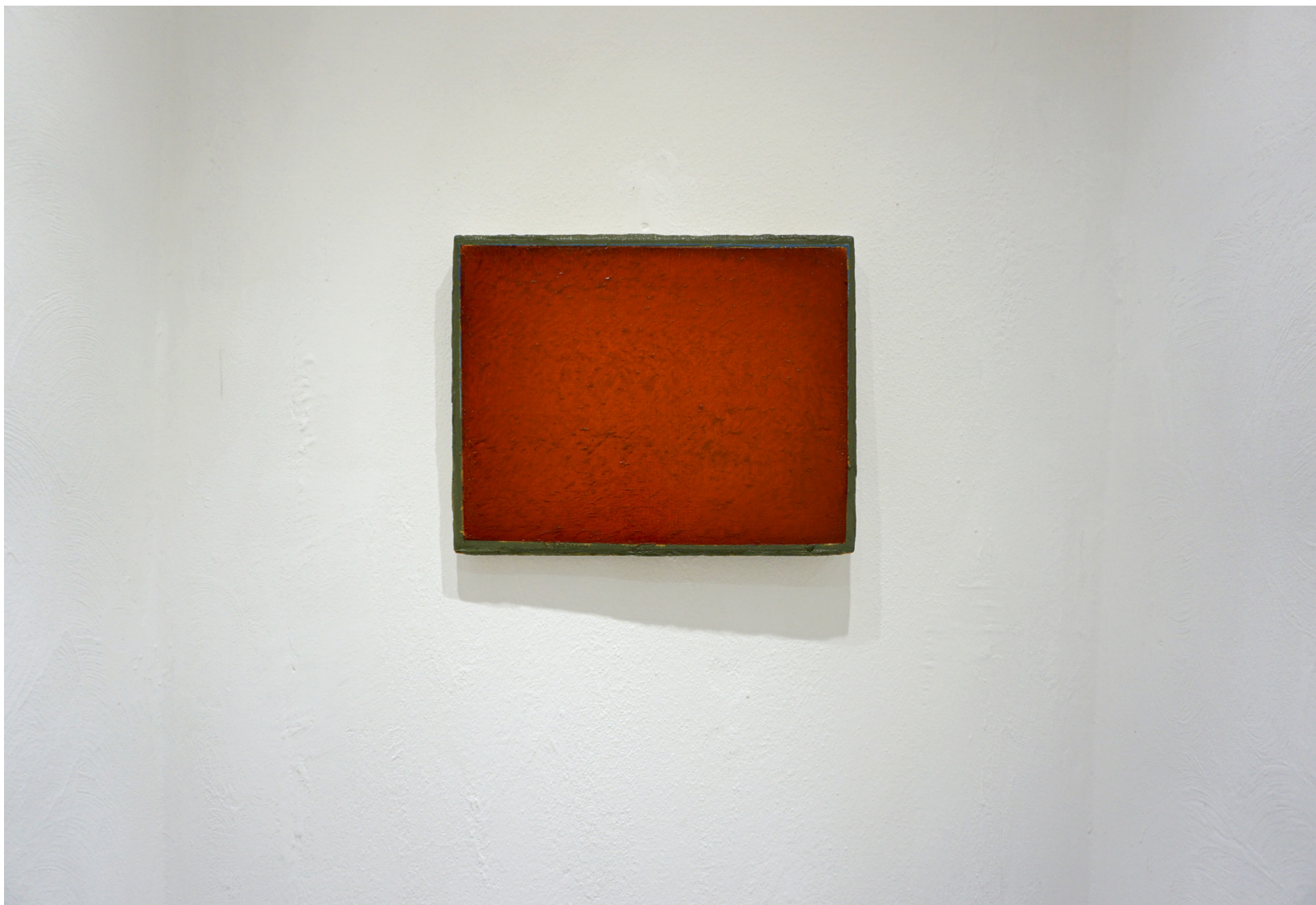
Charlie De Voet, Missing Monochrome XVII , 2024 Oil on canvas 30 x 40 cm