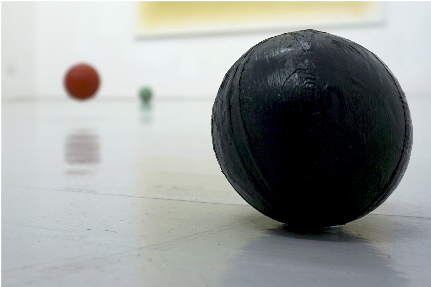
Charlie De Voet Snapshot Painting For Spaces , 2024 (detail) Oil on Styrofoam Ø 8 cm (each)