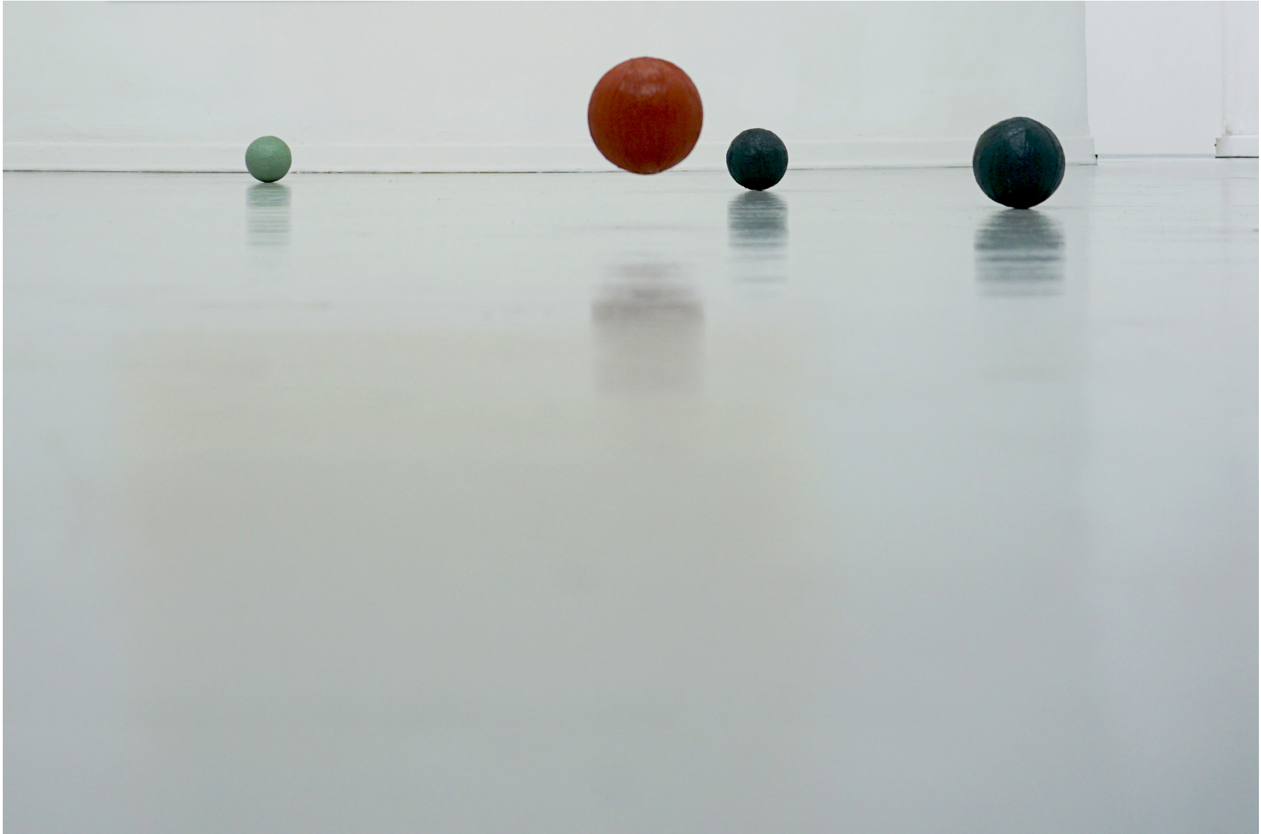
Charlie De Voet Snapshot Painting For Spaces , 2024 Oil on Styrofoam Ø 8 cm (each)