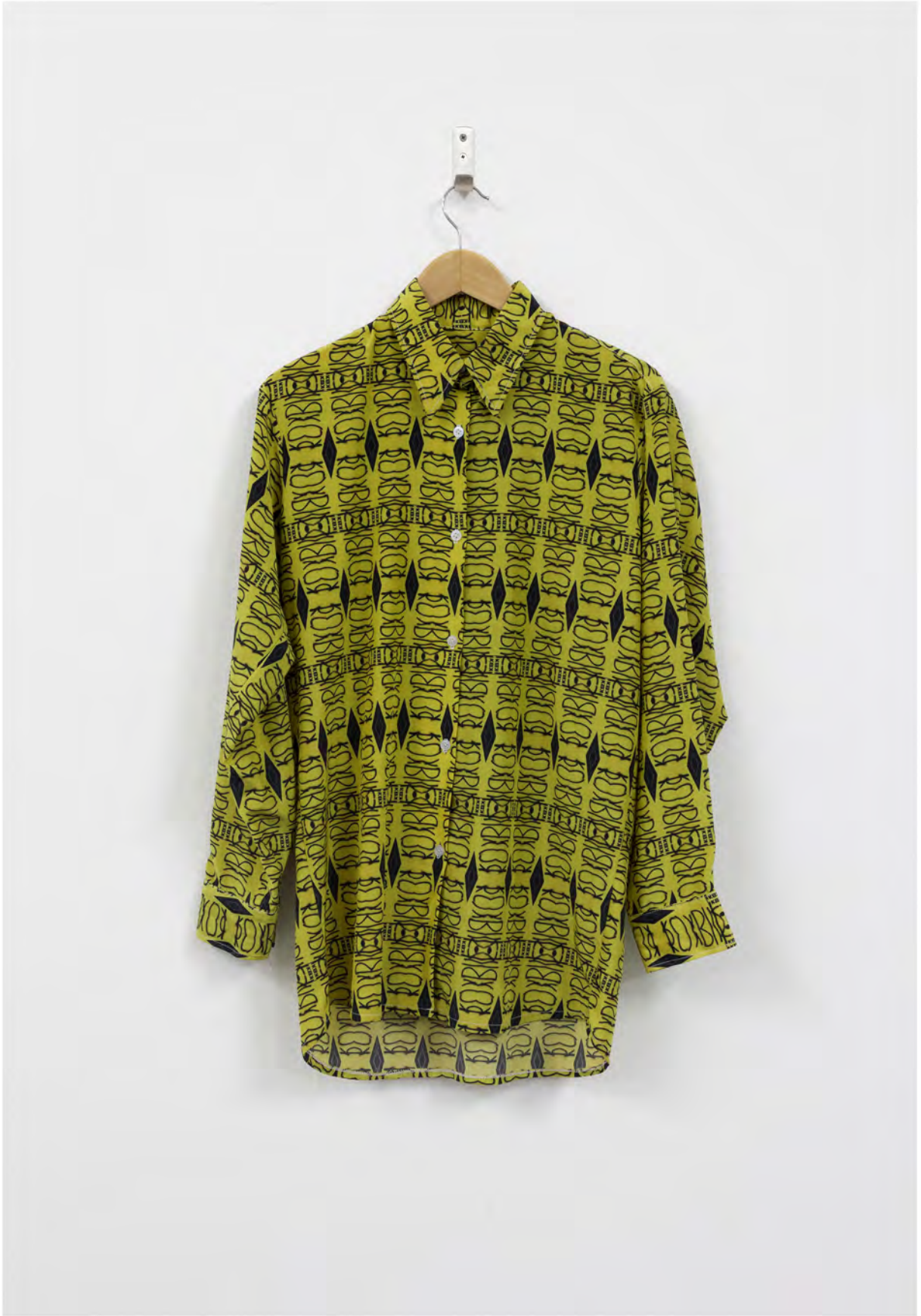
Istanbul - digitally printed silk cotton, wood, stainless steel - 90 x 49 x 1cm (2014)