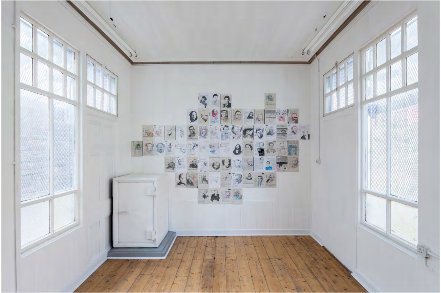
You're Studying that Reality... We'll Act Again - Queens Park Railway Club (2014) (1)