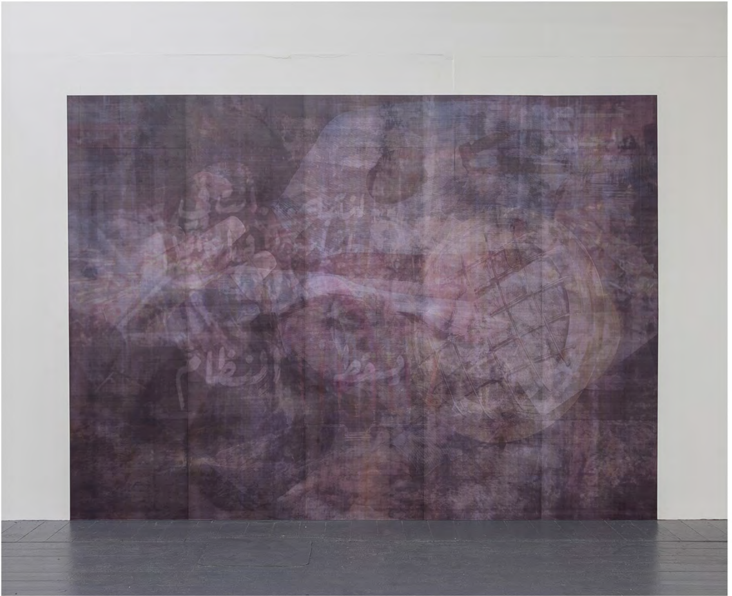
The Fate of Empires - Billboard - 280 x 380cm (2014)