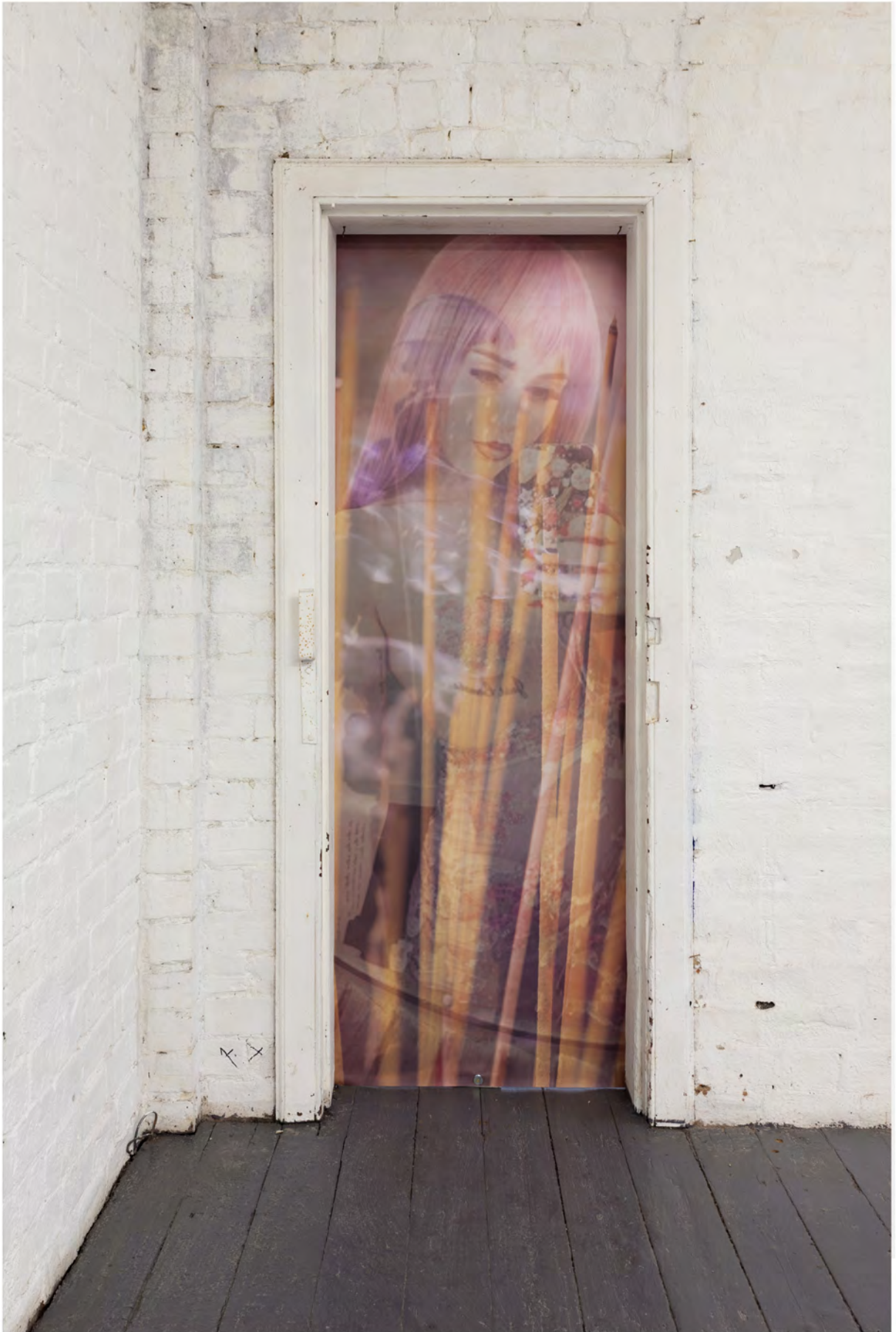
Hashtag - digitally printed pvc building wrap - 90 x 230cm (2014)