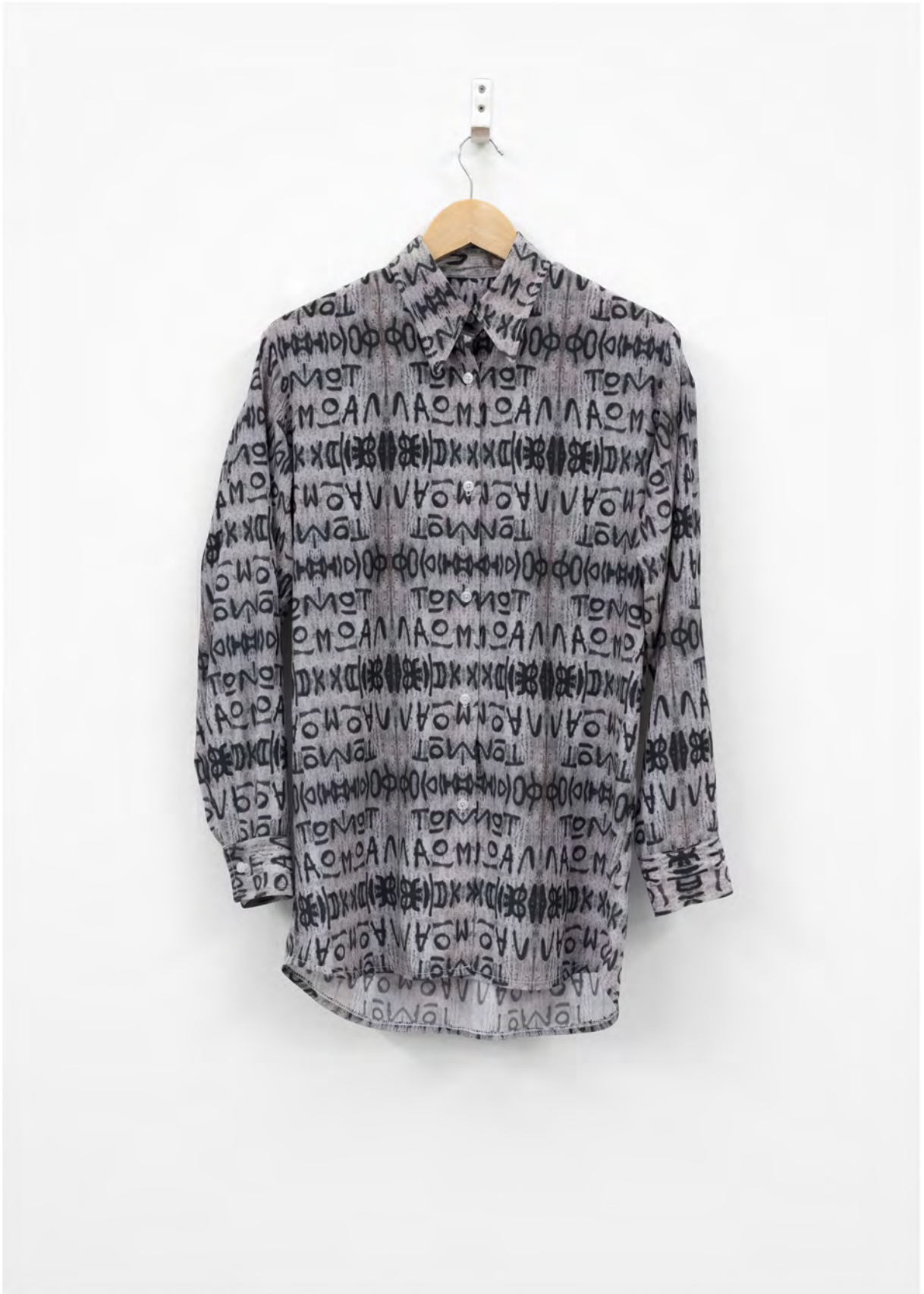
Athens - digitally printed silk cotton, wood, stainless steel - 90 x 49 x 1cm (2014)