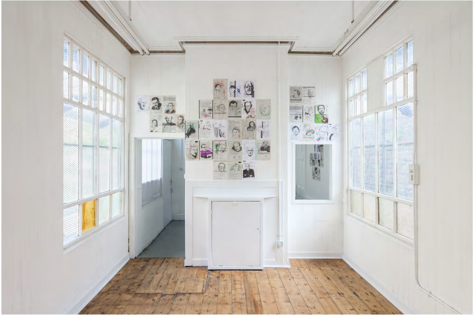
You're Studying that Reality... We'll Act Again - Queens Park Railway Club (2014) (2)