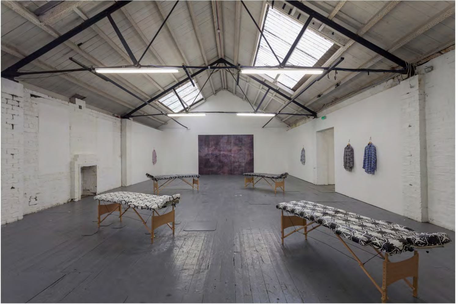
This Image License Has Expired - The Glue Factory (2014)