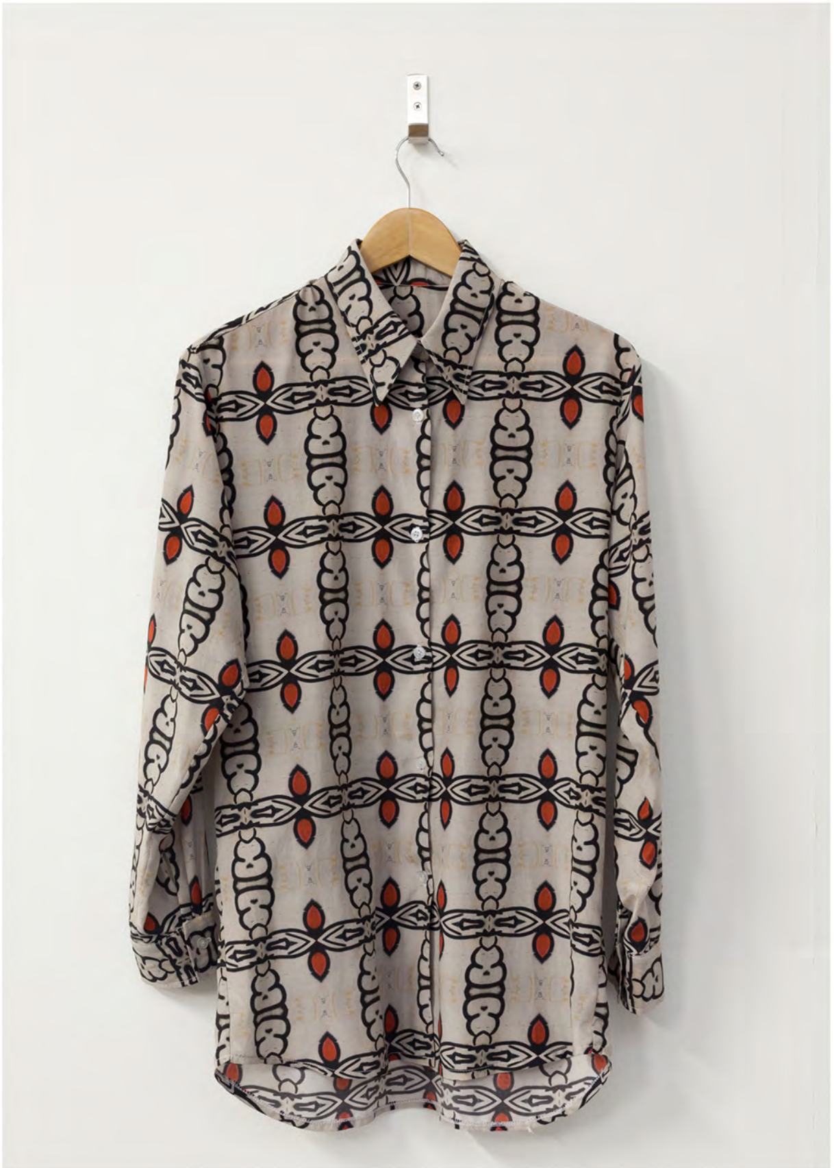
Tripoli - digitally printed silk cotton, wood, stainless steel - 90 x 49 x 1 cm (2014)