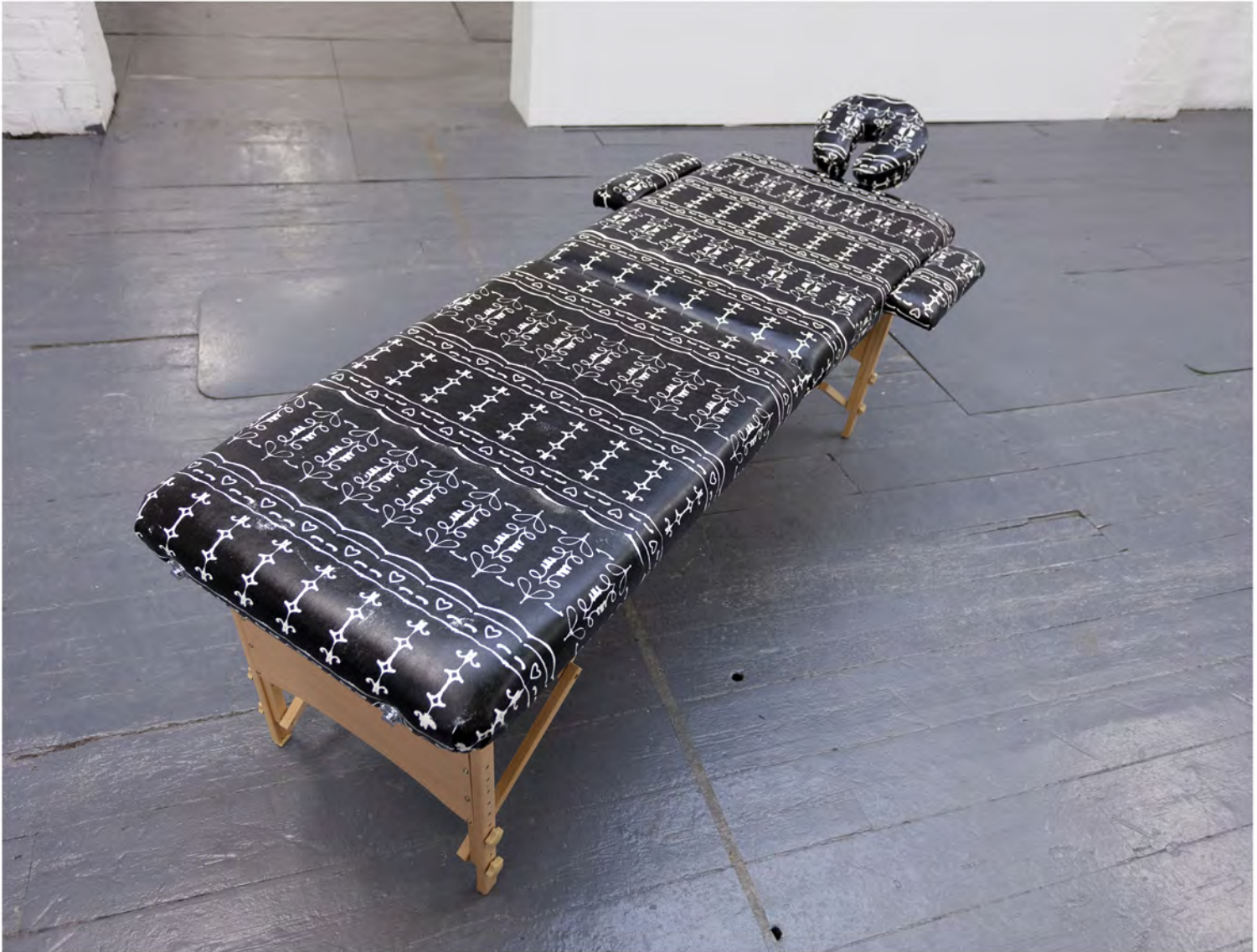
Nato chief defends eastern advance - silkscreened leatherette on massage table - 185 x 60 x 87cm (2014)