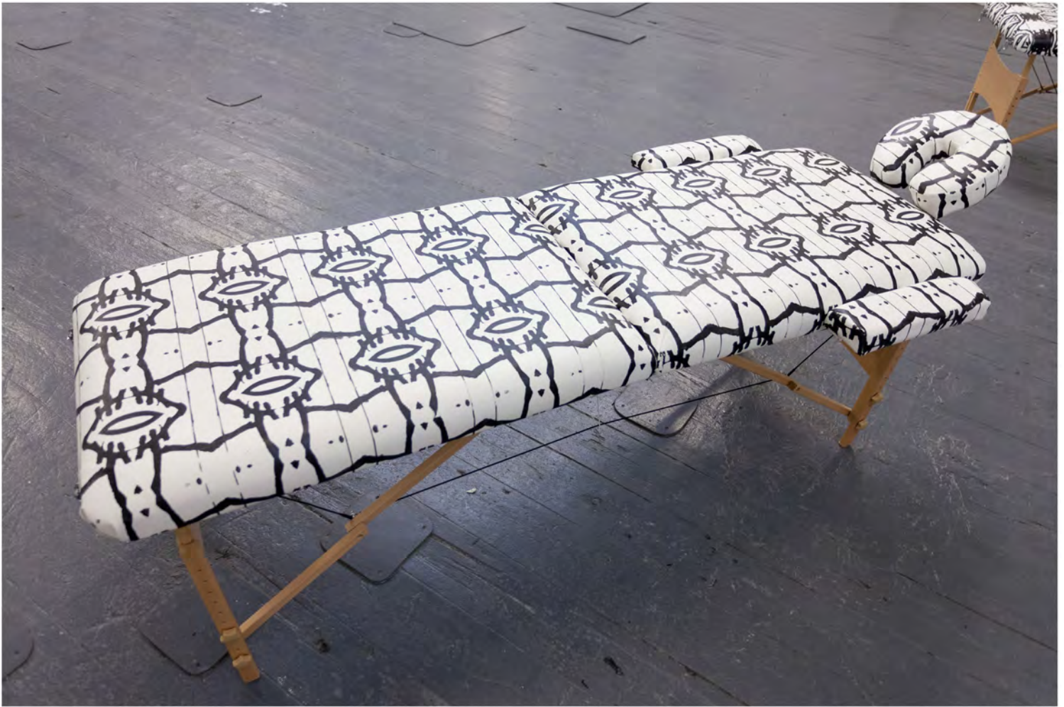
Stay-at-home dads helping mums fly high - silkscreened leatherette on massage table - 185 x 60 x 87cm (2014)