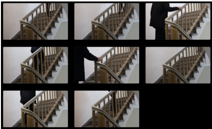
Carla Åhlander Ascending a Staircase, 2024 Giclée prints on Canson Baryta Prestige II 340g series of seven colour photos 20 x 30 cm each ed. 1/2 + 1AP AHL/24/0002