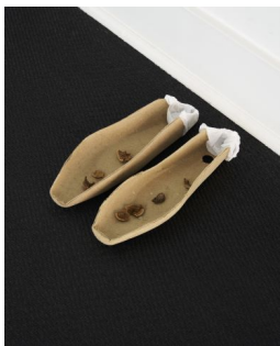
Aaron Amar Bhamra conscious comfort, 2024 cardboard, paper, walnut shells from ( occasions, 2023 ) 5 x 9 x 27 cm (each) unique BHA/24/0002