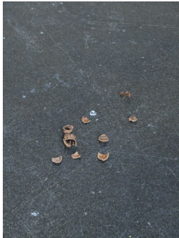
Aaron Amar Bhamra occasions, 2023 walnut shells, space various dimensions unique BHA/24/0001