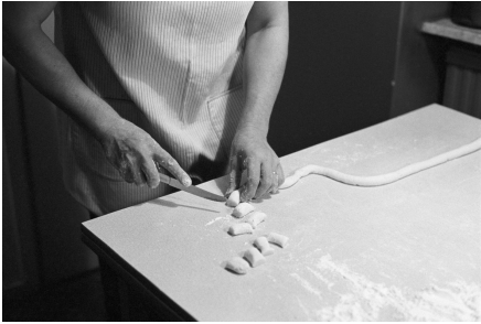
Carla Åhlander Construction of a Memory, 2024 Giclée print of a scanned 35 mm negative on Canson Baryta Prestige II 340g 40 x 60 cm ed. 1/2 + 1AP AHL/24/0001