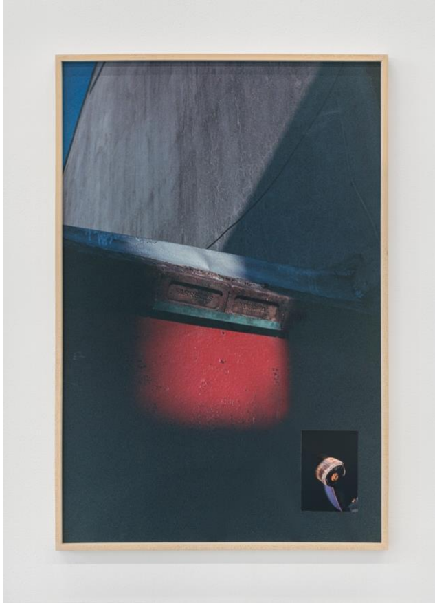
Kiss of the Sun, 2024 77 x 51.8 cm