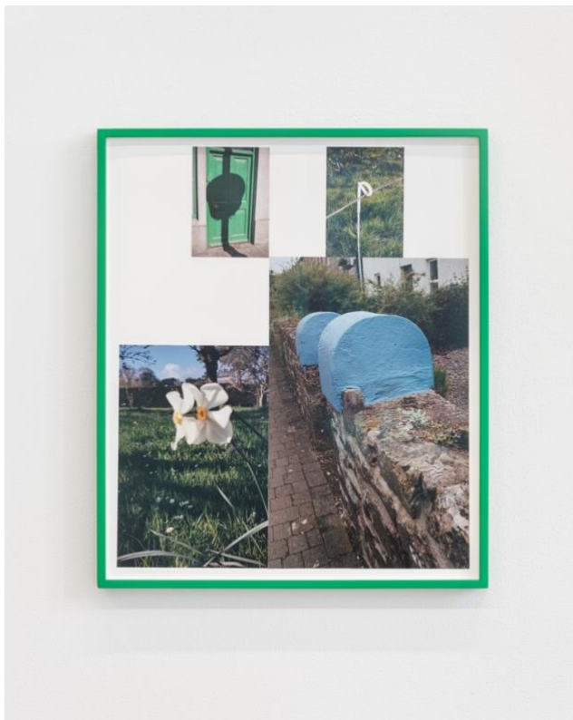
Sunny Spell , 2024 52.5 x 44.5 cm