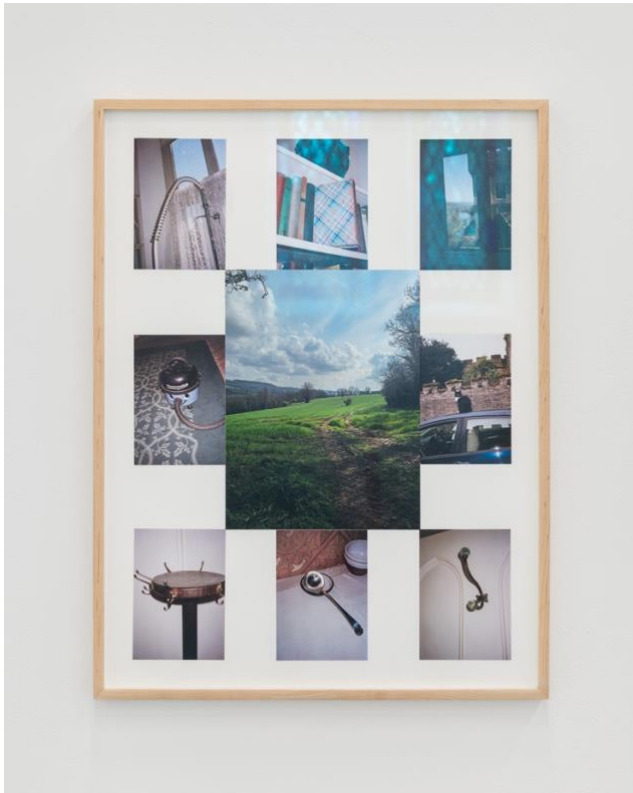
Don't Push The River (It Flows By Itself), 2024 57.6 x 43.7 cm

All works courtesy the artist and Canada New York