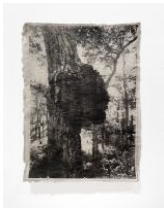
Erin Woodbrey Time Being (Burl) , 2020 Unique gum transfer on handmade paper Unframed: 43 x 30.5 cm | 17 x 12 in Framed: 52 x 39.5 cm | 20 1/2 x 15 1/2 in EKW_136