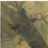
Anna Ruth Meadow, 2024 Acrylic on canvas 35 x 35 cm | 14 x 14 in AR_002