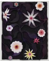
Josh Dihle Virtuous Pagans II, 2022 Colored pencil and casein on wood 46 x 35.5 x 4 cm | 18 x 14 x 1.5 in JOD_004