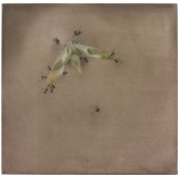
Anna Ruth The Last Moth, 2024 Acrylic on canvas 35 x 35 cm | 14 x 14 in AR_001