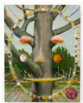
Josh Dihle Mr. Sun, 2024 Acrylic and oil on linen over panel 46 x 35.5 x 4 cm | 18 x 14 x 1.5 in JOD_001