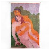
Juan Arango Palacios Socorro , 2024 Cotton plain weave, inlay 178 x 109 cm | 70 x 43 in JAP_054