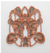
Wen Liu Inarticulate Trace No.4, 2024 Prescribed herbal medicine, epoxy clay, resin, paint, UV resistant varnish 110 x 101.5 x 4 cm | 43 x 40 x 1.5 in WL_001