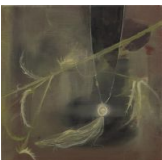
Anna Ruth Tassel, 2024 Acrylic on canvas 35 x 35 cm | 14 x 14 in AR_003