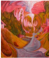
Alex McAdoo Australian Garden and Acacia Place, 2024 Oil on linen 183 x 152.5 cm | 72 x 60 in AMC_002