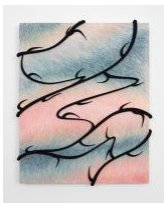
Anastasia Komar Plexus, 2023 Acrylic and pigmented polymer on board 51 x 41 x 5 cm | 20 x 16 x 2 in ANK_001