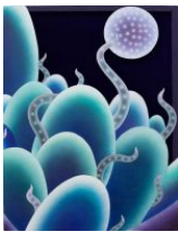
Mevlana Lipp Longing , 2024 Wood, velvet, sand, acrylic, ink, aluminum stretcher 40 x 45 cm | 23 1/2 x 18 in ML_001