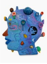
Josh Dihle Blue Head, 2023 Fossil, amber, shell, colored pencil, and casein on carved walnut 11.5 x 10 x 4 cm | 4 1/2 x 4 x 1 1/2 in JOD_002