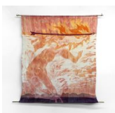
Juan Arango Palacios Ángel Caído , 2024 Cotton plain weave, inlay 127 x 109 cm | 50 x 43 in JAP_055