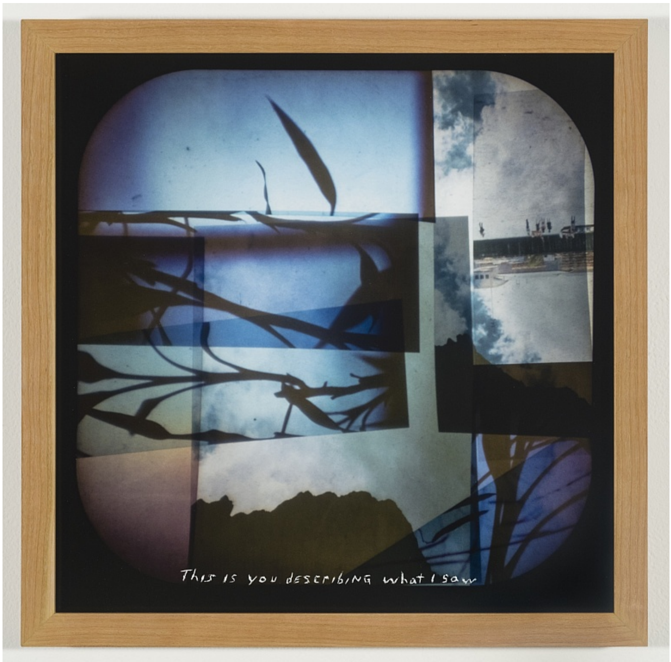
Sky Hopinka This is you describing what I saw , 2019 Inkjet print, etching 13h x 13w in 33.02h x 33.02w cm Edition 1 of 3, 2 APs $ 2,000.00

The Green Gallery 1500 N Farwell Ave Milwaukee, WI 53202