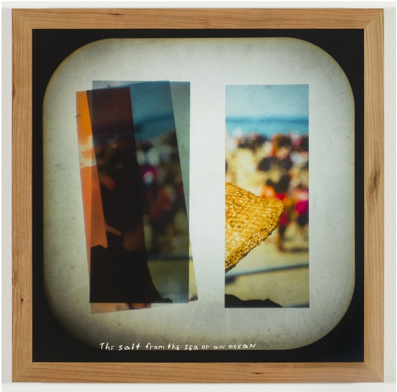
Sky Hopinka The salt from the sea or an ocean , 2019 Inkjet print, etching 13h x 13w in 33.02h x 33.02w cm Edition 1 of 3, 2 APs $ 2,000.00

The Green Gallery 1500 N Farwell Ave Milwaukee, WI 53202