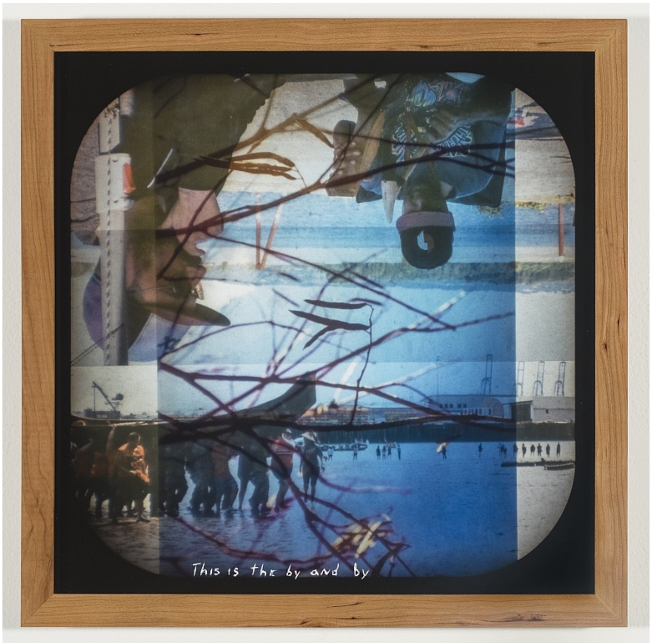
Sky Hopinka This is the by and by , 2019 Inkjet print, etching 13h x 13w in 33.02h x 33.02w cm Edition 1 of 3, 2 APs $ 2,000.00

The Green Gallery 1500 N Farwell Ave Milwaukee, WI 53202