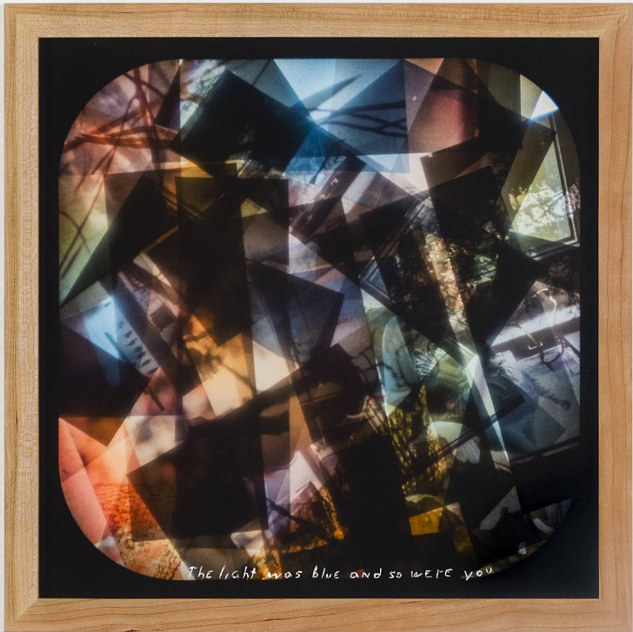
Sky Hopinka The light was blue and so were you , 2019 Inkjet print, etching 13h x 13w in 33.02h x 33.02w cm Edition 1 of 3, 2 APs $ 2,000.00

The Green Gallery 1500 N Farwell Ave Milwaukee, WI 53202