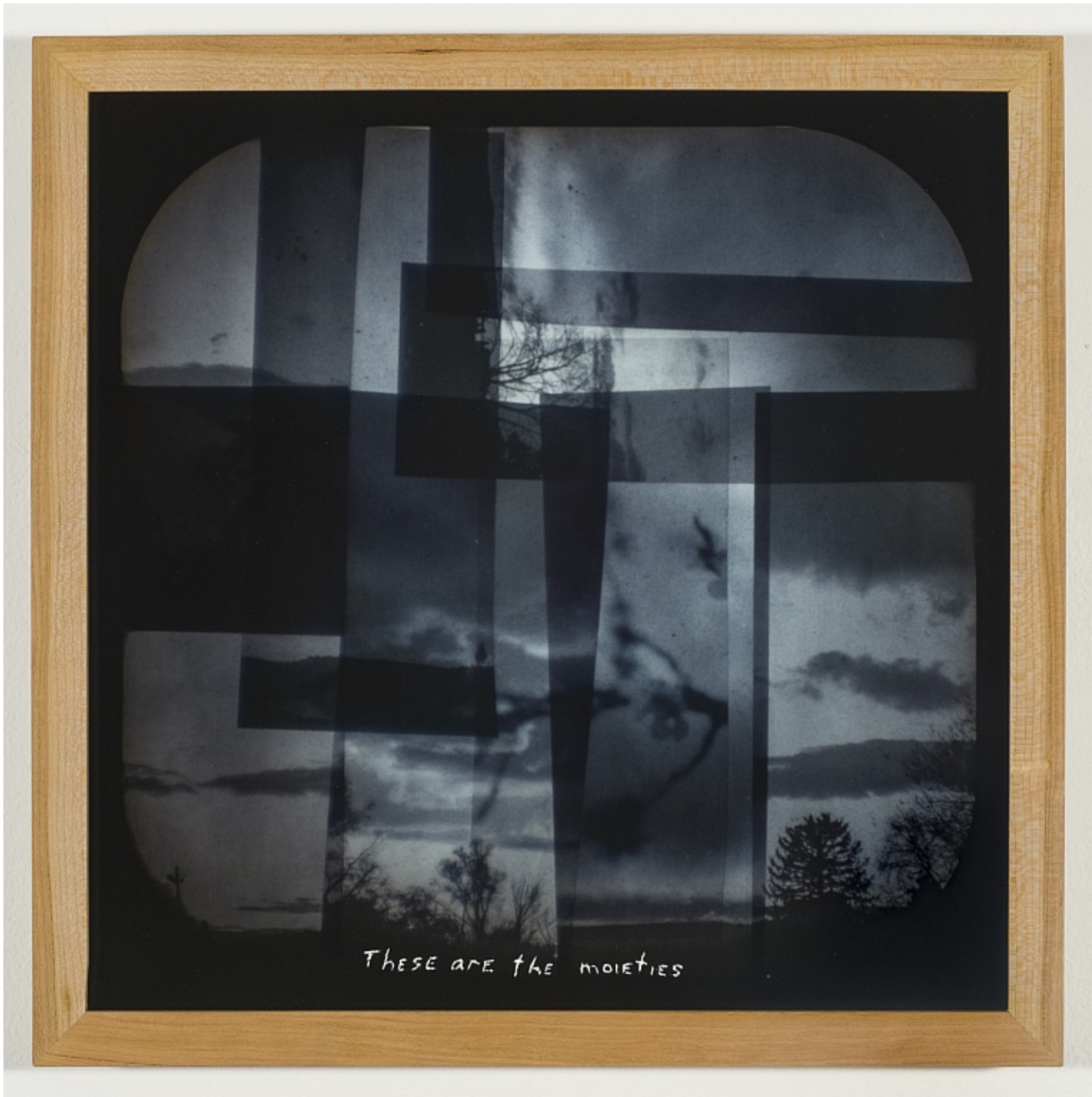
Sky Hopinka These are the moieties , 2019 Inkjet print, etching 13h x 13w in 33.02h x 33.02w cm Edition 1 of 3, 2 APs $ 2,000.00

The Green Gallery 1500 N Farwell Ave Milwaukee, WI 53202