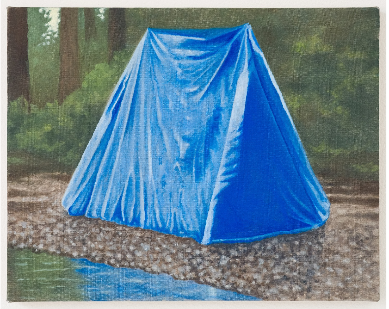
Dana Powell Tarp tent , 2021 Oil on linen 12h x 14w in 30.48h x 35.56w cm DP-21-01 XXXXXX

The Green Gallery 1500 N Farwell Ave Milwaukee, WI 53202