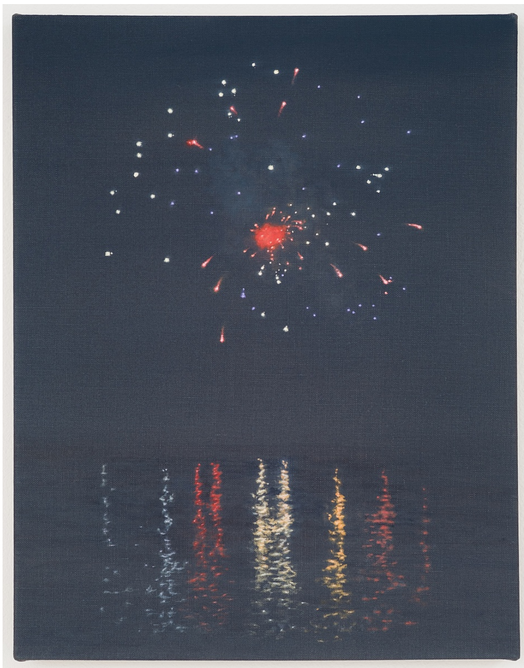
Dana Powell Glitter , 2021 Oil on linen 11h x 14w in 27.94h x 35.56w cm DP-21-02

The Green Gallery 1500 N Farwell Ave Milwaukee, WI 53202