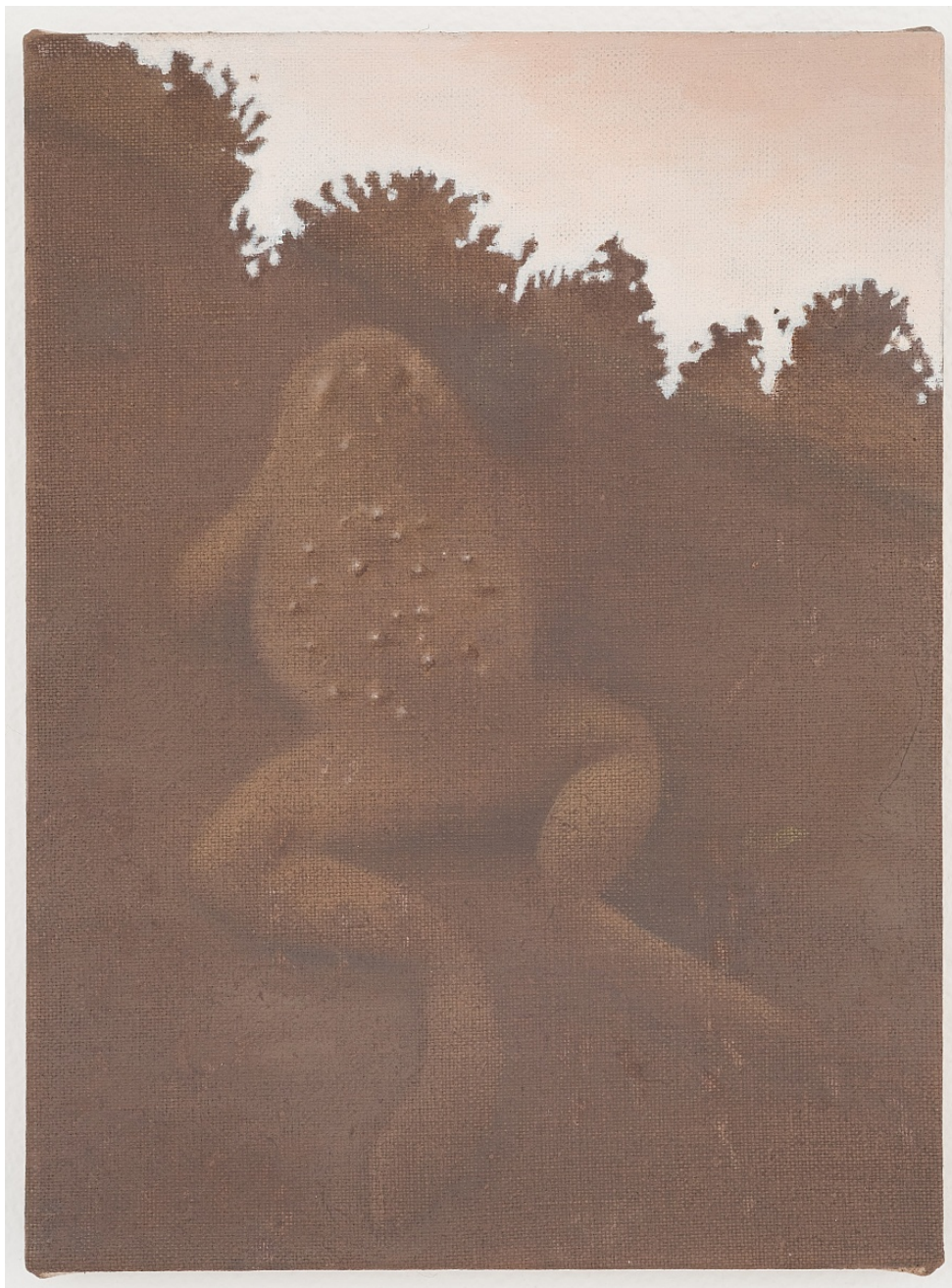
Dana Powell Brown frog , 2021 Oil on linen 8h x 6w in 20.32h x 15.24w cm DP-21-04

The Green Gallery 1500 N Farwell Ave Milwaukee, WI 53202