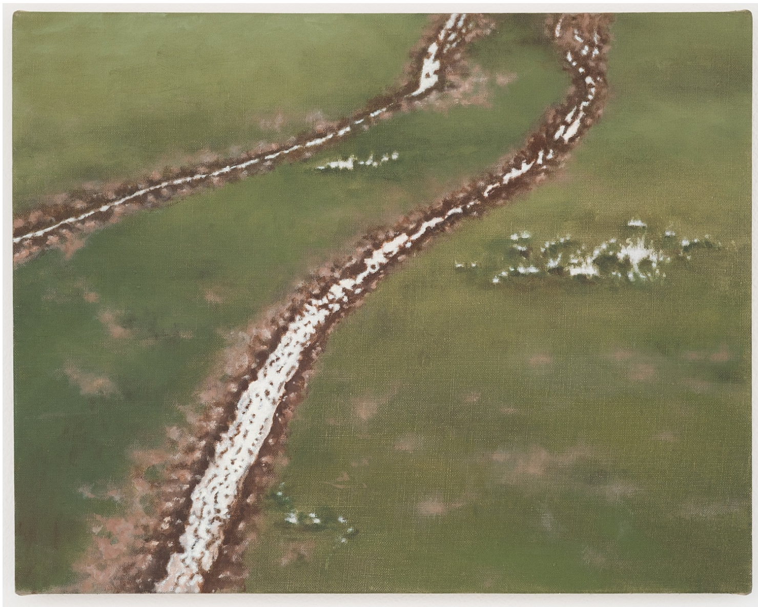
Dana Powell Tracks , 2021 Oil on linen 11h x 14w in 27.94h x 35.56w cm DP-21-03

The Green Gallery 1500 N Farwell Ave Milwaukee, WI 53202