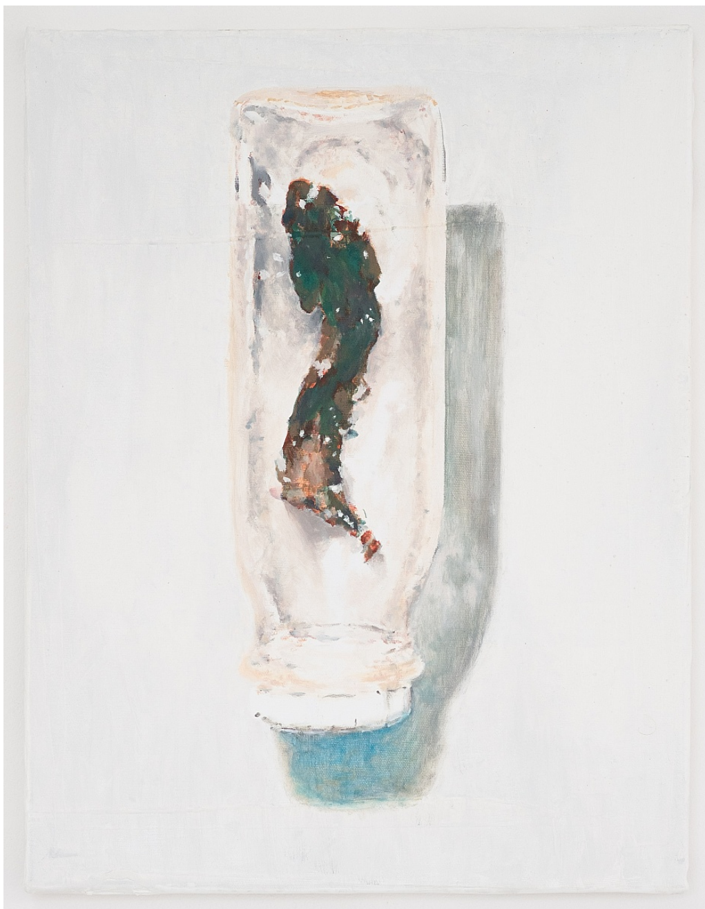
John Garcia Breadwinners , 2021 Oil on canvas 18h x 14w in 45.72h x 35.56w cm JG-21-01

The Green Gallery 1500 N Farwell Ave Milwaukee, WI 53202