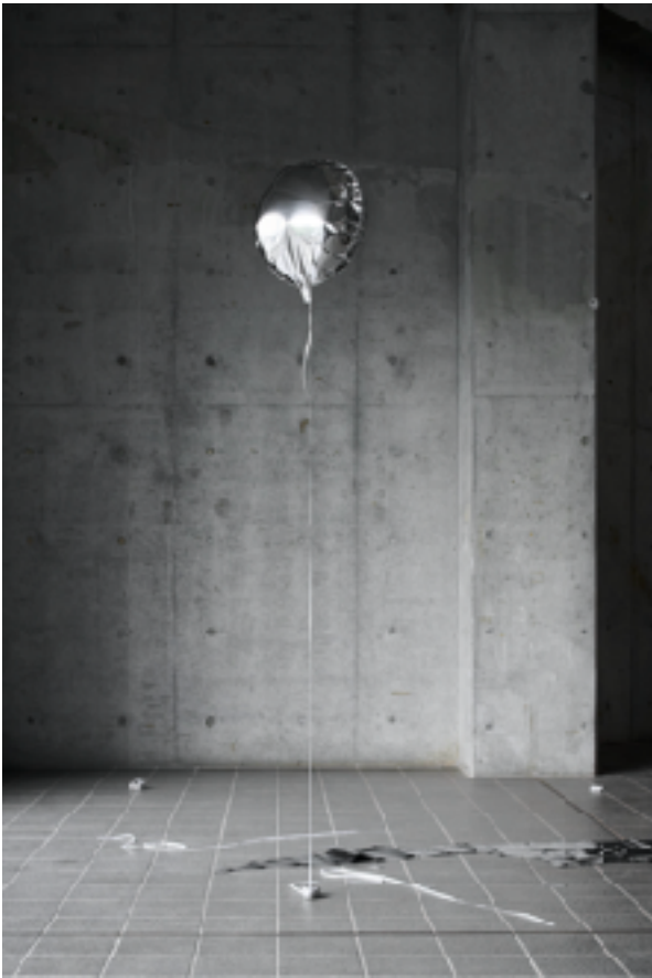
Lateral Thinking 2021 Aluminium, helium, ribbon, dimensions variable