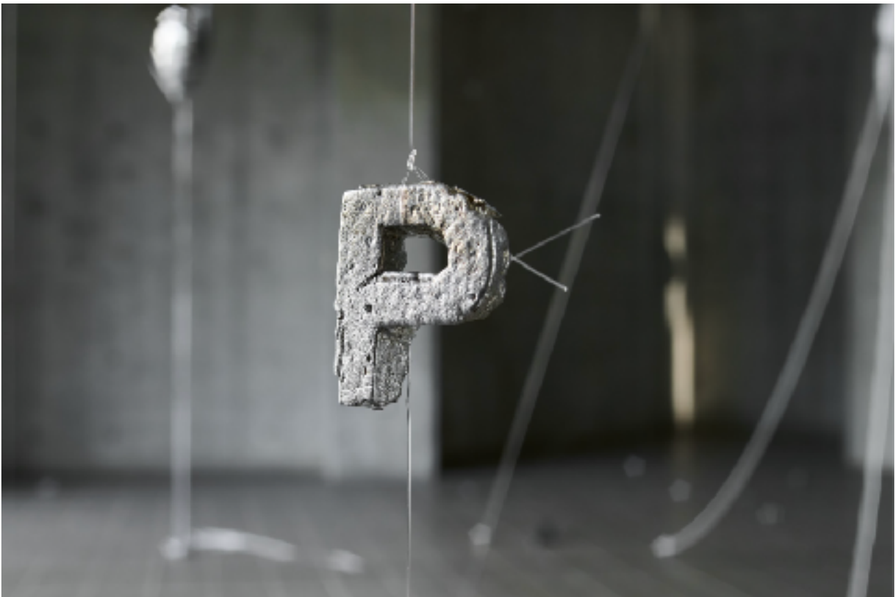
Lateral Thinking 2021

Aluminium, helium, ribbon, dimensions variable