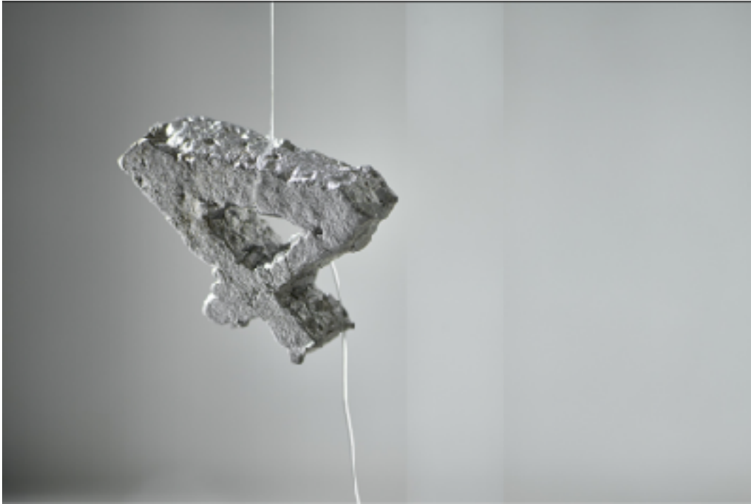
Lateral Thinking 2021 Aluminium, helium, ribbon, dimensions variable