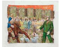
Kathia St. Hilaire, Caco: Charlemagne Péralte , 2023, Reduction linocut in oil-based ink on canvas with skin-lightening cream packaging, steel, aluminum, banknotes, banana stickers, paper, and tires. 55 × 64 in. (139.7 × 162.6 cm) Courtesy of the artist and Perrotin. Photo by Guillaume Ziccarelli