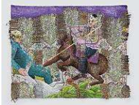
Kathia St. Hilaire, Caco: Benoît Batrville , 2023, Reduction linocut in oil-based ink on canvas with skin-lightening cream packaging, steel, aluminum, banknotes, banana stickers, paper, and tires. 64 × 54 in. (162.6 × 137.2 cm) Courtesy of the artist and Perrotin. Photo by Guillaume Ziccarelli