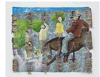
Kathia St. Hilaire, Caco: Rosalvo Bobo , 2023, Reduction linocut in oil-based ink on canvas with skin-lightening cream packaging, steel, aluminum, banknotes, banana stickers, paper, and tires. 63 × 56 in. (160 × 142.2 cm) Courtesy of the artist and Perrotin. Photo by Guillaume Ziccarelli