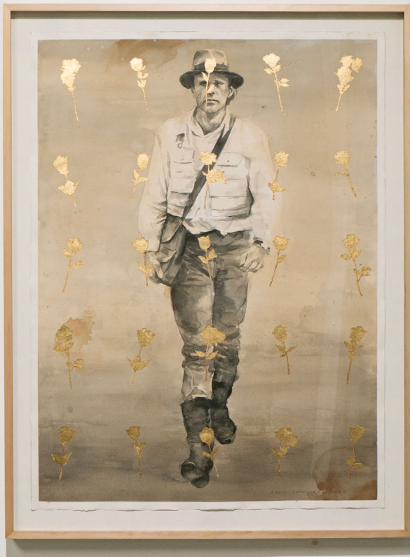
Beuys 2024 Water colour, tobacco juice & gold leaf on paper 114 × 85 cm