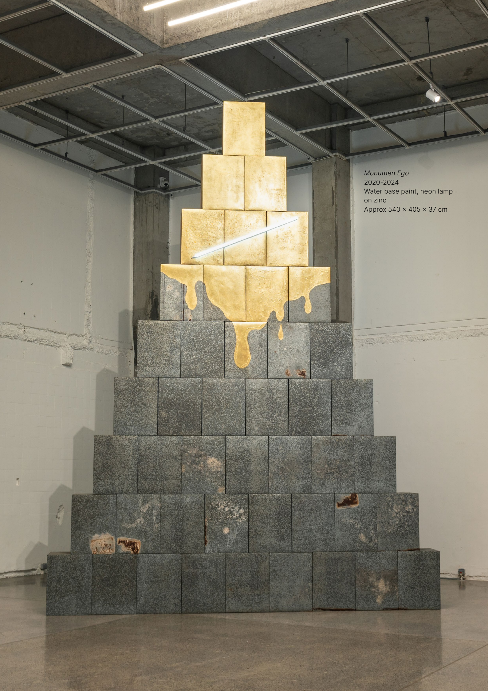
Monumen Ego 2020-2024 Water base paint, neon lamp on zinc Approx 540 × 405 × 37 cm