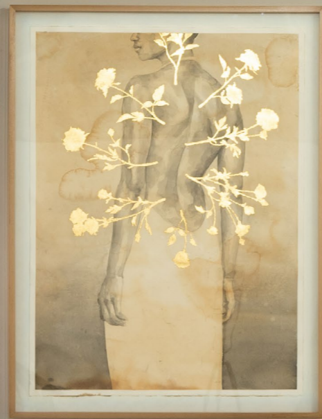
Stigma II - 1 2024 Tobacco juice & gold leaf on paper 114 × 85 cm