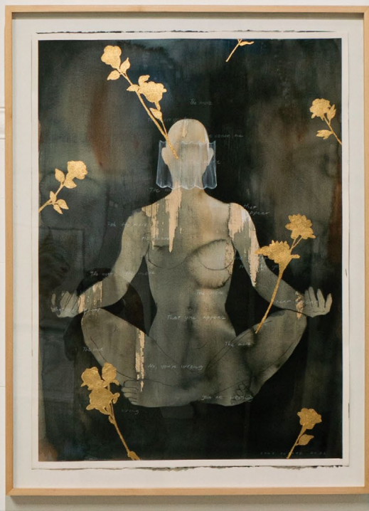
Samadi 2024 Ink, tobacco juice & gold leaf on paper 114 × 85 cm