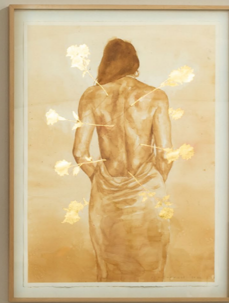
Stigma II - 2 2024 Tobacco juice & gold leaf on paper 114 × 85 cm