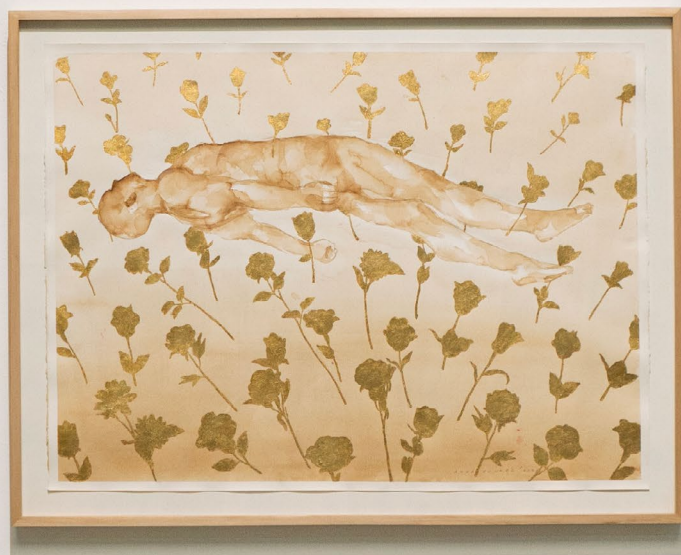
Moksa 2023 Tobacco juice & gold leaf on paper 85 × 114 cm