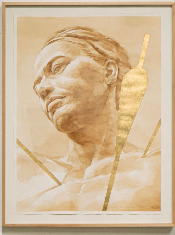
Frida 2024 Tobacco juice & gold leaf on paper 114 × 85 cm