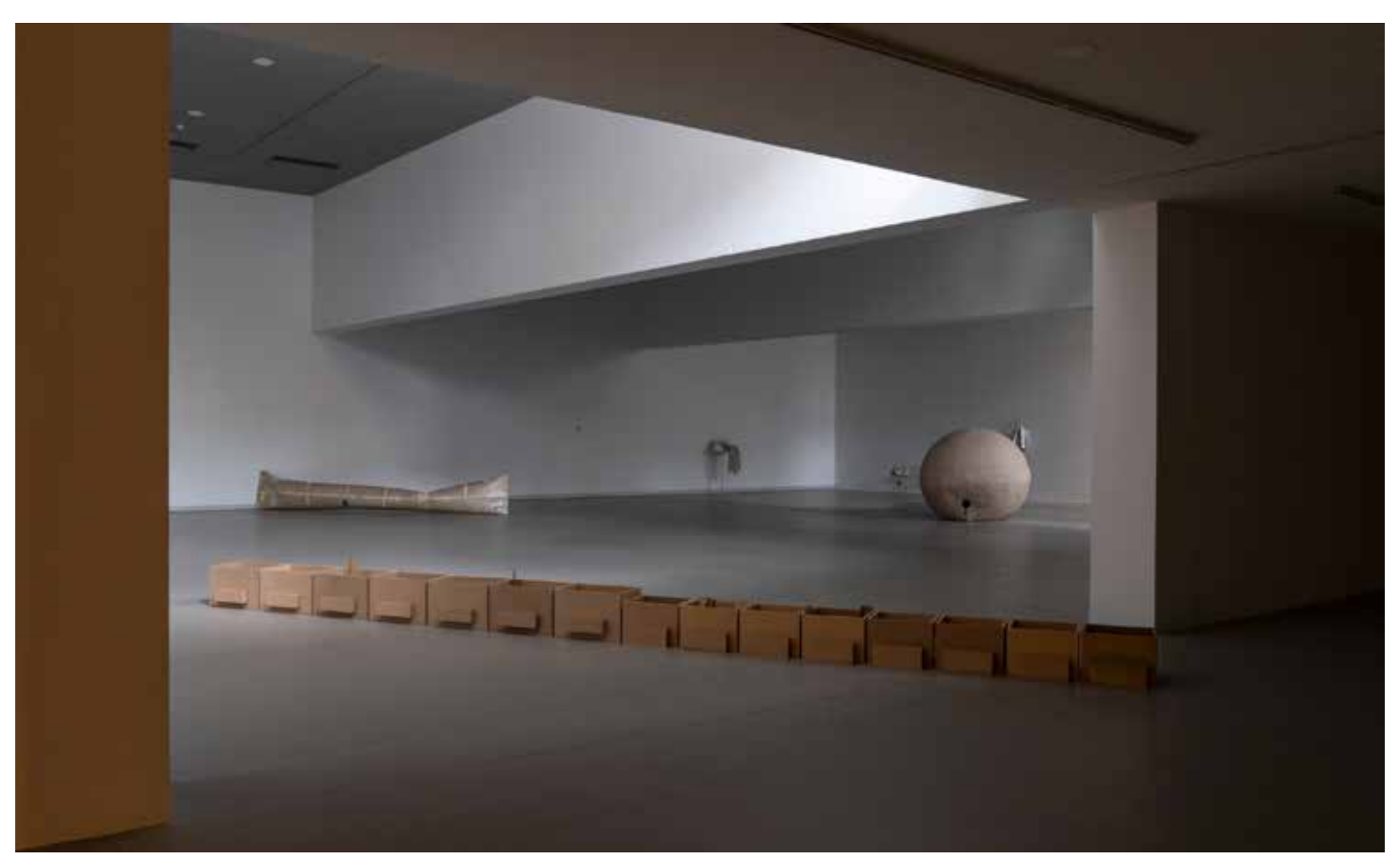
View of the exhibition Регобиа, ქстс, ссріа (2023) at Artium Museoa, Museum of Contemporary Art of the Basque Country. Courtesy of the artist and Ehrhardt Flórez Gallery. Photo. by Nuria González.