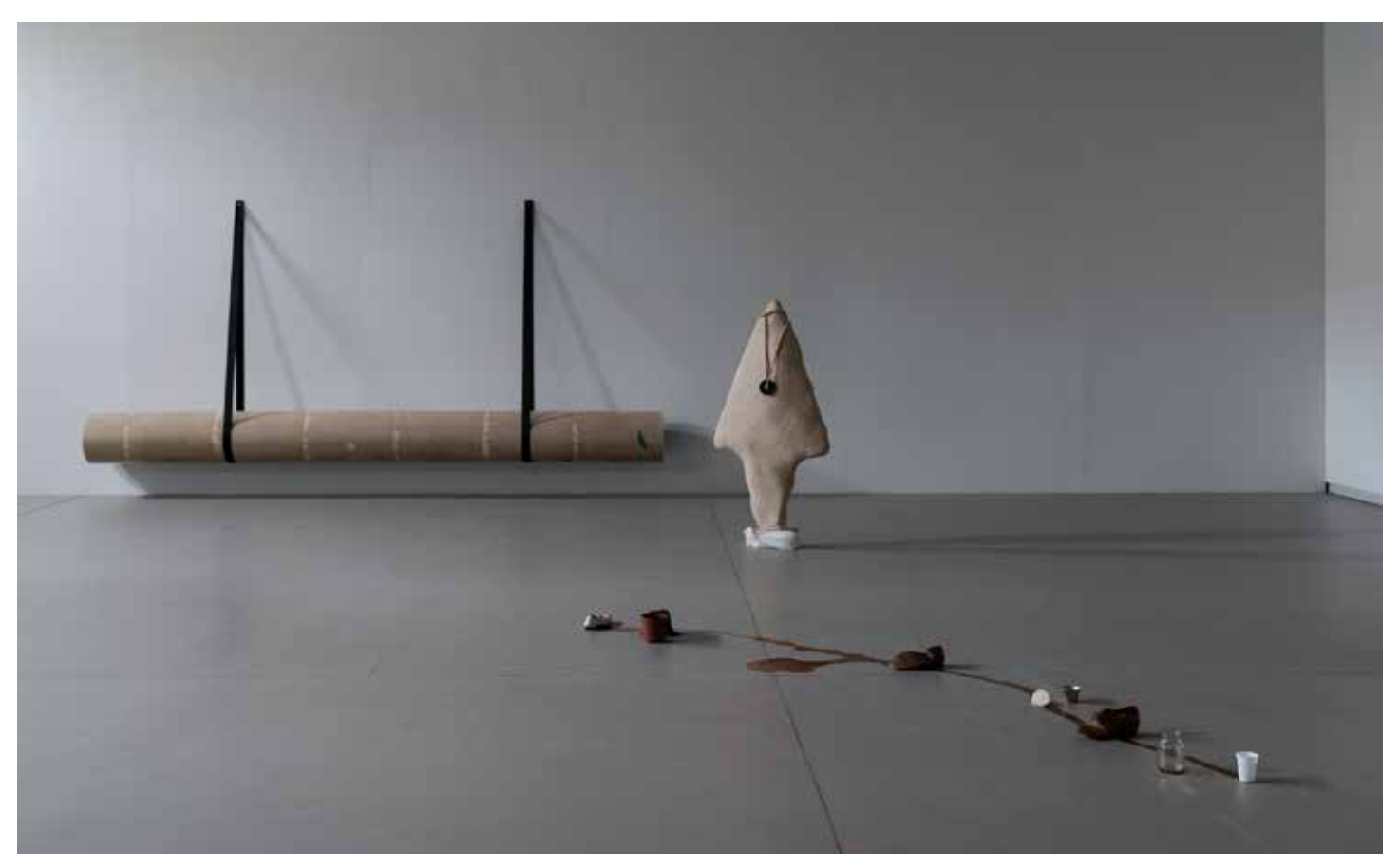
View of the exhibition Регьбиа, ქсть, съріа (2023) at Artium Museoa, Museum of Contemporary Art of the Basque Country.