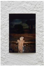
Pamela Ramos Theo , 2024 Inkjet print Edition 1/3 + 1 AP 5.8 x 4 in. (14.7 x 10.2 cm)