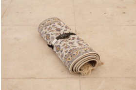
Abbas Zahedi loading loading LA , 2024 Artist's familial runner, secured luggage strap and hand written label [which reads: NAME: soliloquies of / STREET: a sour sadness / CITY: to the cherry that broke / PHONE: with a valiant kiss] 35.5 x 12 x 10 in. (90 x 31 x 25 cm)