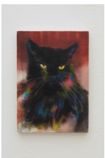
Joseph Jones Rainbow Cat , 2024 Oil and acrylic on linen 11.5 x 8 in. (29 x 21 cm)