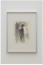
Arthur Marie Untitled , 2023 Pencil on paper 9.8 x 7.5 in. (25 x 19 cm)