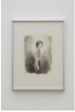
Arthur Marie Untitled , 2023 Pencil on paper 9.8 x 7.5 in. (25 x 19 cm)