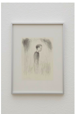
Arthur Marie Untitled , 2023 Pencil on paper 9.8 x 7.5 in. (25 x 19 cm)