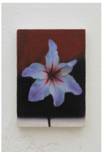
Joseph Jones Lily , 2024 Oil and acrylic on linen 8 x 5.5 in. (21 x 14 cm)