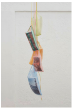
Pamela Ramos Boys Bundle , 2024 Plastic bags, rope, inkjet prints Dimensions variable