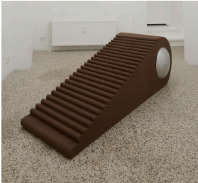
Who is your Wedge, 2024 Wood, cork paint, aluminum 190 x 66.5 x 64.5 cm Ørskov door stopper design