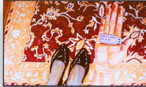
Installation view: Jennifer Levonian, Speed Reader , 2024