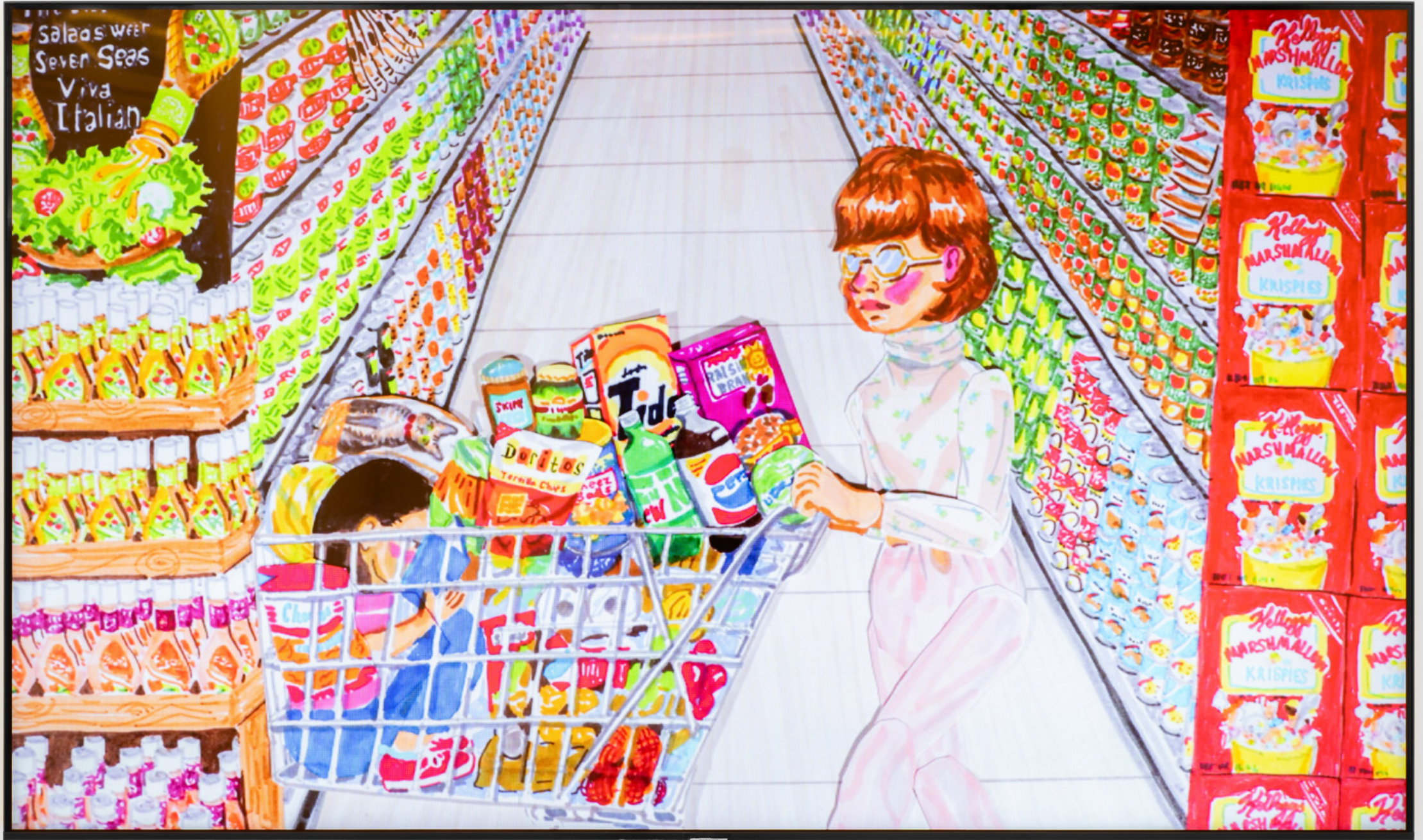
Installation view: Jennifer Levonian, Speed Reader , 2024