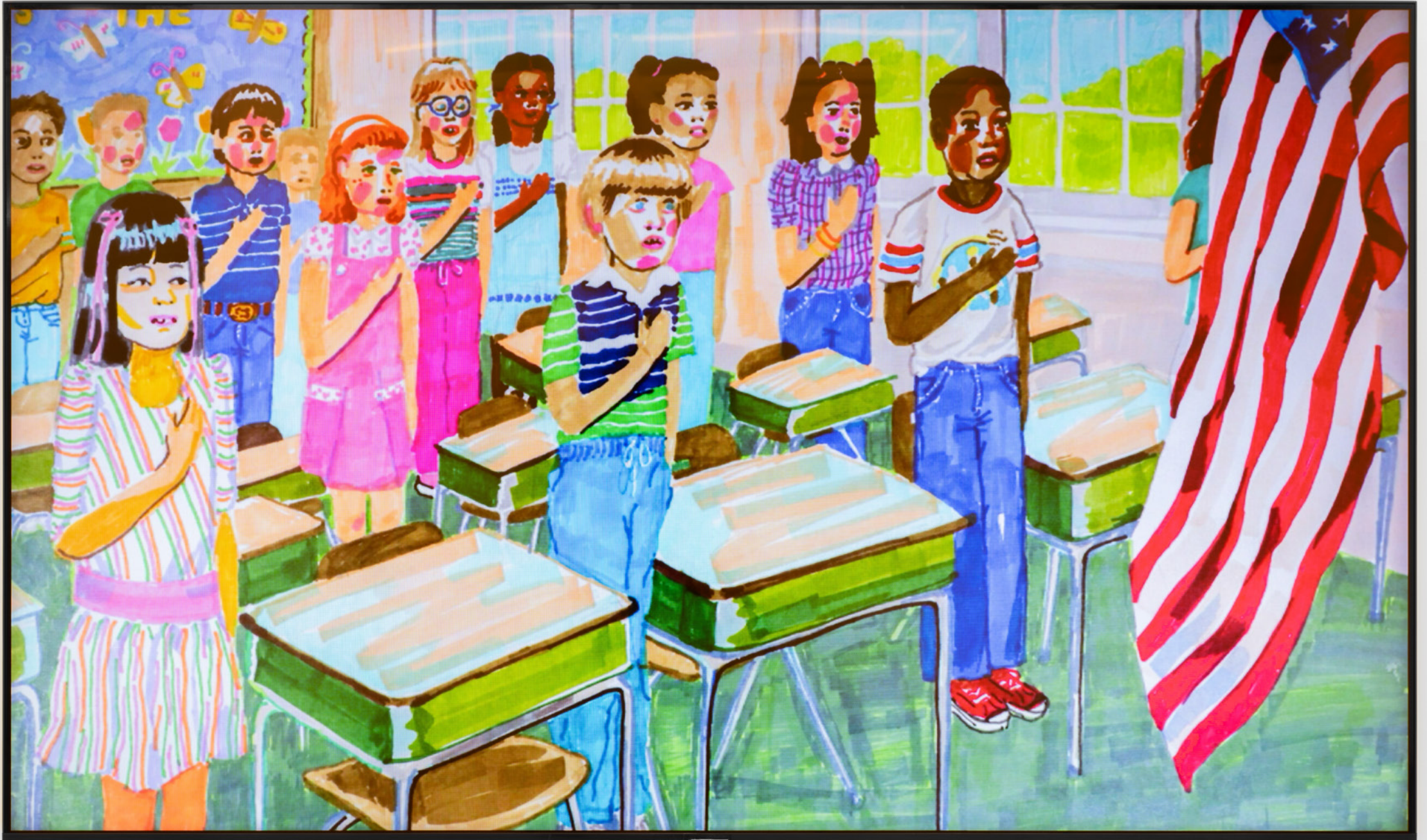
Installation view: Jennifer Levonian, Speed Reader , 2024