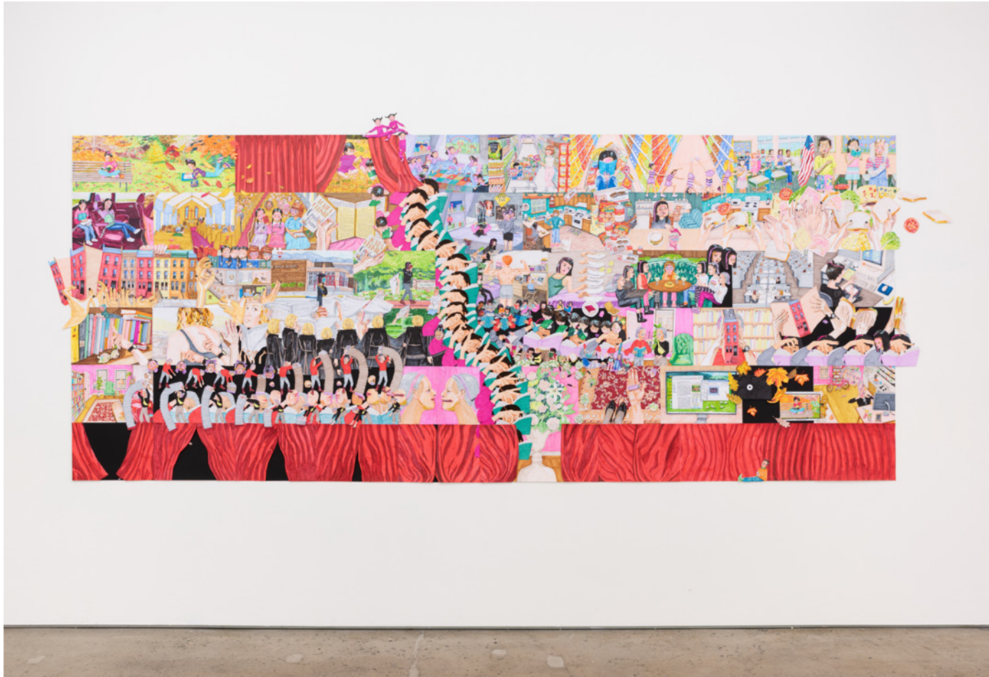
Jennifer Levonian I shut my eyes and the world drops dead, 2024 collage with marker on paper as installed: 75h x 181w in 190.50h x 459.74w cm dimensions variable JLev202402