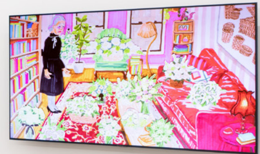
Installation view: Jennifer Levonian, Speed Reader , 2024