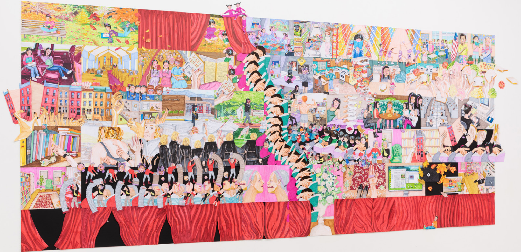
Installation view: Jennifer Levonian, Speed Reader , 2024