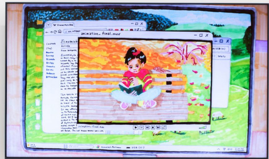
Installation view: Jennifer Levonian, Speed Reader , 2024