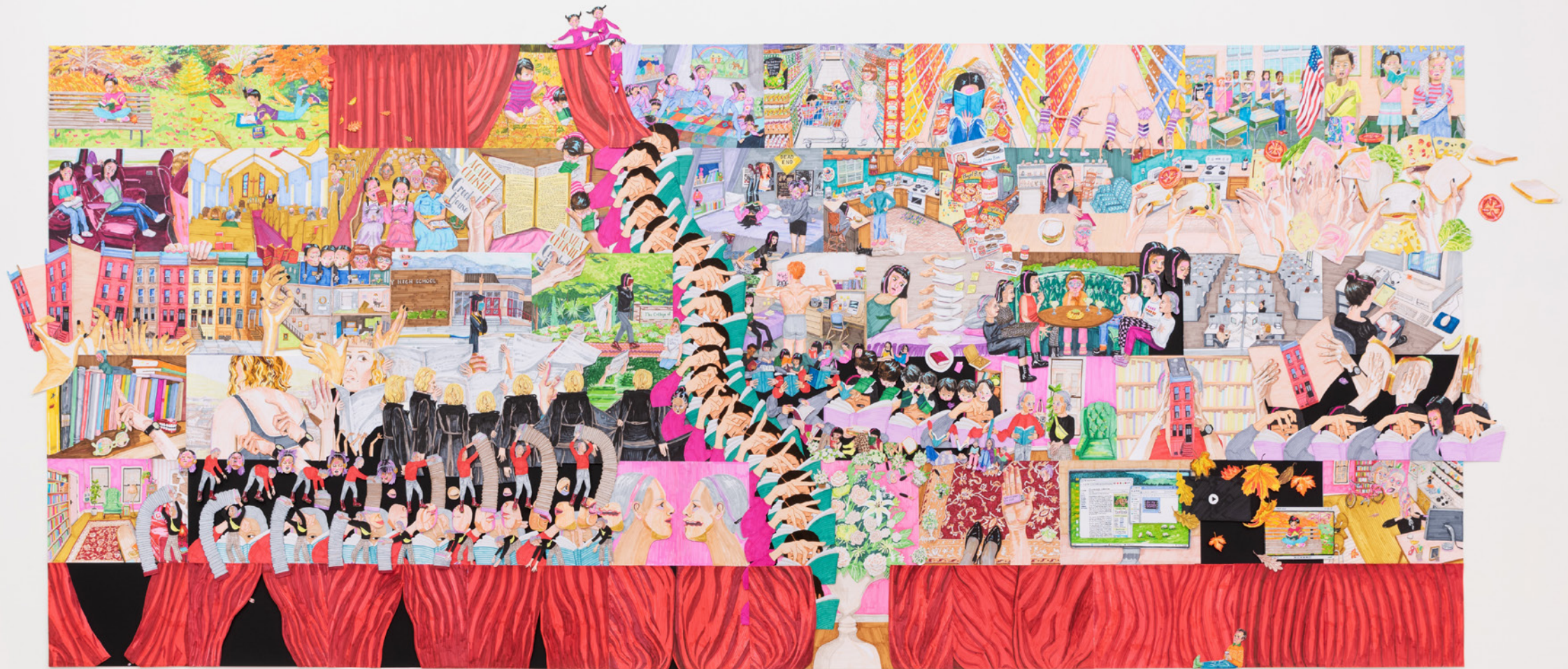
Installation view: Jennifer Levonian, Speed Reader , 2024