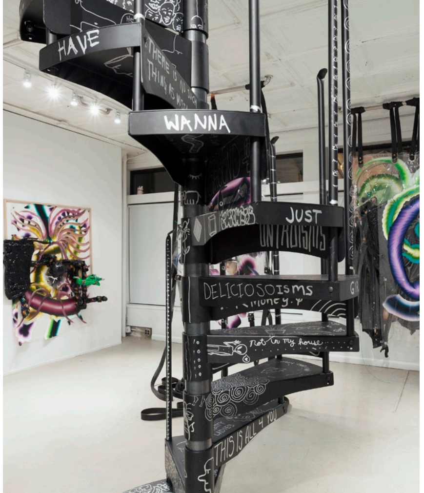
Untitled, 2013 (detail)