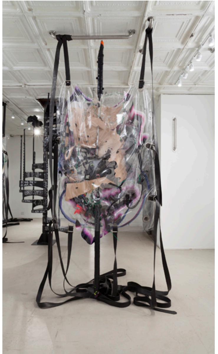
S is for stress positions (bodybag backzip) , 2013 oil on mylar, customized belts, grommets, vinyl, epoxy, aluminum, vinyl wire, wig, urethane, peened grab bars 115 x 48 x 12 in/ 292.1 x 121.9 x 30.5 cm