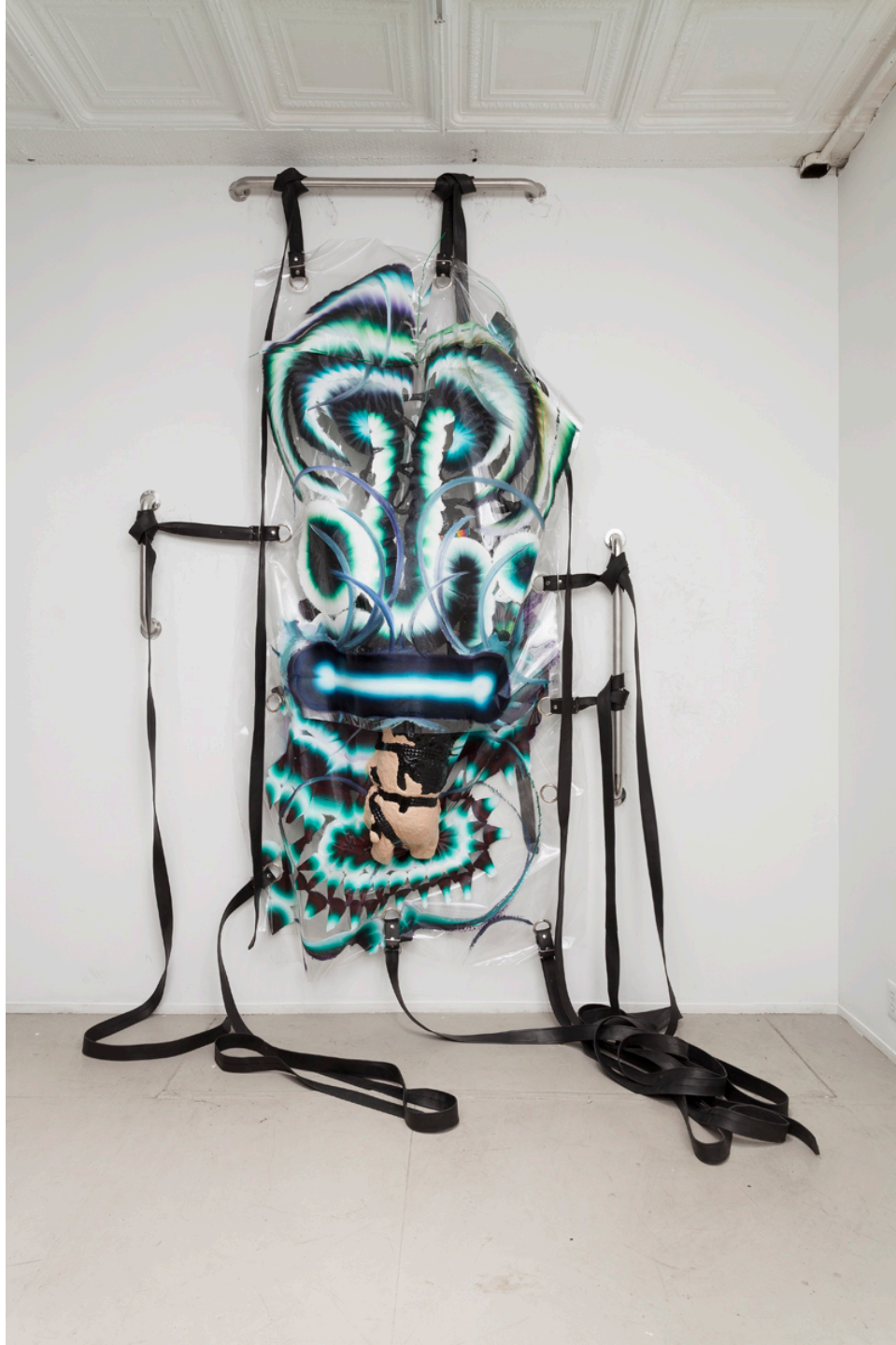
S is for spanking (bodybag dicknose) , 2013 oil on mylar, customized belts, grommets, vinyl, epoxy, peened grab bars 104 x 48 x 12 in/ 246.2 x 121.9 x 30.5 cm