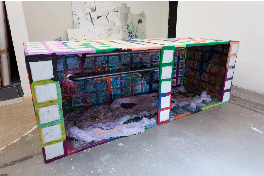
Untitled , 2012 Kerstin Brätsch, Debo Eilers, KAYA epoxy, silicone, wood tiles, grab bars