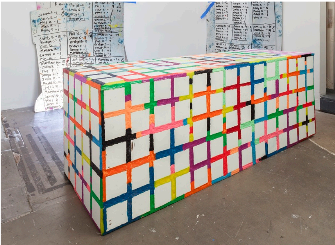
Untitled , 2012 (alternative view)