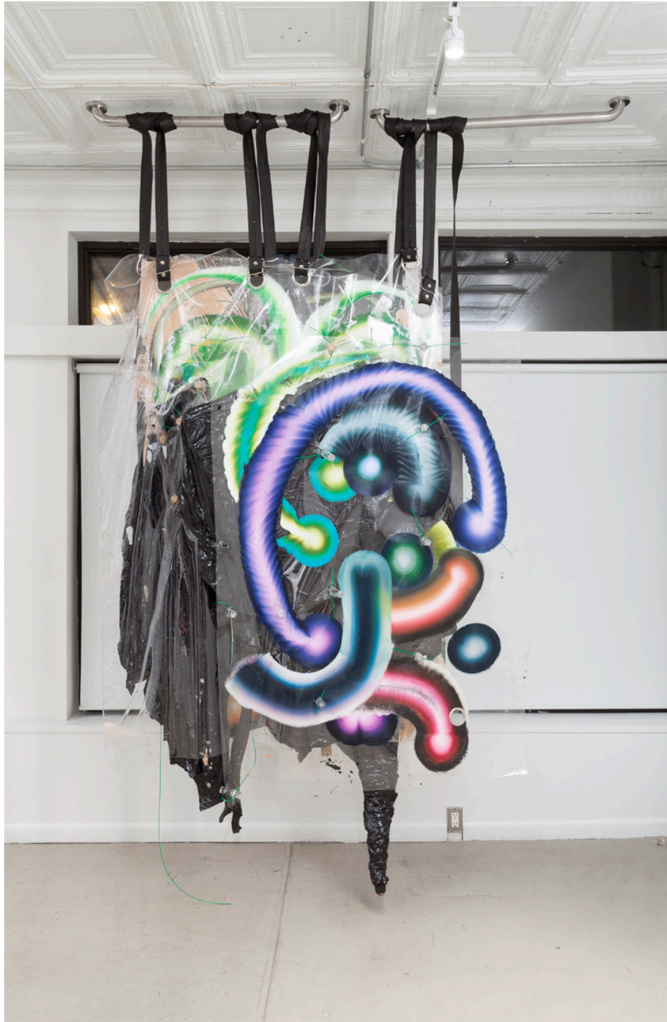
S is for Sissy (bodybag meo) , 2013 oil on mylar, customized belts, grommets, vinyl, epoxy, acrylic rods, vinyl wire, cotton, peened grab bars 96 x 67 x 10 in/ 243.8 x 170.2 x 25.4 cm