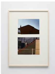
Dan Graham “Site View of Two Tract “2 House Home” Units, Staten Island, N. Y. / Steps and Surrounding Houses From Backyard, Bayonne, N. J.”, 1978/1975 2 color photographs Top: 24.9 x 34.6 cm Bottom: 27.9 x 35.4 cm Framed