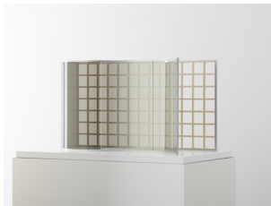
Dan Graham “Model C”, 2022 Architectural model; two-way mirror, frame, glass, wood 100 x 175 x 91 cm Edition 2 of 3