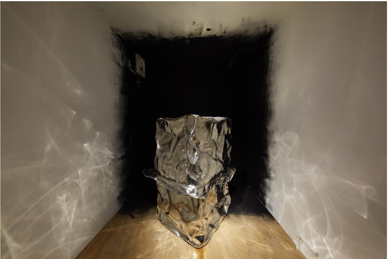
Masahiro WADA, Songs For My Son (Koganecho-2024) , 2024