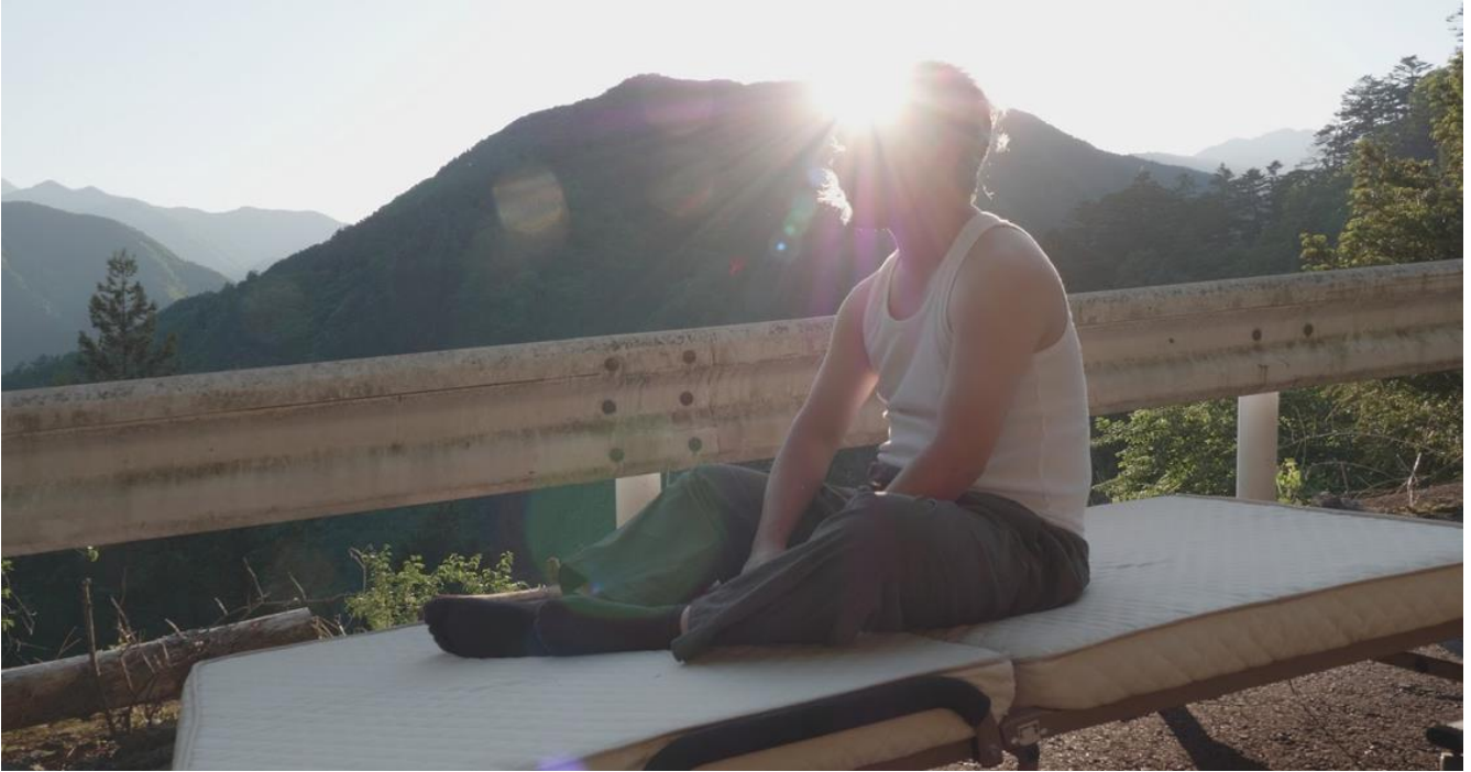
Atsushi YAMAMOTO, About Dignity , 2024