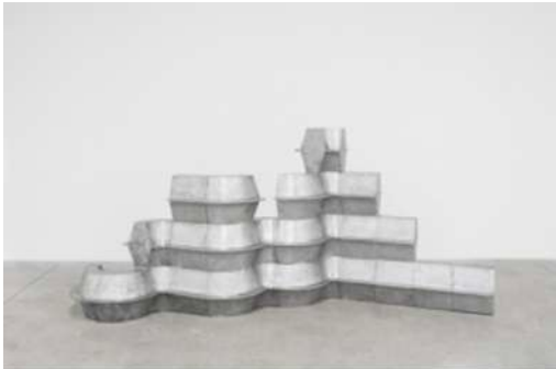
Eduardo Paolozzi, Pan Am , 1966