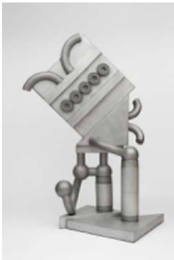
Eduardo Paolozzi, Giroto , 1964