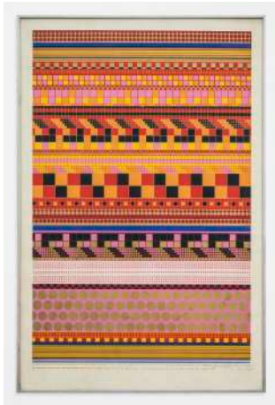
Eduardo Paolozzi, Theory of Relativity , 1967 Screenprint on paper (upstairs)