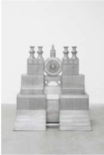
Eduardo Paolozzi, The Twin Towers of the Sfinx - State II , 1962