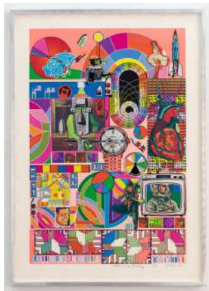
Eduardo Paolozzi, B.A.S.H. , 1971 Screenprint on paper (upstairs)